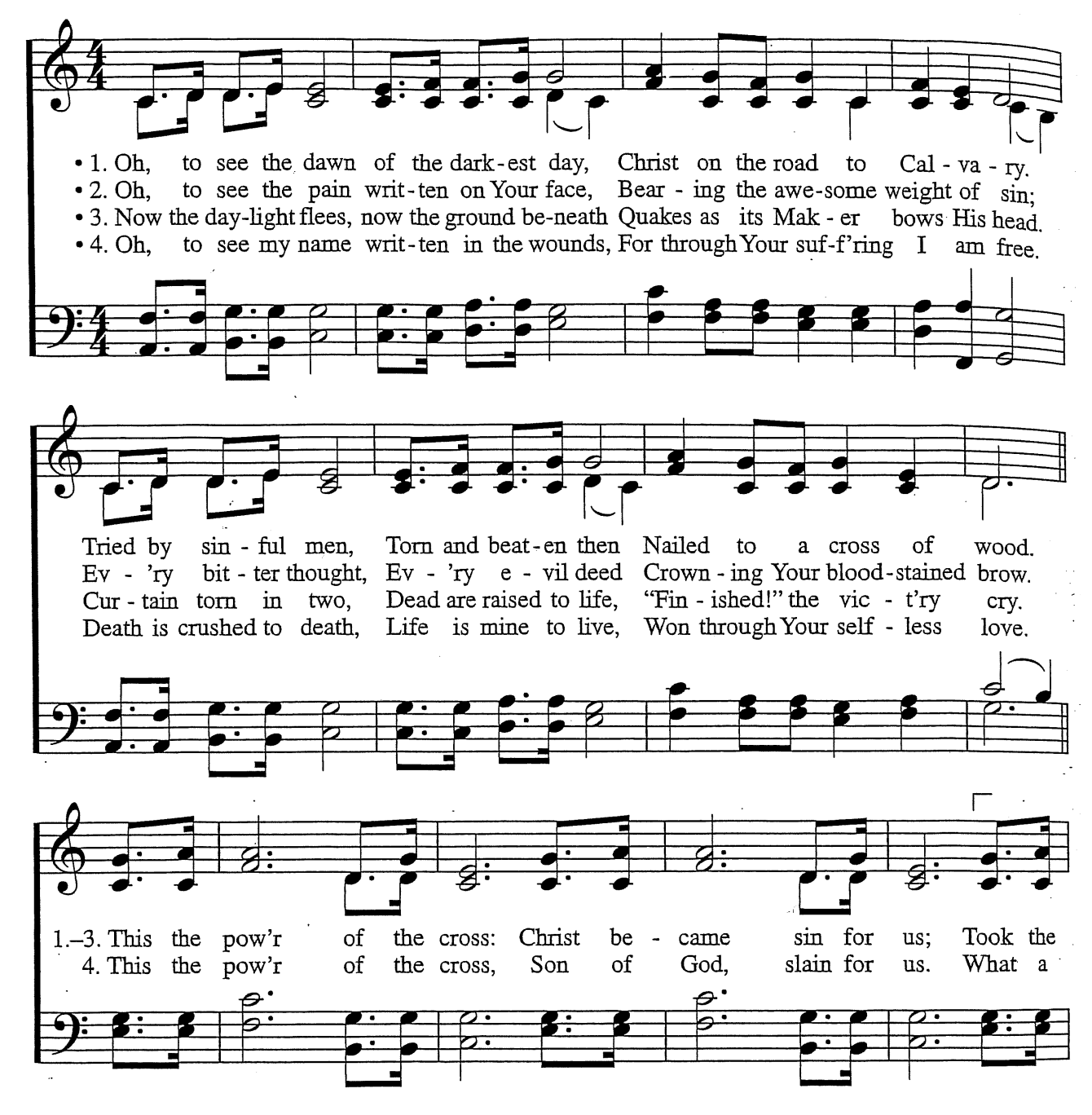
The Power of the Cross