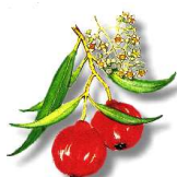
'Quandong' painted by Rosemary Pedler