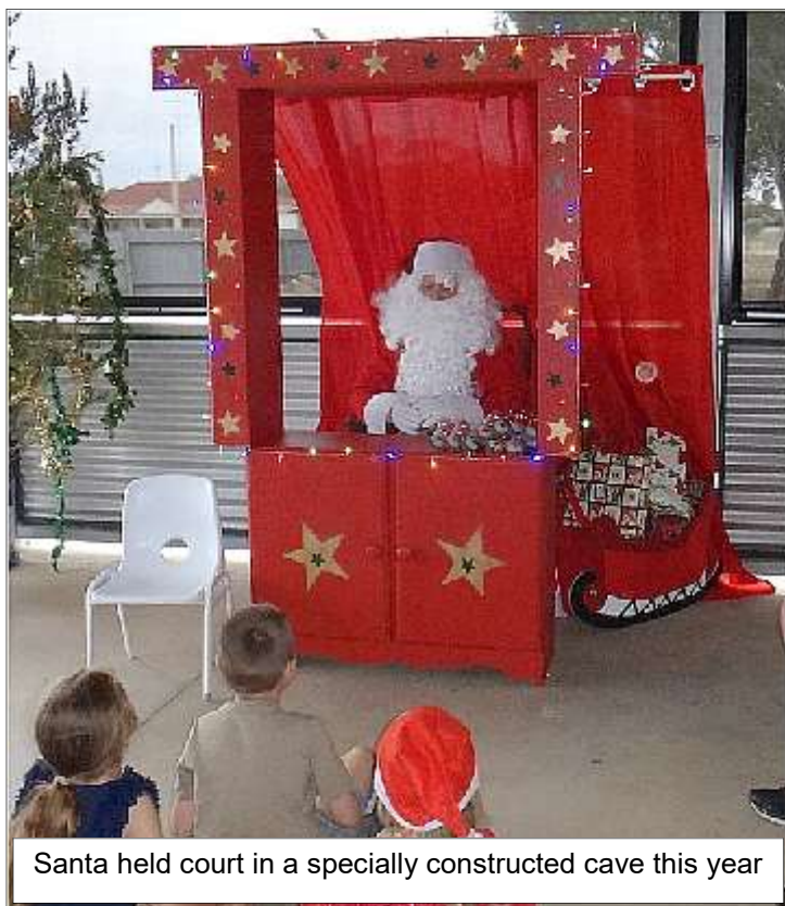
Santa held court in a specially constructed cave this year