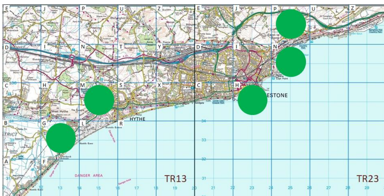
Figure 3: Distribution of all Purple Heron records at Folkestone and Hythe by tetrad