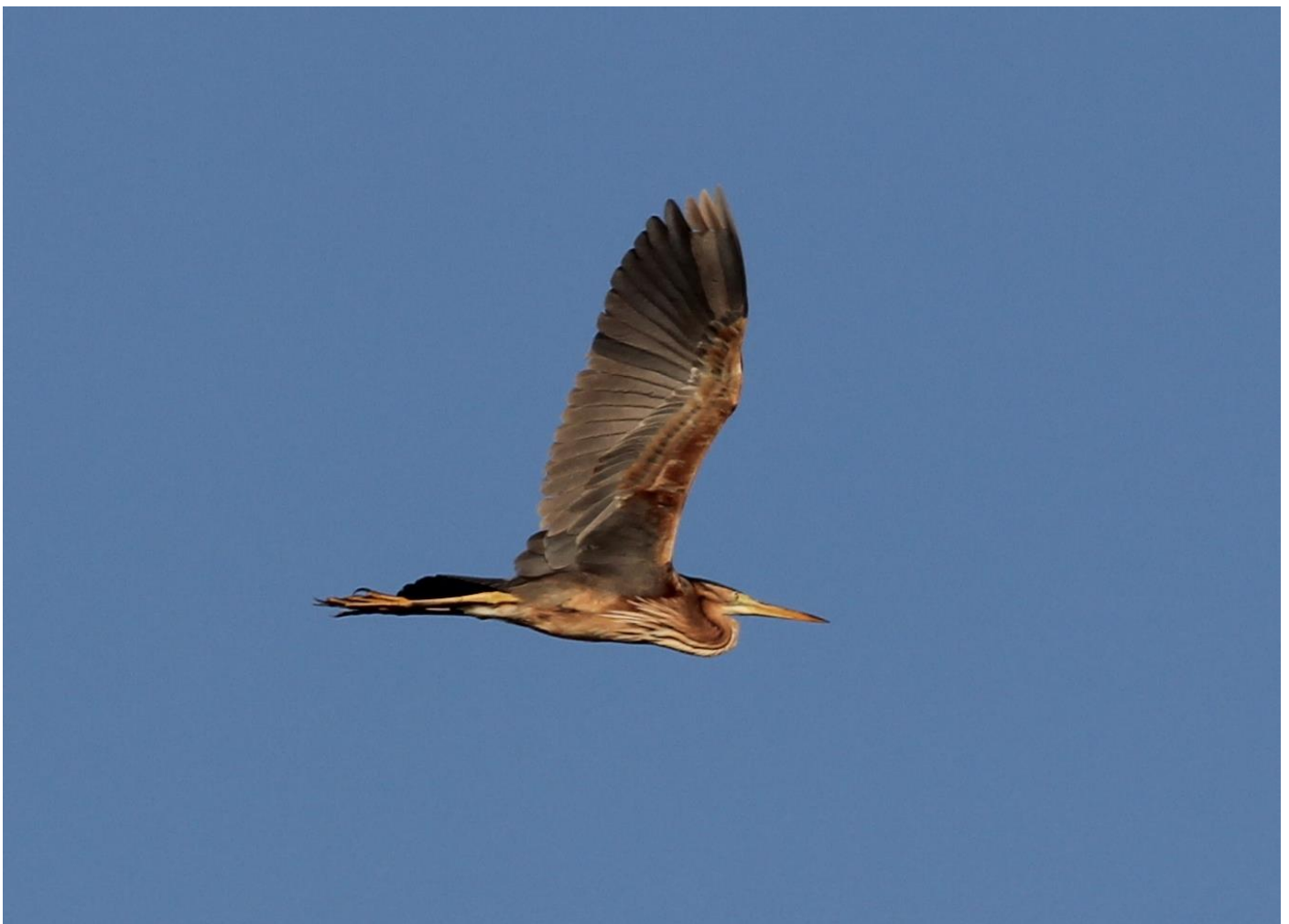
Purple Heron at Nickolls Quarry