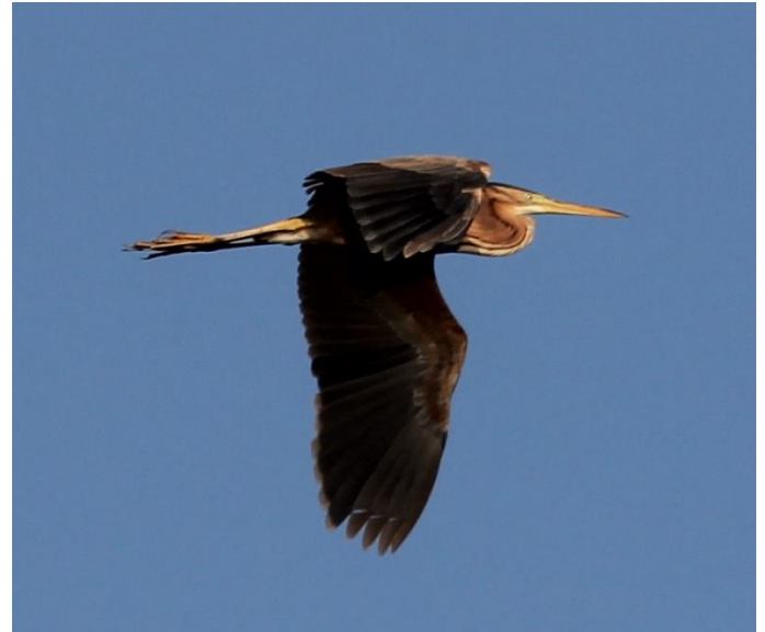
Purple Heron at Nickolls Quarry (Ian Roberts)

The Purple Heron was considered to be a national rarity until 1982 when the British Birds Rarities Committee removed it from the list of species that it would assess (Grant et al. 1982), at which time a total of 425 records had been logged in Britain, with an average of around 18 per annum. Despite its decrease in range across Europe the number of migrants reaching Britain has remained fairly consistent, with annual averages of around 20 in the 1980s, 1990s and 2000s. There have even been signs of a recent increase, with an annual mean of 26 in the 2010s and a record total of 42 noted in 2020 (White & Kehoe 2022). It first bred successfully in Britain in 2010 at Dungeness (Holling et al. 2012). In Kent April and May accounting for the majority (55%) of records (KOS no date).