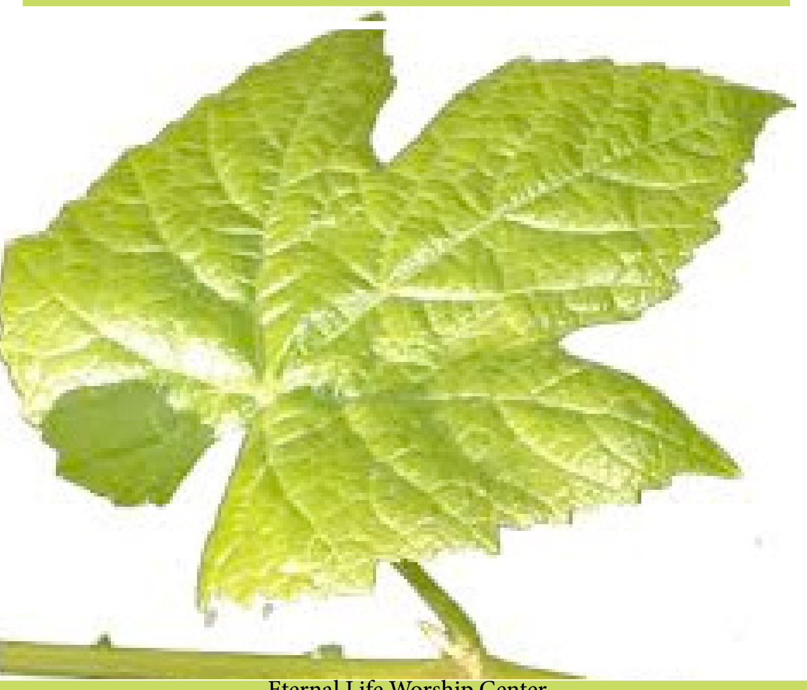
Eternal Life Worship Center 865 Woodstock Road, Virginia Beach, VA.23464