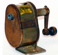
A pencil sharpener - remember this on the teacher's desk?

Our next Open Day will be held on Sunday 18 th November 2012. Don't miss the visiting Display of Vietnam militaria!