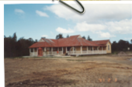
The Old Courthouse Museum on 3 Feb 1997. This photo was taken shortly after the move to its current site

The Department of Education also gave the Society Nelligen's former one-room schoolhouse, and the two buildings have been roofed as one historic precinct.