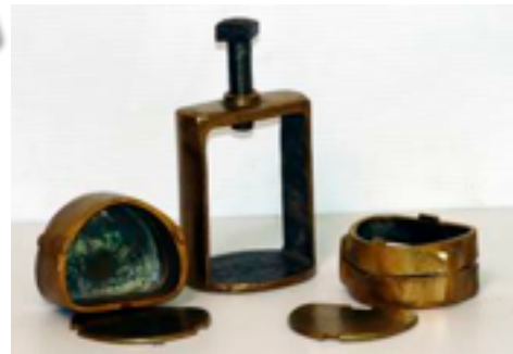
A denture making device - this one was "home" made

It's a big job and for the first time, our Museum will have a readily accessible record of what we hold and where it is in the Museum.