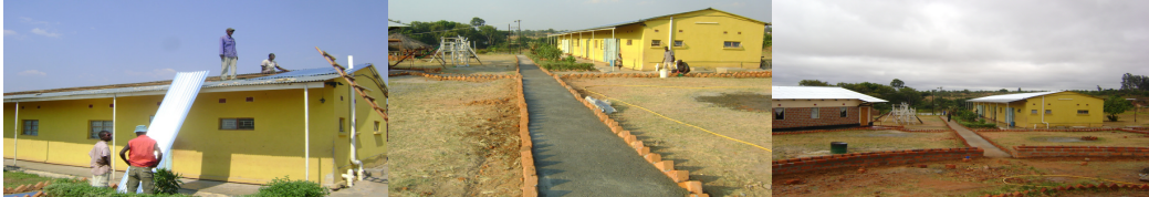
Dormitory reroofed and path ways done

The old dormitory roof has been repaired and there is no leaking expected. Currently, the front wall is being built. The drainage system and the orphanage paths and loans are being improved. The laundry ironing bench and the clothing shelves are in progress of being made.