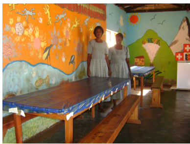
Kitchen benches on mats

It has been interesting that the sewing of 18 uniforms for Kambobe School and one for Boma School going children have been completed. What is remaining is to fix buttons to all uniforms. This will assist the children to look smart when going to school because they have two pairs of uniform. If possible there is need for monies to buy material to sew for the other remaining children by the beginning of next year and a mortar to make sewing easier.