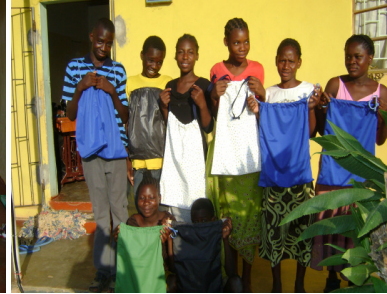
school bags made

Children are now happy to have footwear/sleepers to put on when moving around the orphanage. It has assisted in not dirtying their beddings.