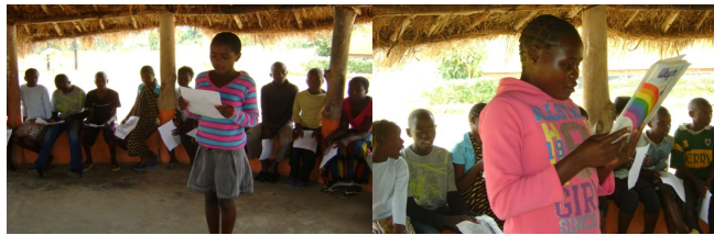
Reading programme in progress

The "Read Everyday" programme has successfully continued while baring fruits. Children are standing out to read and learning to read fluently.