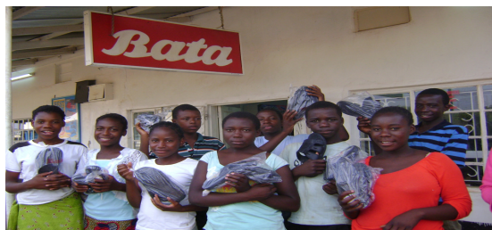
Clothing allowance in use(footwear bought)

Children are now happy to have footwear/sleepers to put on when moving around the orphanage. It has assisted in not dirtying their beddings.