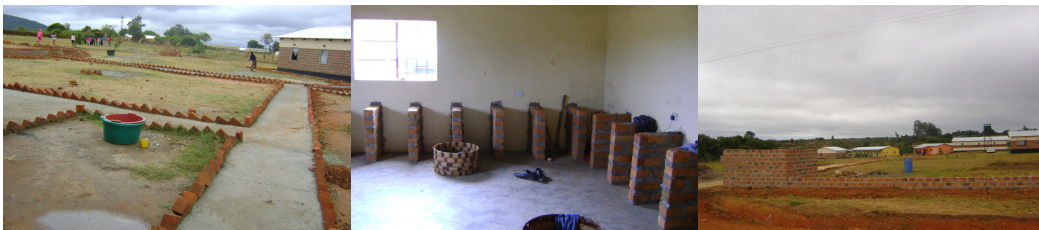
Surrounding loans nicely done, laundry shelves and front half wall fence in progress