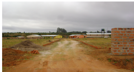
Entry road being nicely done