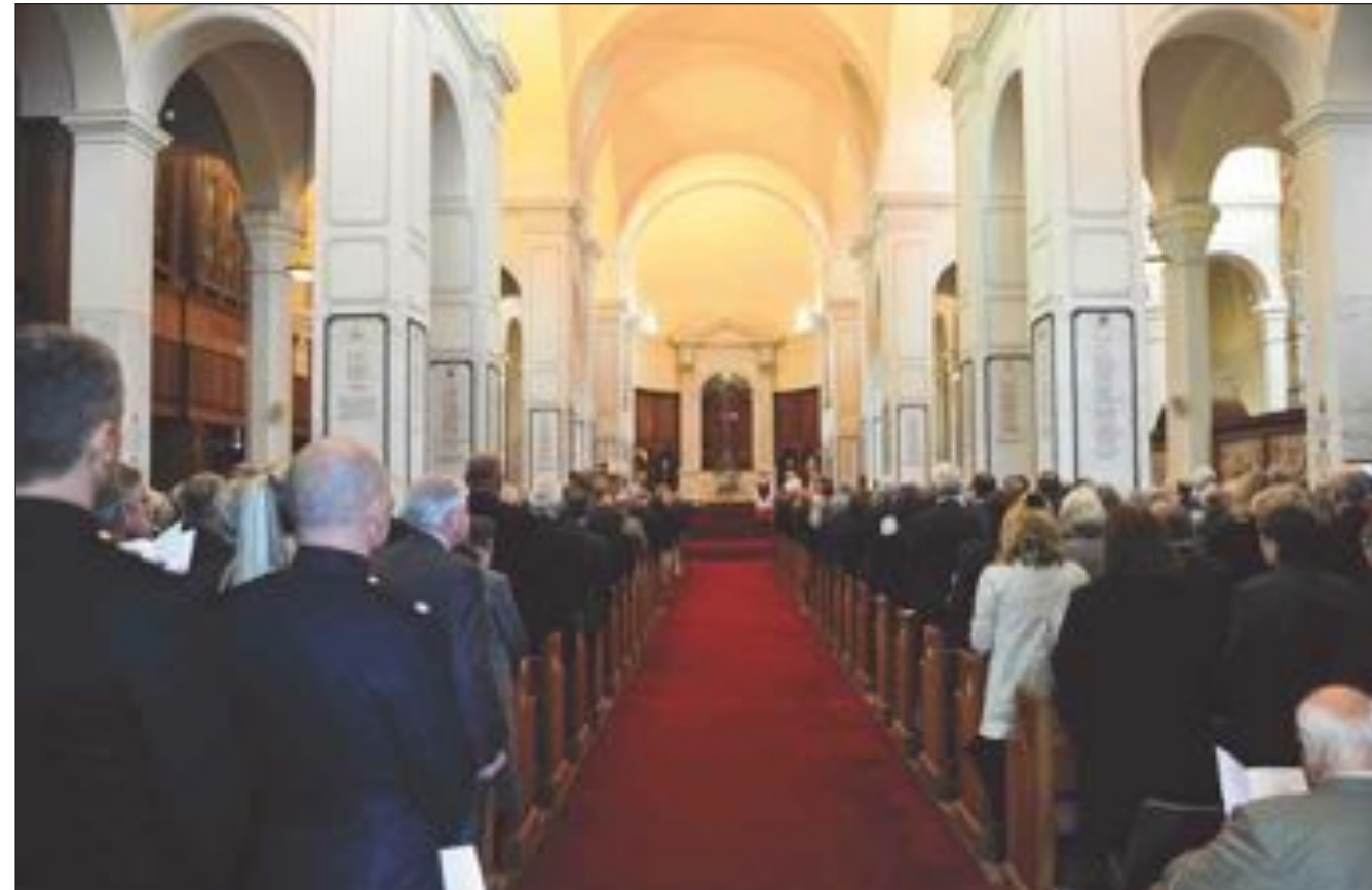
The packed Chapel at Sandhurst - Members of 2 PWRR acted as route liners on the approach to the Chapel outside and Officers acted as ushers inside