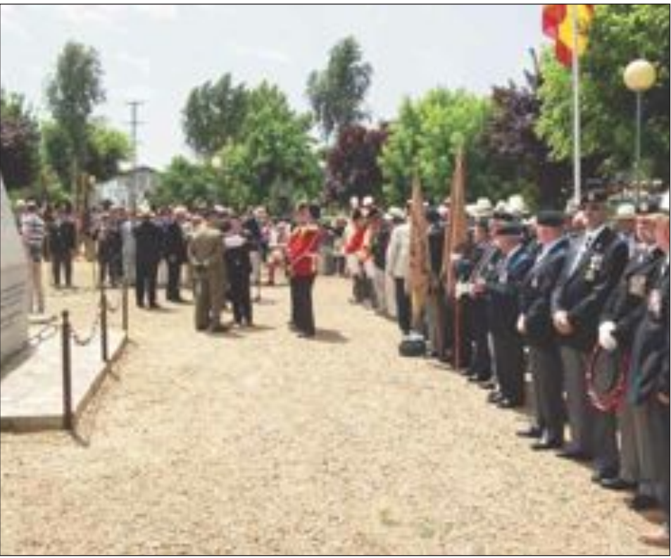
Regimental Comrades await the start of the Ceremony at the Regimental Memorial, Albuhera