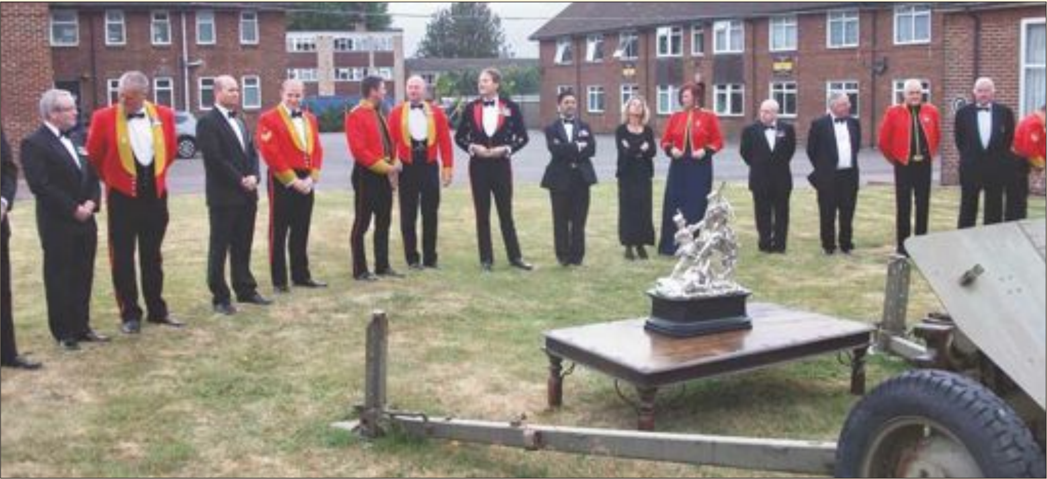
Members of 3 PWRR and guests prepare to take part in The Albuhera Silent Toast at Leros Barracks, Canterbury