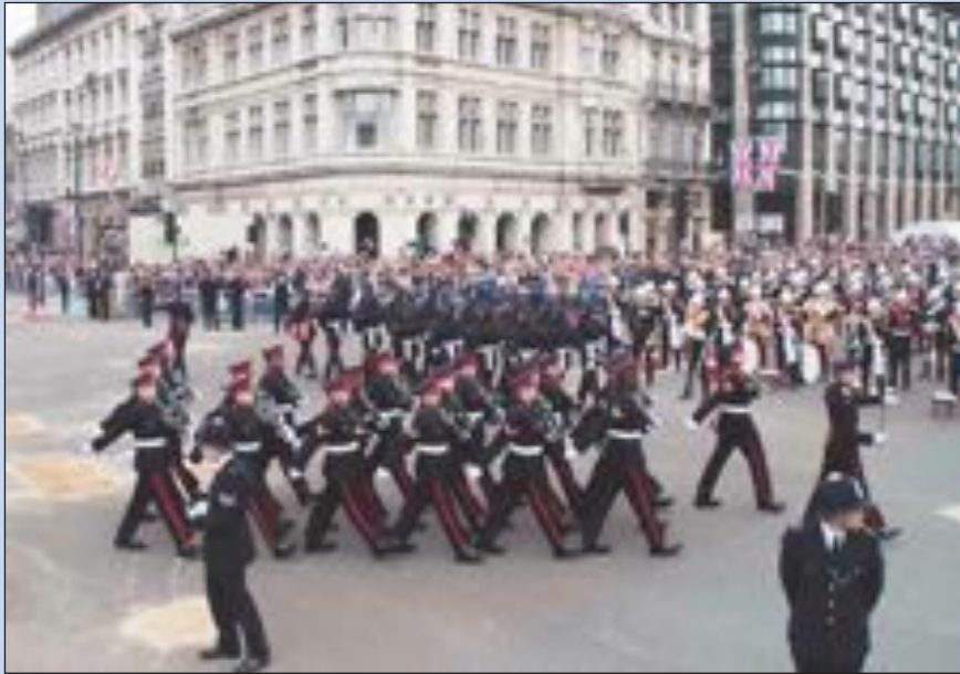
Preparing for Route Lining