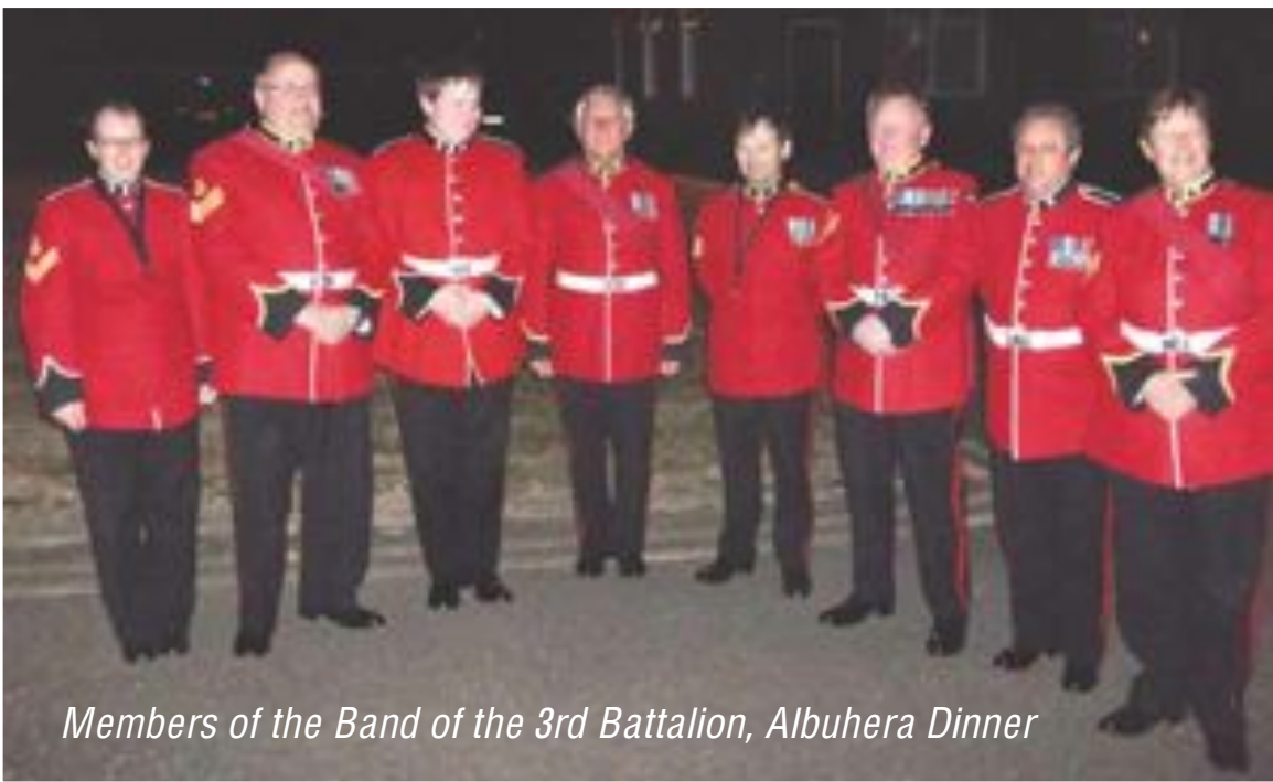
Members of the Band of the 3rd Battalion, Albuhera Dinner