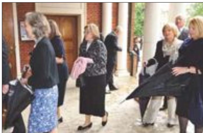
Friends and Relatives entering the Chapel