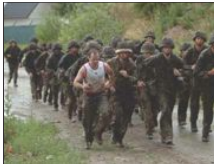
A gentle march with the PTI

Although the main effort has been preparing for operations, the Battalion has also maintained its strong work and play ethos. As such it has continued to celebrate Regimental Events and participated in both individual and team representative sport. In particular the Battalion has achieved notable success in rugby, sailing, football, athletics and boxing over recent months and sent a team to support the 200th Anniversary celebrations at Albuhera. Running concurrently with preparation for deployment is the 'Tigers in Afghanistan' charity fundraising initiative. This has been focused on raising funds for the welfare of soldiers within the Battalion, and has a target of £60,000. Within the 1st Battalion, significant amounts have already been raised through 'Taches for Tigers' (a moustache growing competition) and a boxing evening. We have also been humbled by the support we have received from within the recruiting area from families and friends who continue to publicise and fundraise on behalf of our soldiers. In conclusion the 1st Battalion, through the combination of training, sport, and a little fun, has earned the right to enjoy a little 'Fierce Pride'.