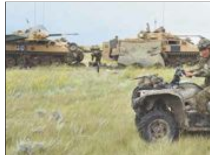
BATUS Training - Nov 2010

The Battalion is in the middle of training in preparation for their forthcoming tour of Afghanistan (Operation Herrick 15). The Battalion has taken on the lead for the Police Mentoring Role in Afghanistan and, under the control of Fire Support Company, has formed the Police Mentoring and Advisory Group – clearly marked as the Brigade Commander's Main Effort. The three rifle companies have been designated as ground holding companies and will deploy into Nadi Ali (South), Nar e Saraj (South) and Lashkar Gah Battle Group areas of operation. Having completed Hybrid Foundation Training (which culminated in a Battle Group exercise in BATUS (Canada) the last six months has seen the Battalion concentrate its training in a wide variety of individual mission-specific courses. This has included specialist vehicle qualifications, language training, weapon training and medical training. Once the individuals have been trained the companies have been collectively tested in live firing exercises at Otterburn and by Castle Martin and by OPTAG with the Confirmatory Test Exercise held in Thetford. They are now preparing for the final exercise element of their training – due to be held on Salisbury Plain in August.