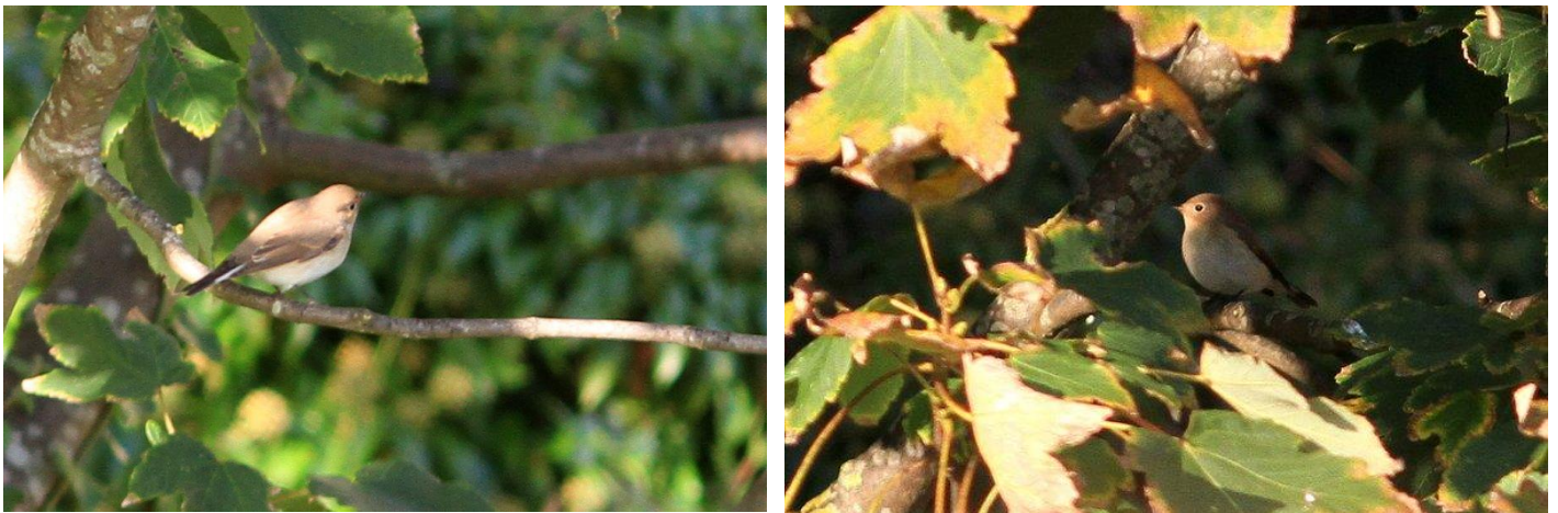
Red-breasted Flycatcher at Samphire Hoe

The tetrad map images were produced from the Ordnance Survey Get-a-map service and are reproduced with kind permission of Ordnance Survey .