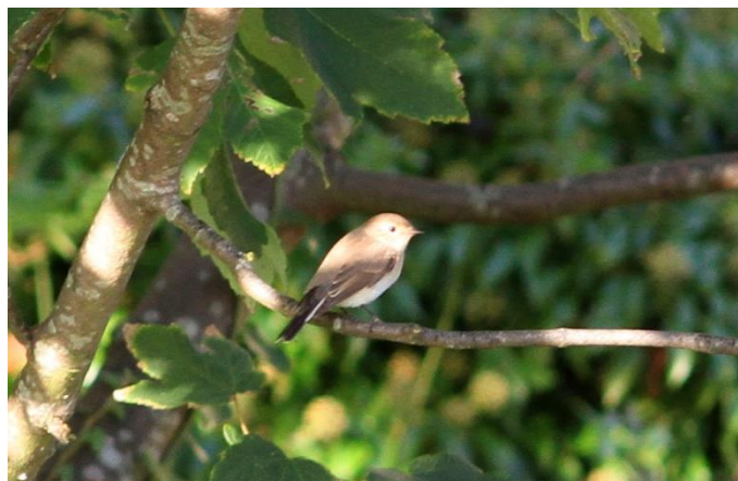
Red-breasted Flycatcher at Samphire Hoe (Phil Smith)

Breeds across mid-latitude Europe from eastern Germany eastwards through Russia and Siberia to Kamchatka and Sakhalin island, and south-east into the Balkans to Iran. Winters in southern Asia, from Pakistan and India east to southern China (Snow & Perrins, 1998).