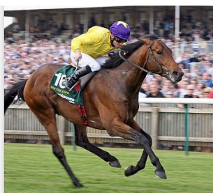
Sea The Stars 3 ¼ l.