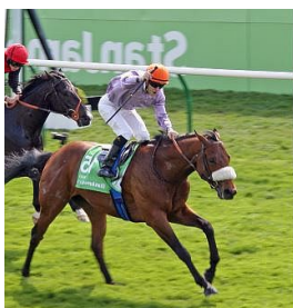
Makfi 6 ¼ l.

Time ranking 2,000 Guineas winners 2000 – 2014, with stud fees