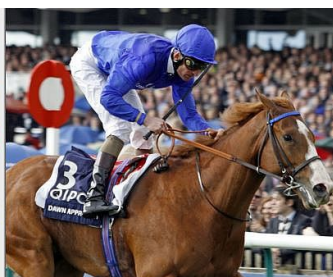
Dawn Approach 3 lengths