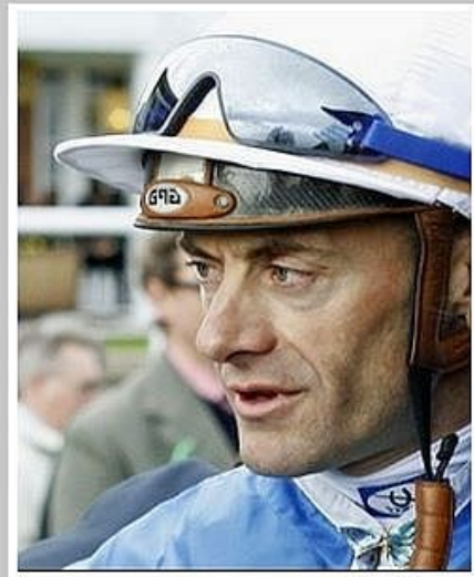
Jockey Olivier Peslier:

"Cockney Rebel was a super horse, with an outstanding finish.