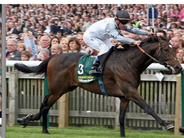
COCKNEY REBEL 1:35.2

Cockney Rebel was fast. Very fast. As was his sire Val Royal . He set a record for the Breeders' Cup Mile when clocking 1:32.0 at Belmont Park in 2001. Only Wise Dan, who won over the much quicker Santa Anita course, has bettered this sharp time.