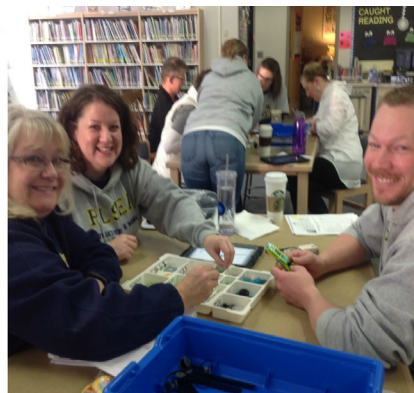
Staff put their E-STEM skills to a test!