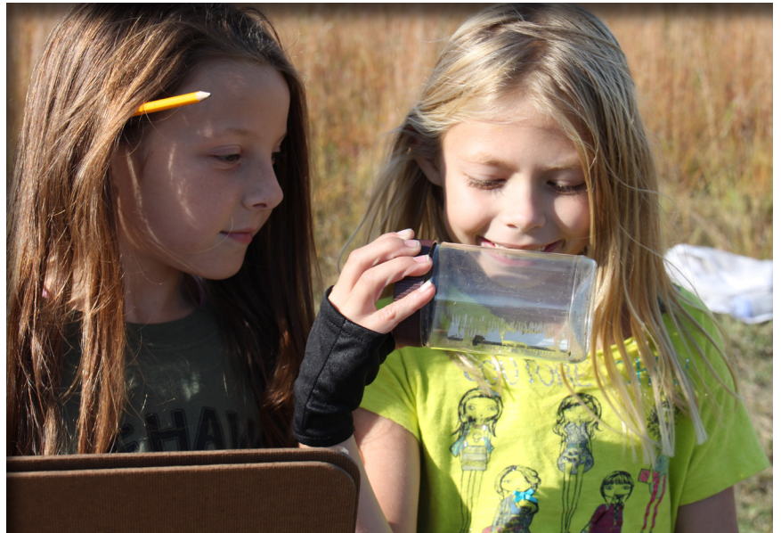
E-STEM in Action