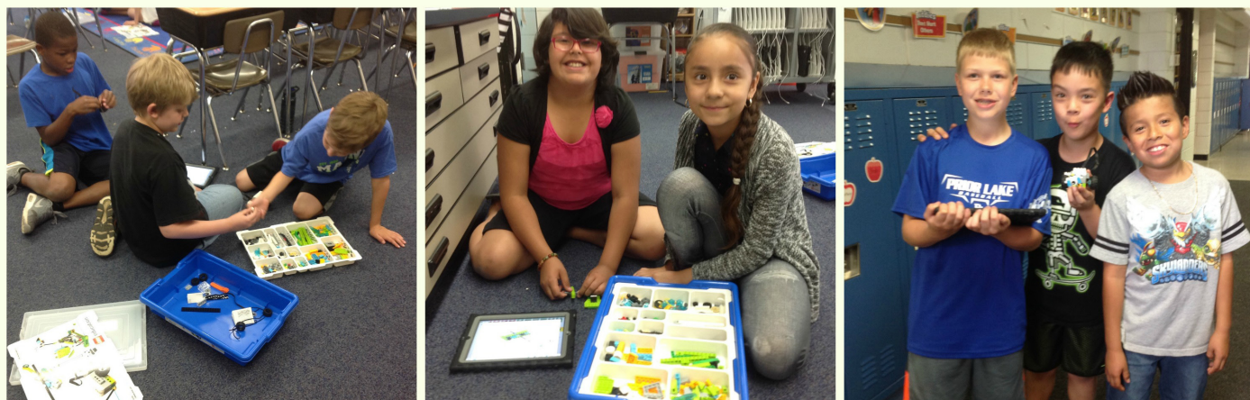
Lego WeDo2 System WestWood Elementary

This system is a unique and cross curricular tool that will be a valuable addition to many classrooms at WestWood Elementary. This system is based on the educational theory of constructionism, which is rooted in the belief that children learn best when they experience things firsthand and within a meaningful context. Students will be engaged in science, technology, engineering, math and creativity. The materials will last for years!