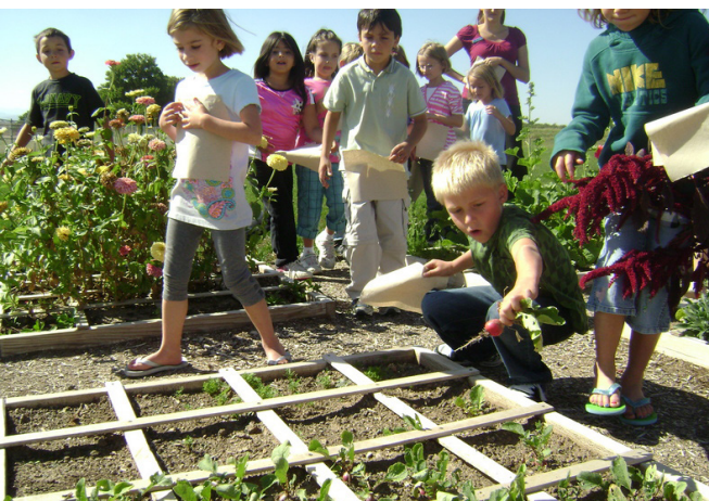
Garden for Five Hawks

This grant helped two classes of 4th grade students who have taken on a challenge of creating a garden at Five Hawks Elementary School. Students will be doing a Project Based Learning (PBL) project where they work together to learn more about gardening. A grant is needed to help buy the necessary things for a garden: beds, dirt, seeds, gardening tools and supplies, etc.