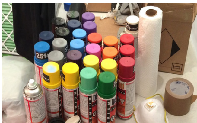
Paint for a Mural

This grant provides Spanish II students the opportunity to create and organize the painting of a mural that will hang in the hallway of Hidden Oaks Middle School. This project will challenge students linguistically, academically, and personally as they experience the union of their own perspectives and experiences with those of Hispanic culture and folklore.