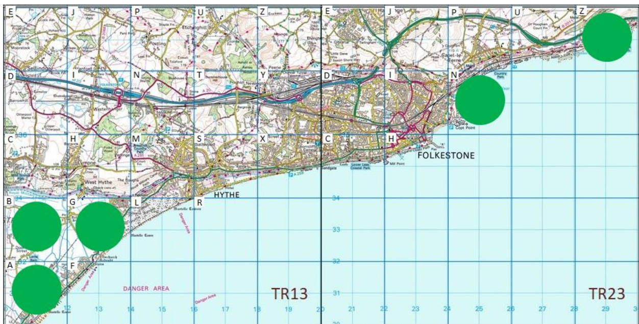
Figure 3: Distribution of all Water Pipit records at Folkestone and Hythe by tetrad