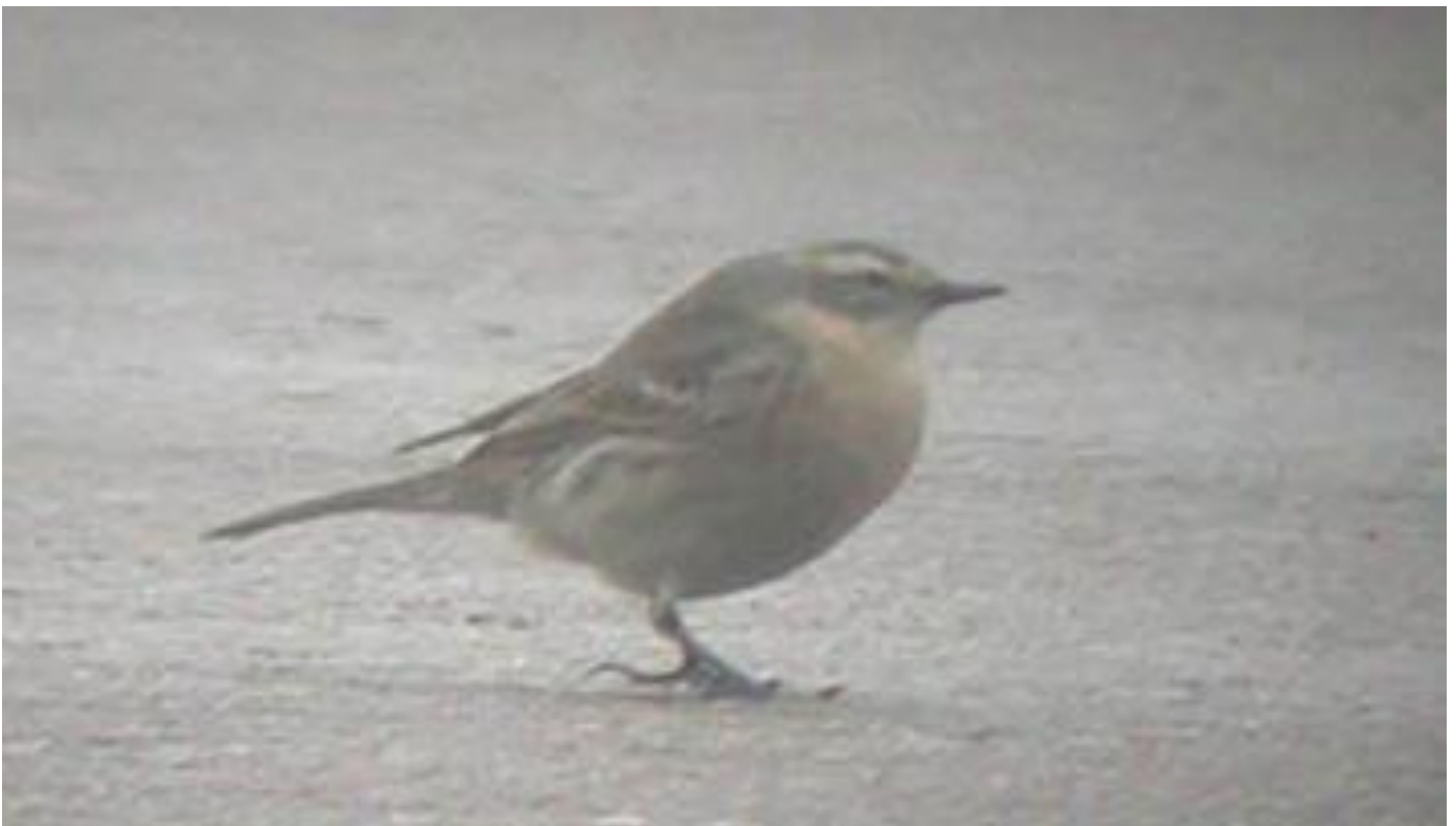
Water Pipit at Samphire Hoe (Geoff Burton)