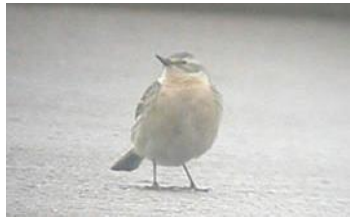
Water Pipit at Samphire Hoe (Geoff Burton)

Breeds in mountainous regions of central and southern Europe, often at considerable elevations above or at the edge of the tree line. In winter moves to lower ground throughout inland central Europe, north-west to Belgium and the Netherlands, with small numbers regularly in southern England (Snow & Perrins, 1998). In Kent it is an uncommon passage migrant and winter visitor, particularly to the Stour Valley (KOS, 2020).