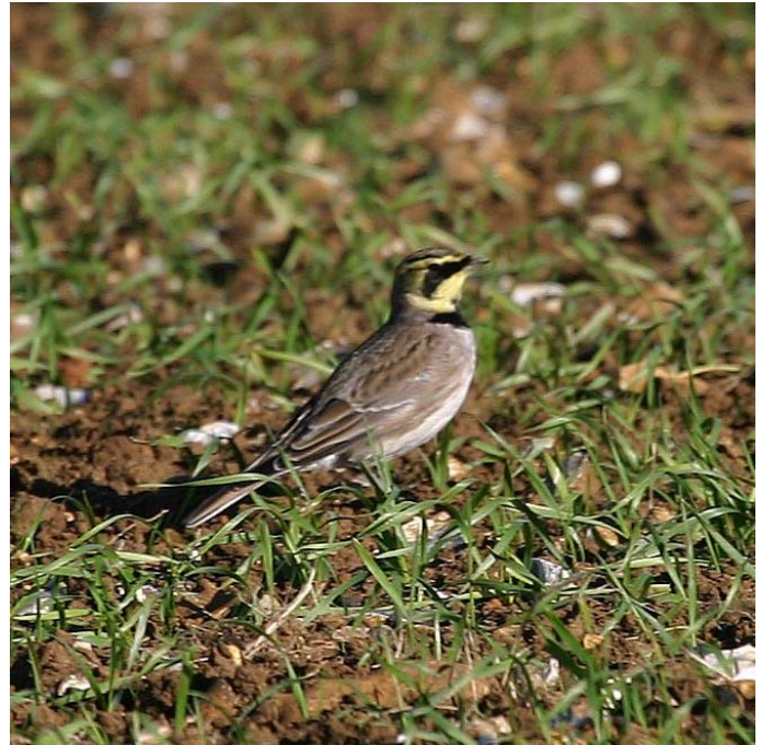
Shore Lark at Abbotscliffe (Ian Roberts)

Breeds in high latitudes across Fenno-Scandia and Russia or high altitudes in south-east Europe, and the highly discontinuous distribution continues eastwards along the north Siberian coast and from Iran east to 120°E. The European arctic and subarctic population is wholly migratory, wintering on the coasts of the southern North Sea and western Baltic, and inland in north-central and eastern Europe. Regular wintering in eastern Britain dates from about 1870 and a comparable nineteenth century increase occurred on the German side of the North Sea, but it is not clear whether this was due to a change in the breeding range or density in Scandinavia, or an altered migration pattern