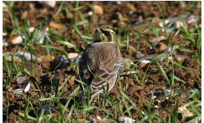
Shore Lark at Abbotscliffe