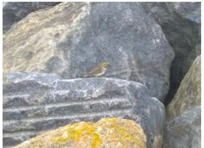
Shore Lark near Dymchurch Redoubt (Andrew South)