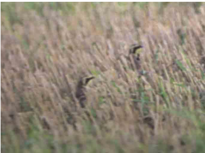
Shore Larks at Abbotscliffe (Dale Gibson)