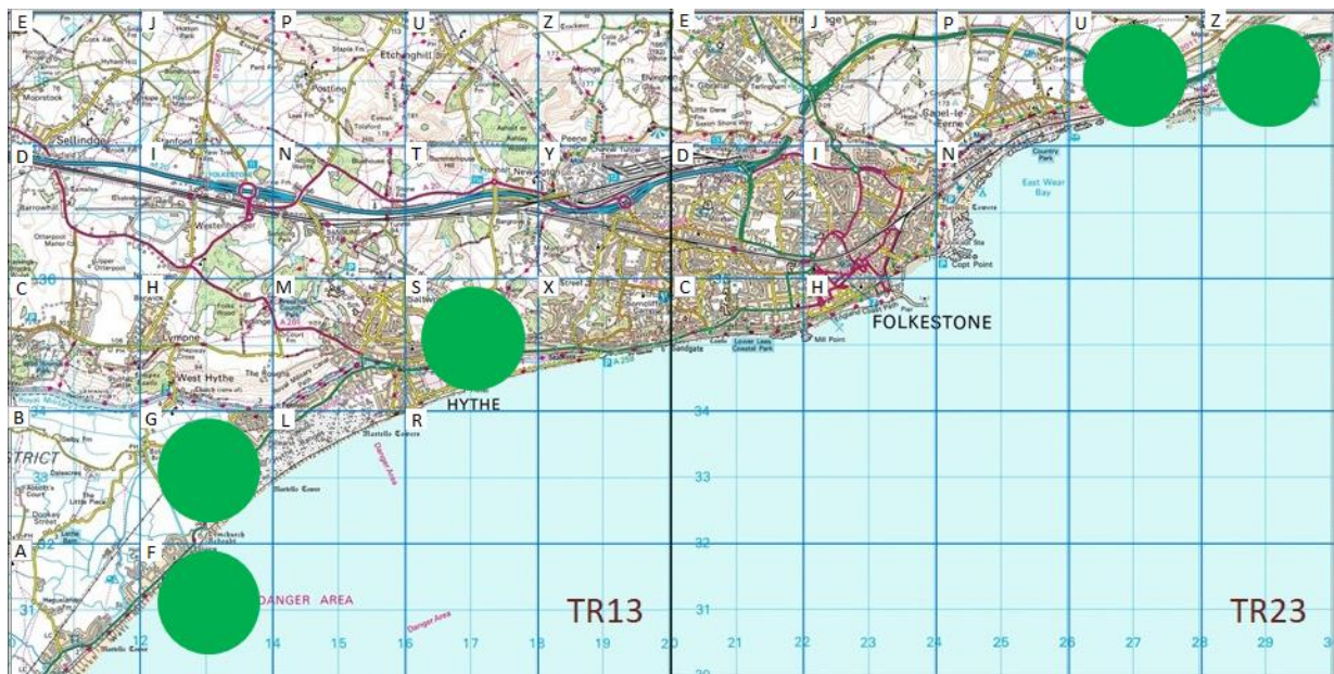
Figure 3: Distribution of all Shore Lark records at Folkestone and Hythe by tetrad

Figure 3 shows the location of records by tetrad.