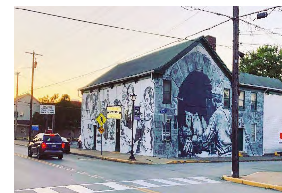
Image of Connellsville Italian Independent Club. The artwork was commissioned in part by the Fayette County Cultural Trust.