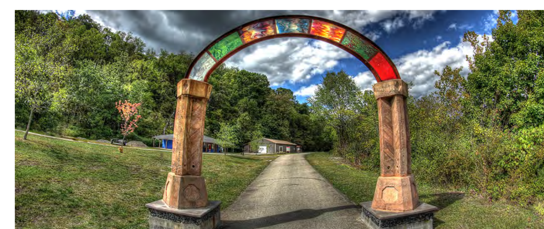
Connellsville Gateway Arch- Great Allegheny Passage Trail Made with glass from Connellsville's own Youghiogheny Opalescent Glass Factory