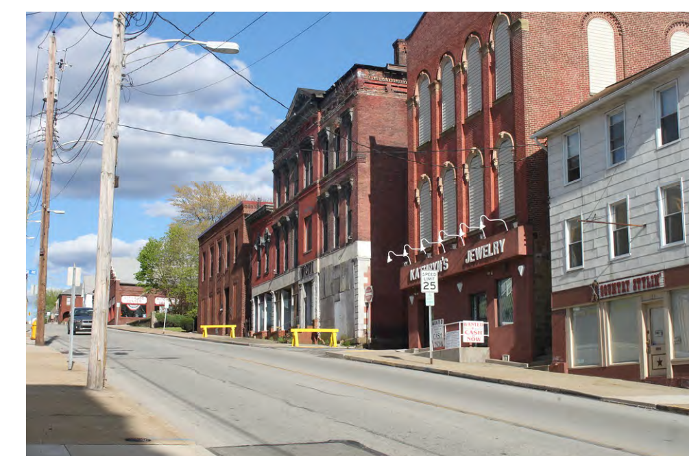
Image of store fronts in Downtown Connellsville, PA