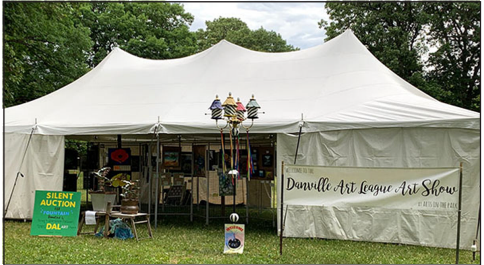
The Art League's booth at Arts in the Park last year had a new look. All the artwork was under one tent!

Awards include: Best of Show - $100; 1st place: $40, 2nd place: $30 in seven categories.