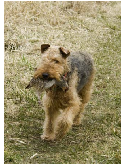
Molly retrieving a chukar at Hunting Working Airedales's annual Nationals.