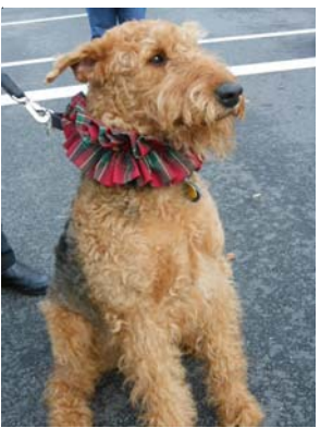
Not everyone is pleased with the "wearing of the ruff" decision!