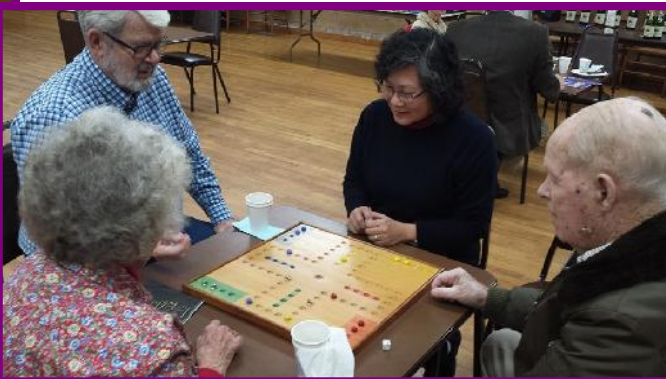
Aggravation and Reminiscing are only two of the many games we played.