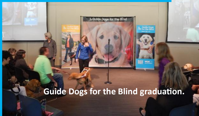
Guide Dogs for the Blind graduation.