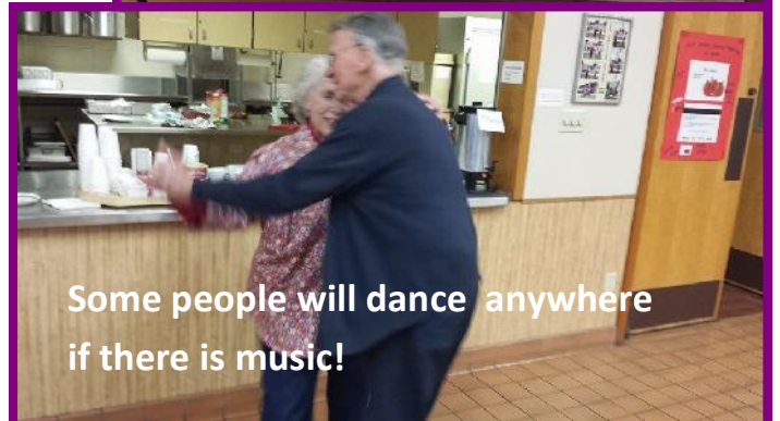
Some people will dance anywhere if there is music!