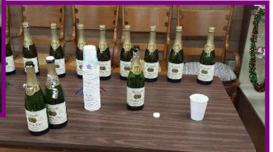
Yes, we had bubbly to drink....