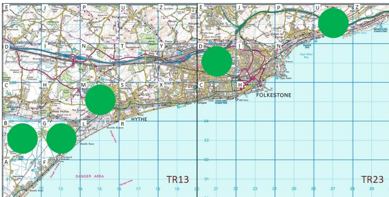
Figure 3: Distribution of all White-tailed Eagle records at Folkestone and Hythe by tetrad

Figure 3 shows the distribution of records by tetrad. The 2012 individual was found in TR13 G but also seen to fly into TR13 B.