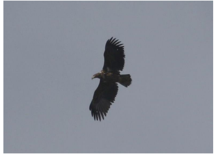
White-tailed Eagle at Hythe (Ian Roberts)

Breeds along the Atlantic coast of Norway and around the Baltic coast of Sweden, Finland and Germany. Most adult pairs are resident but juveniles and immatures wander extensively in winter, mainly south to south-west, with some regular wintering areas in north-eastern France and the Netherlands. Following an earlier decline, recent increases have been reported from northern Europe.