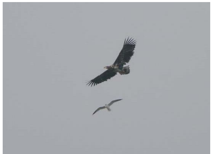
White-tailed Eagle at Walland Marsh (Martin Casemore), having earlier been seen at Botolph's Bridge