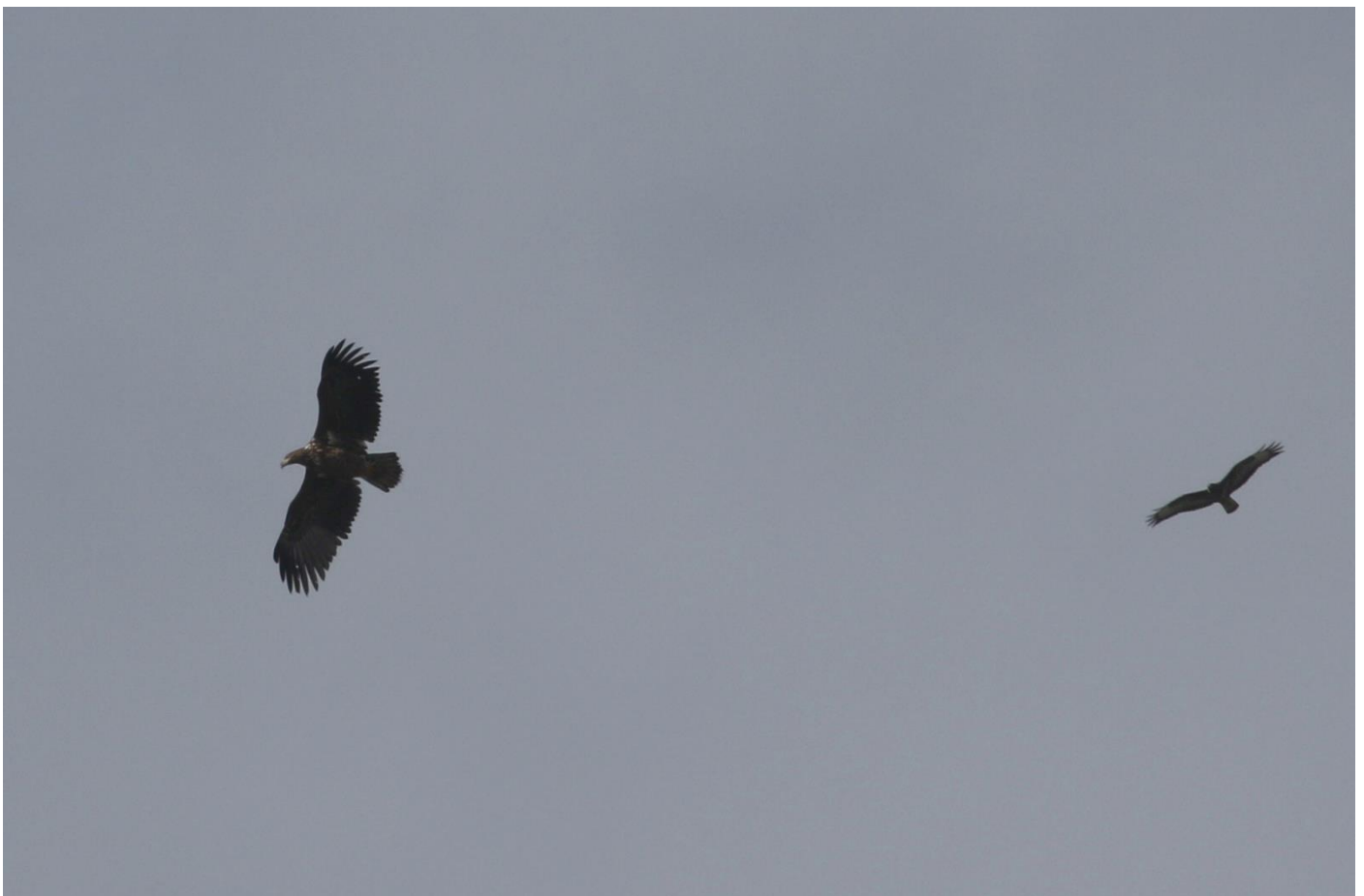
White-tailed Eagle and Buzzard at Hythe