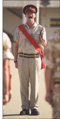
2 PWRR preparing for Public Duties