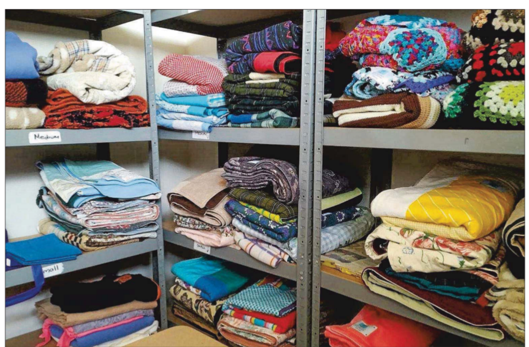
WARMING WORK: Belmont charity Warm Blankets for Everyone has donated more than 4000 blankets to vulnerable people in the community since 2020 but founder Sue Bardsley is now looking to the community for donations to keep up with demand.