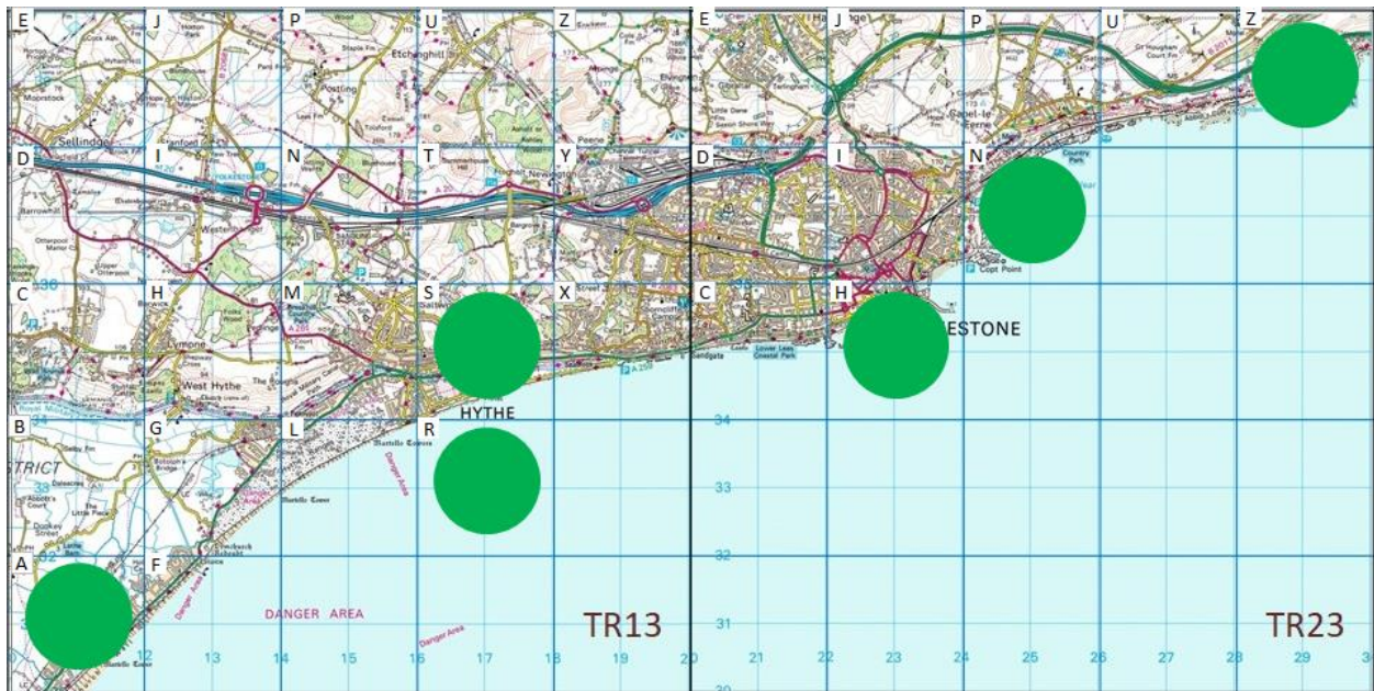
Figure 3: Distribution of all Sooty Shearwater records at Folkestone and Hythe by tetrad

The vast majority of records are from the Copt Point/Folkestone Pier/Mill Point area (37), with six at Samphire Hoe and at Hythe and one at the Willop Basin. The first area record was only given as "Folkestone".