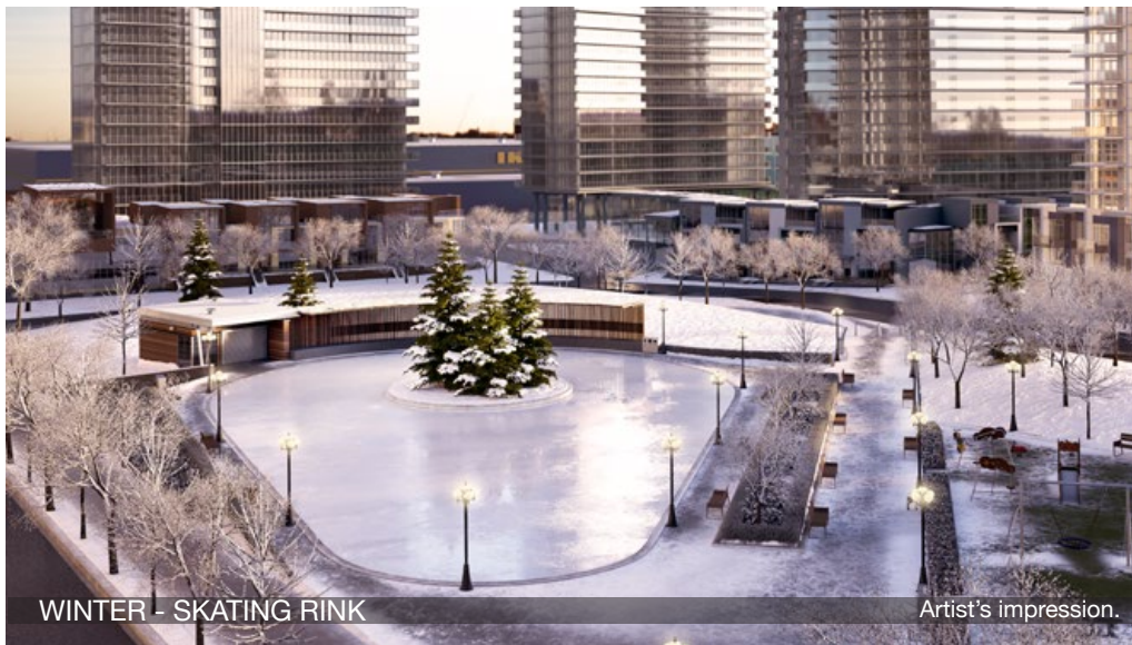
WINTER - SKATING RINK