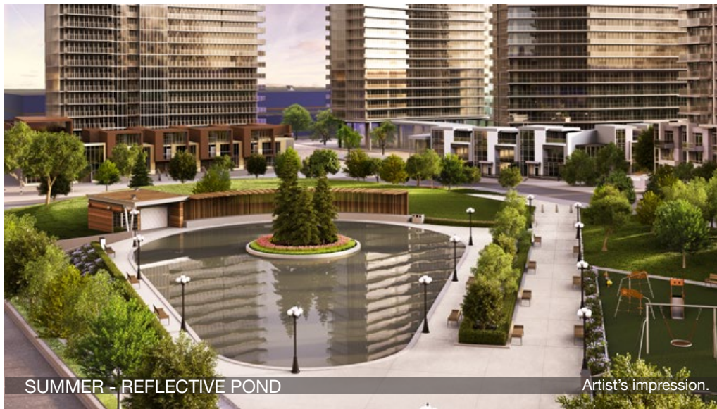
SUMMER - REFLECTIVE POND