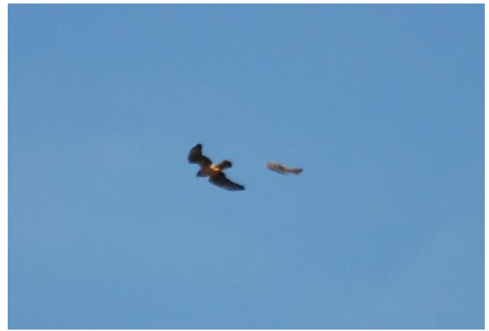
Montagu's Harrier with Kestrel at Samphire Hoe

It is a scarce passage migrant to the county, that has summered and bred in the past.