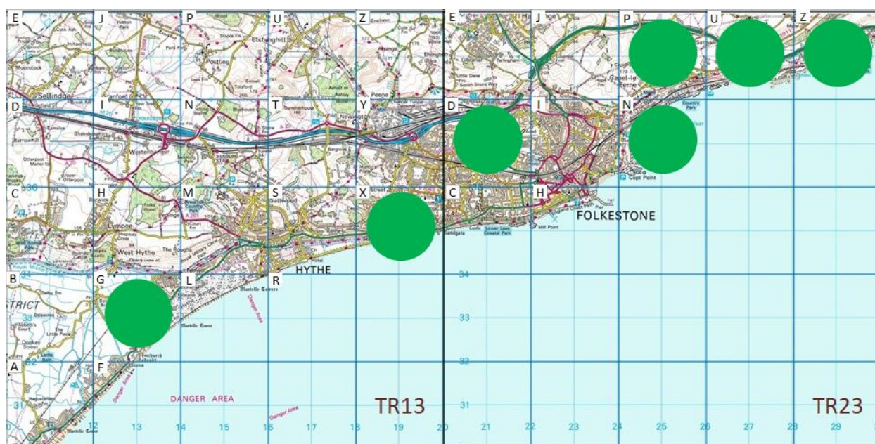
Figure 3: Distribution of all Montagu's Harrier records at Folkestone and Hythe by tetrad

Figure 3 shows the location of records by tetrad. Thirteen have been recorded along the cliffs between Copt Point and Samphire Hoe, with three at Cheriton/ Folkestone and singles at Hythe Ranges, Mill Point and Princes Parade.