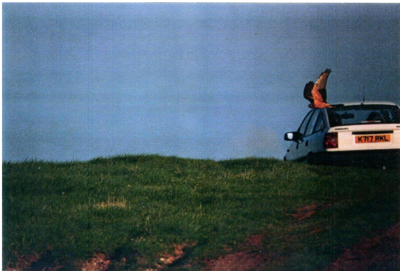
Montagu's Harrier at Abbotscliffe