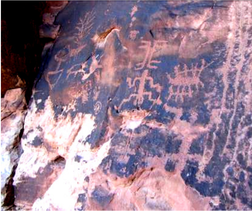
Figure 2 – Left side panel (right side)

Figure 3 (previously identified as an elk) looks to be a coyote in front of a tree of life. The figure also appears to be pregnant. This figure could still be an elk, but it was identified as a coyote based on another glyph on the site – Figure 4. Figure 4 shows what could be two coyotes with the largest one having what appear to be internal organs along with a journey symbol. The general design motif on the animal glyphs in both Figure 3 and Figure 4 are very similar.