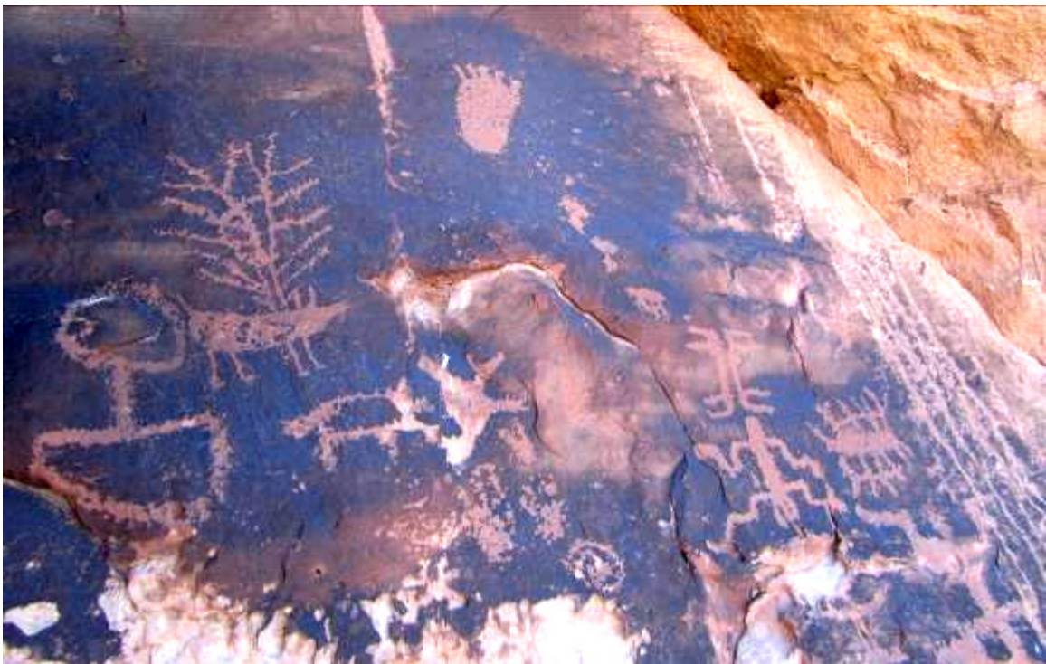
Figure 1 – Left side panel (left side)

Previously this panel was viewed only from below. Figures 1 and 2 show the panel from a “straight on” point of view.