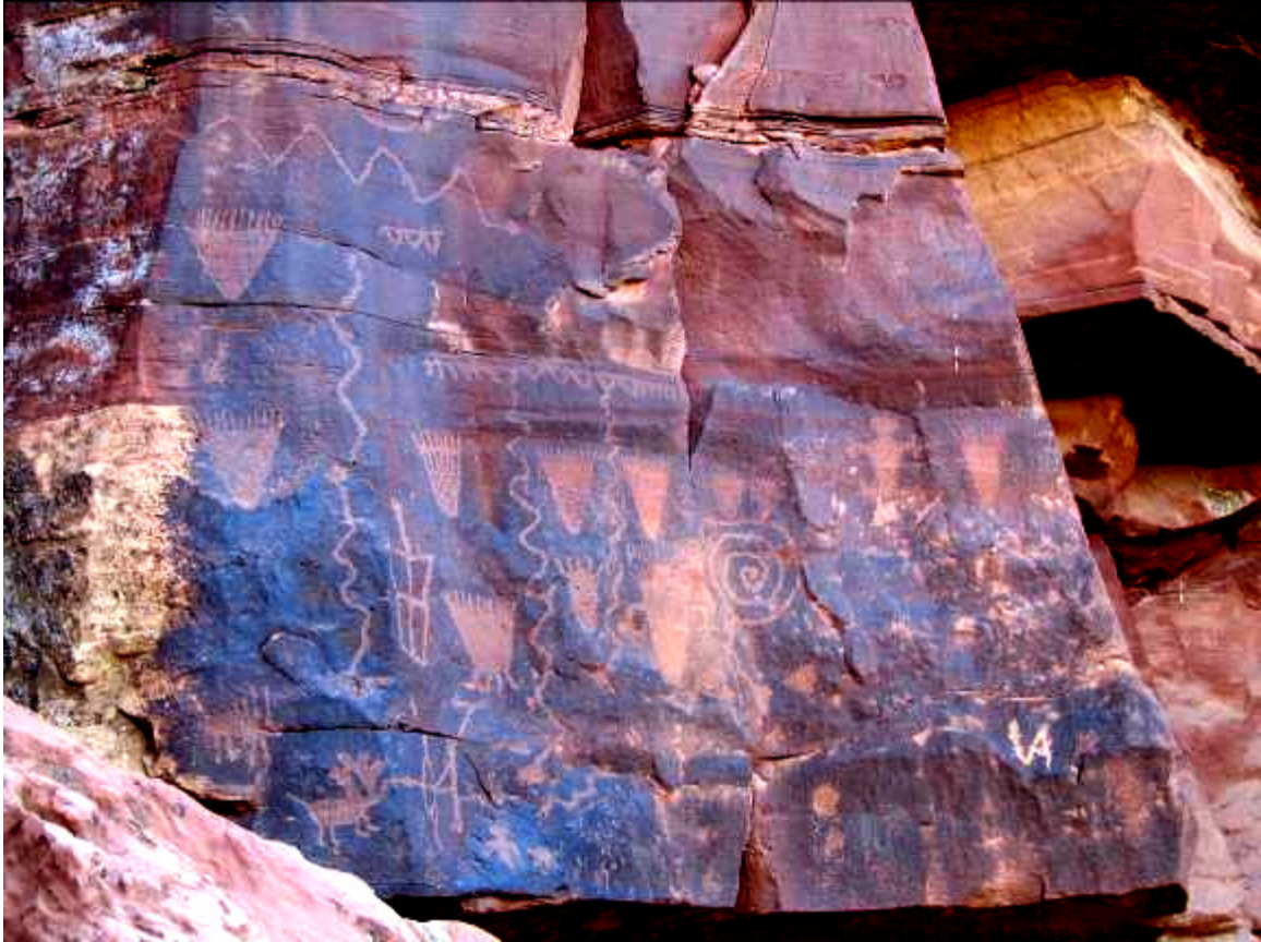
Figure 6 – The main “basket” panel