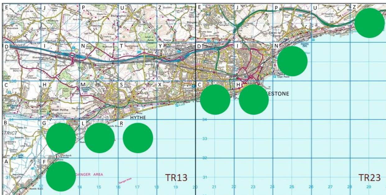
Figure 3: Distribution of all Balearic Shearwater records at Folkestone and Hythe by tetrad

Figure 3 shows the distribution of records by tetrad.