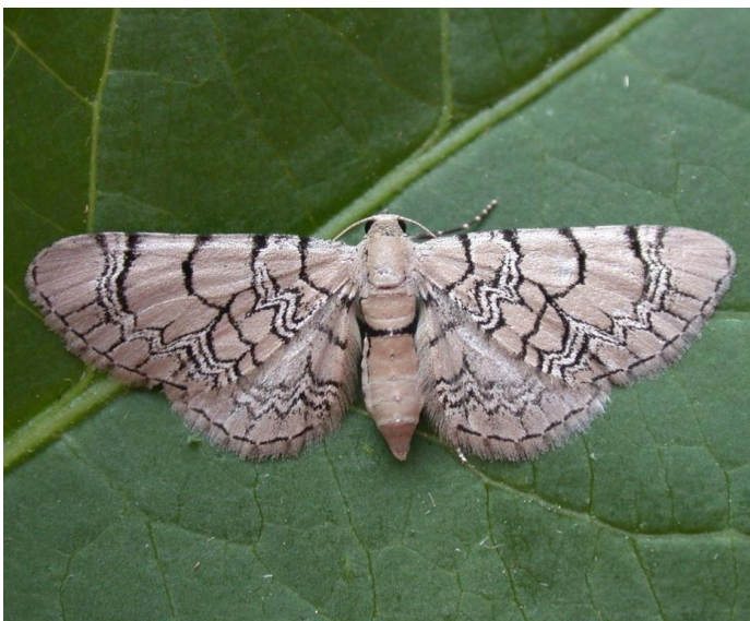
Netted Pug at Hythe Ranges