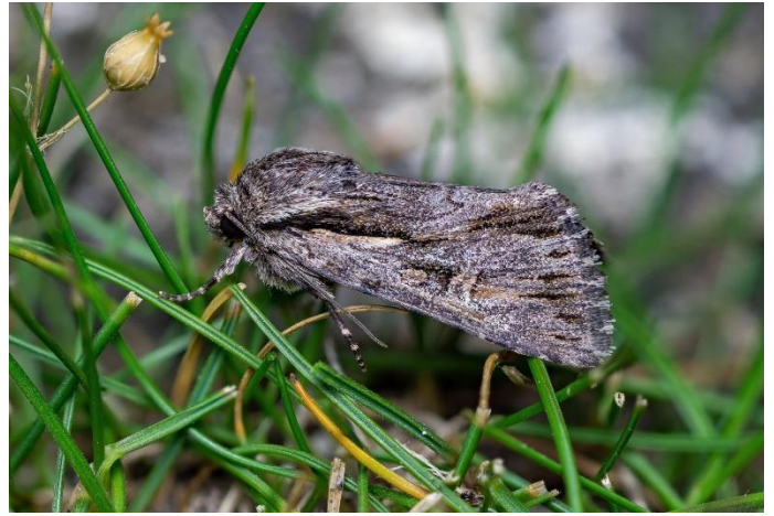
Pale-shouldered Cloud at Hythe Ranges