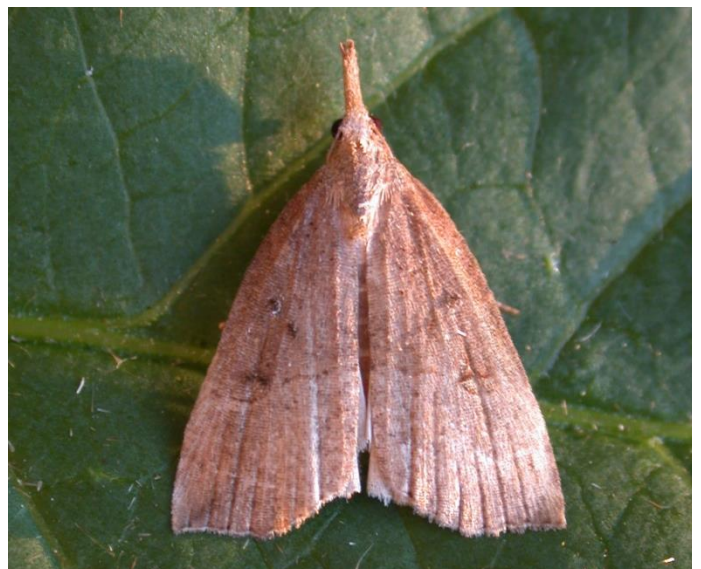
Buttomed Snout at Hythe Ranges

The Clouded Yellow butterfly may frequently be encountered along the seawall.