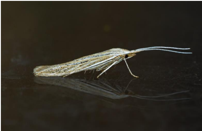
Coleophora galbulipennella at Hythe Ranges