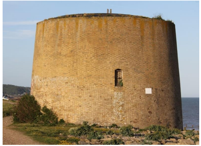
Martello Tower 15

The two former lifeboat stations located in the tetrad were designated in 2010 as grade II listed buildings.