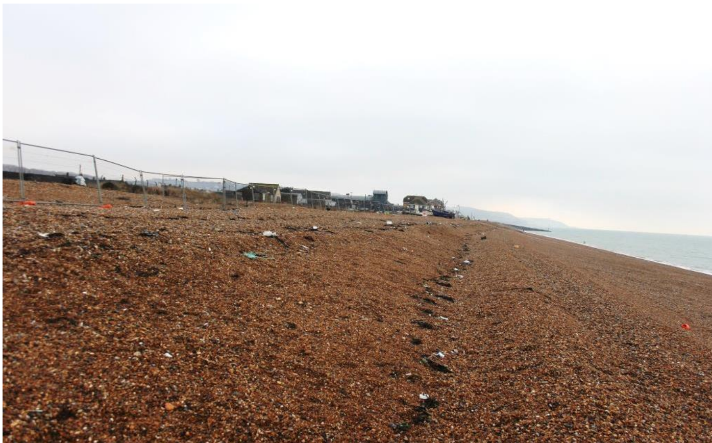
Looking east along Fisherman's Beach towards Hythe

Up to ten Nightingales were holding territories in 1958 and still as many as six were present in the 1990s but they are only infrequently recorded today. Turtle Doves also bred until relatively recently, whilst other breeding species may include Red-legged Partridge, Cuckoo, Black Redstart and Stonechat.