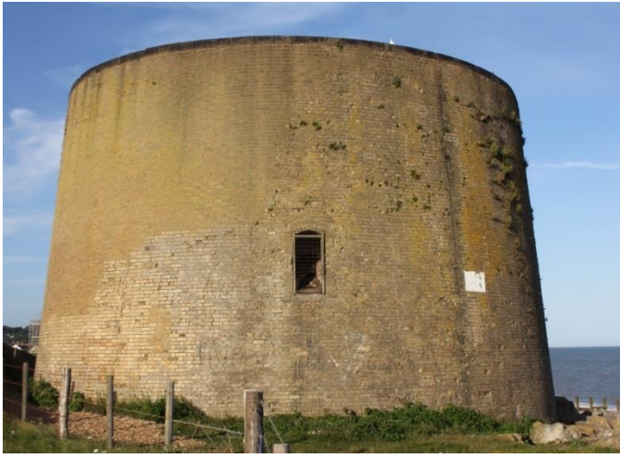
Martello Tower 14