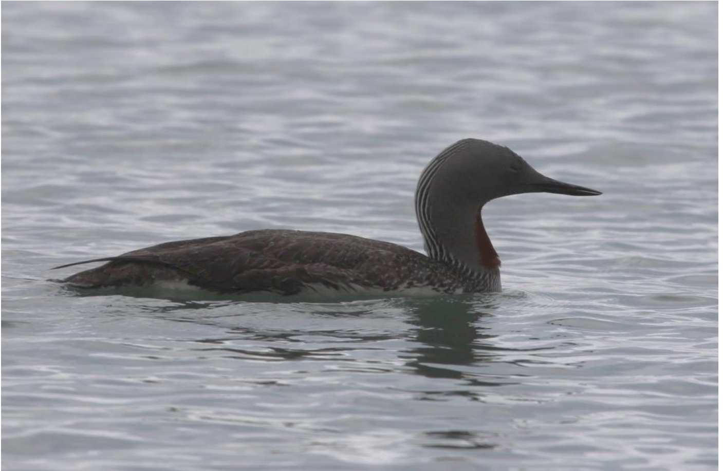
Red-throated Diver at Hythe Ranges

Whilst access to the Ranges may be restricted, the bay and sea can be viewed Fisherman's Beach at any time. The bay often attracts good numbers of Common Scoters and Great Crested Grebes, sometimes Eider or Velvet Scoter and, mainly during in hard weather, dabbling ducks may seek shelter here. Seawatching may produce Brent Geese, ducks, waders, skuas, terns and auks, and Balearic Shearwater has been recorded. Other oddities have included Bewick's Swan, White-fronted Goose, Goosander, Little Egret, Red Kite, Osprey, Merlin and Hobby.