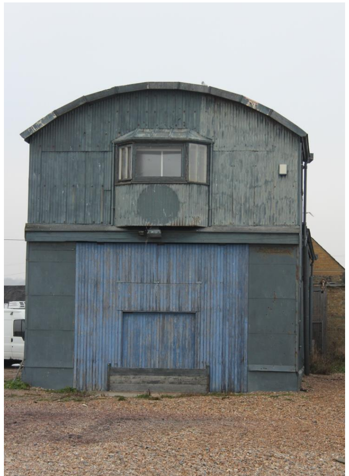
New lifeboat station, built 1934

In 1940 the lifeboat was beached during the evacuation of Dunkirk, so becoming the only lifeboat to be lost during Operation Dynamo.