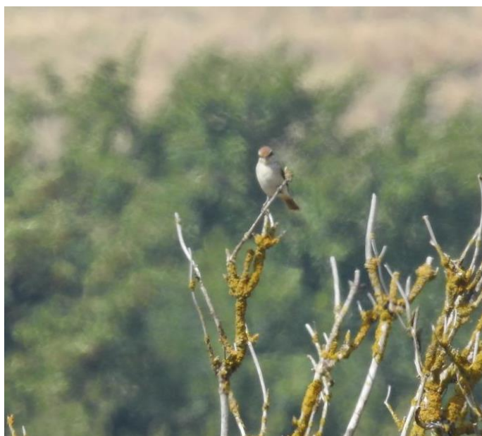
Red-backed Shrike at Hythe Ranges

The bushes attract migrants in spring and autumn, with sightings having included Garden Warbler, Sedge Warbler, Redstart and Spotted Flycatcher, amongst the commoner species. The seawall and open areas can hold Wheatears and Whinchats, with hirundines, pipits, wagtails, finches and buntings passing overhead. Rarer species seen in recent years have included Wood Lark (in December 2014 and 2017, and October 2022), Hoopoe (in April 2015), Dartford Warbler (in December 2017) and Red-backed Shrike (in September 2022).