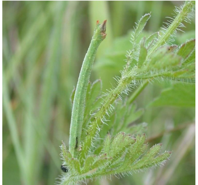
Sussex Emerald larva on Wild Carrot at Hythe Ranges