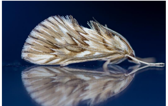
Cynaeda dentalis at Hythe Ranges