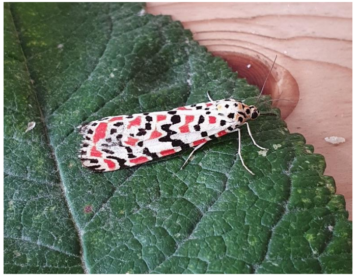
Crimson Speckled at Fisherman's Beach

The heteropteran bug Aphanus rolandi was found at Fisherman's Beach during an ecological survey of the site in 2010. This species is categorised as nationally notable, and which is also found at Dungeness and only in seven 10km squares in the UK.