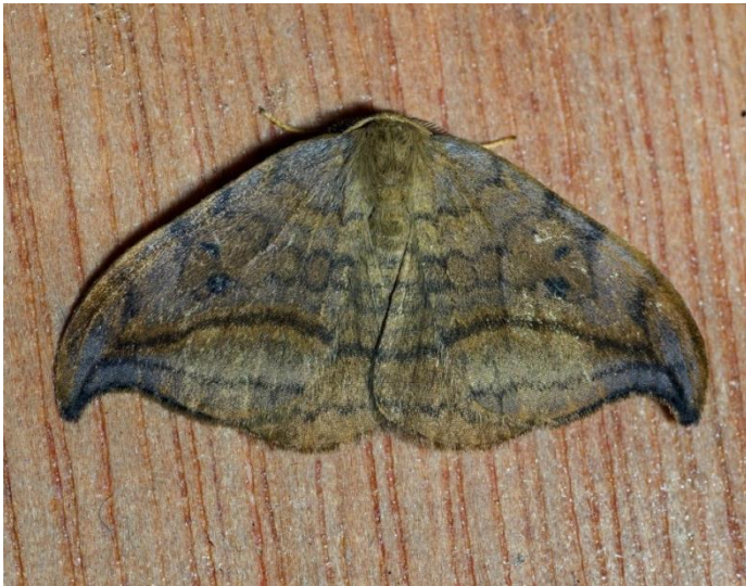
Dusky Hook-tip at Hythe Ranges