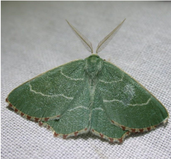
Sussex Emerald adult at Hythe Ranges