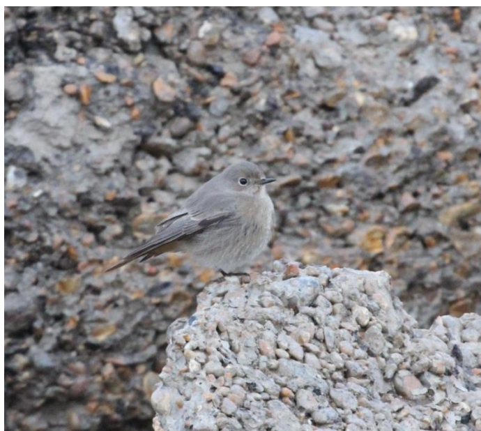
Black Redstart at Fisherman's Beach

Up to ten Nightingales were holding territories in 1958 and still as many as six were present in the 1990s but they are only infrequently recorded today. Turtle Doves also bred until relatively recently, whilst other breeding species may include Red-legged Partridge, Cuckoo, Black Redstart and Stonechat.