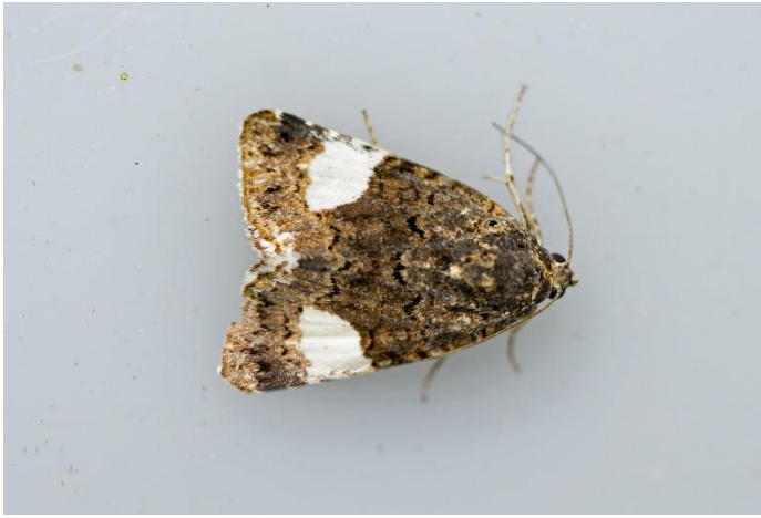
The Four-spotted at Hythe Ranges