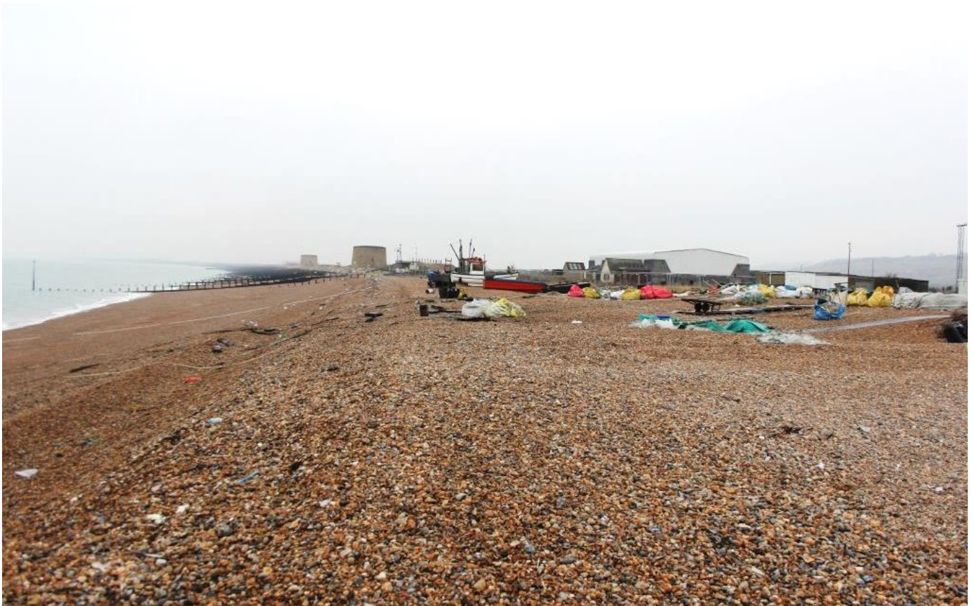
Looking west along Fisherman's Beach towards Hythe Ranges

The remnants of shingle beach at Hythe Ranges represent the eastern extremity of the original bar across Romney Bay. Where the beaches have not been disturbed by military training, the usual fan-shaped pattern of laterals is discernible, and the older alluvium-filled hollows support mature vegetation. It is highly probable that the alluvium represents what was once the south side of an arm of the sea extending towards West Hythe. There has been some seaward accretion in the past but since the 13 th Century and the construction of Dymchurch Wall, erosion has kept pace roughly with accretion.