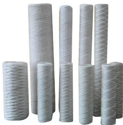
Quality cartridge filters of all types and sizes at warehouse prices