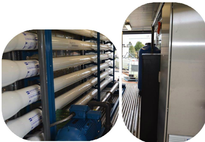
Containerised & skid mounted reverse osmosis systems