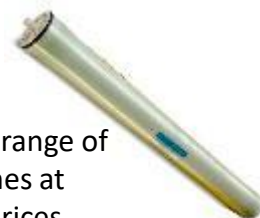
We have a large range of RO membranes at discounted prices