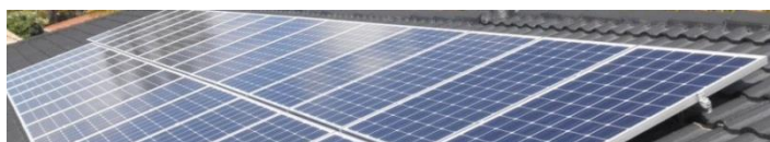
Solar panels and accessories from the world's leading manufacturers