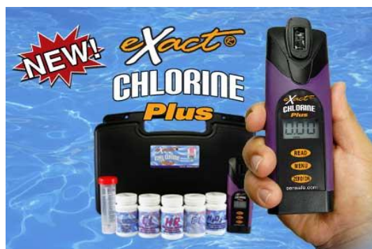
A wide range of photometers for more precise water testing of multiple parameters