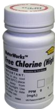
Avanale has a large range of inexpensive quality test strips made in the USA