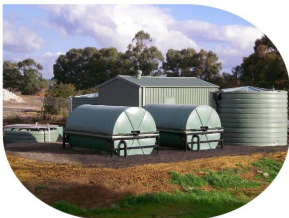
Waste Water treatment Plants