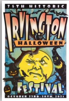
First Place Poster for the 2021 75 th Annual Irvington Poster Contest