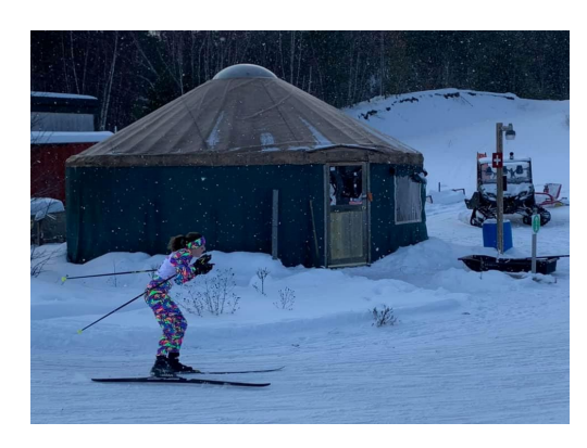
High School racers on the course in Section 2

Set your calendar for these dates and come on our all season and enjoy some great youth racing.