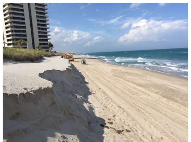
Major dune replenishment done by Water Glades in February