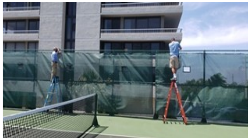
Removed gazebos & lowered wind screens