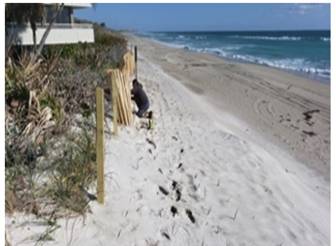
A finished dune and new beach fencing