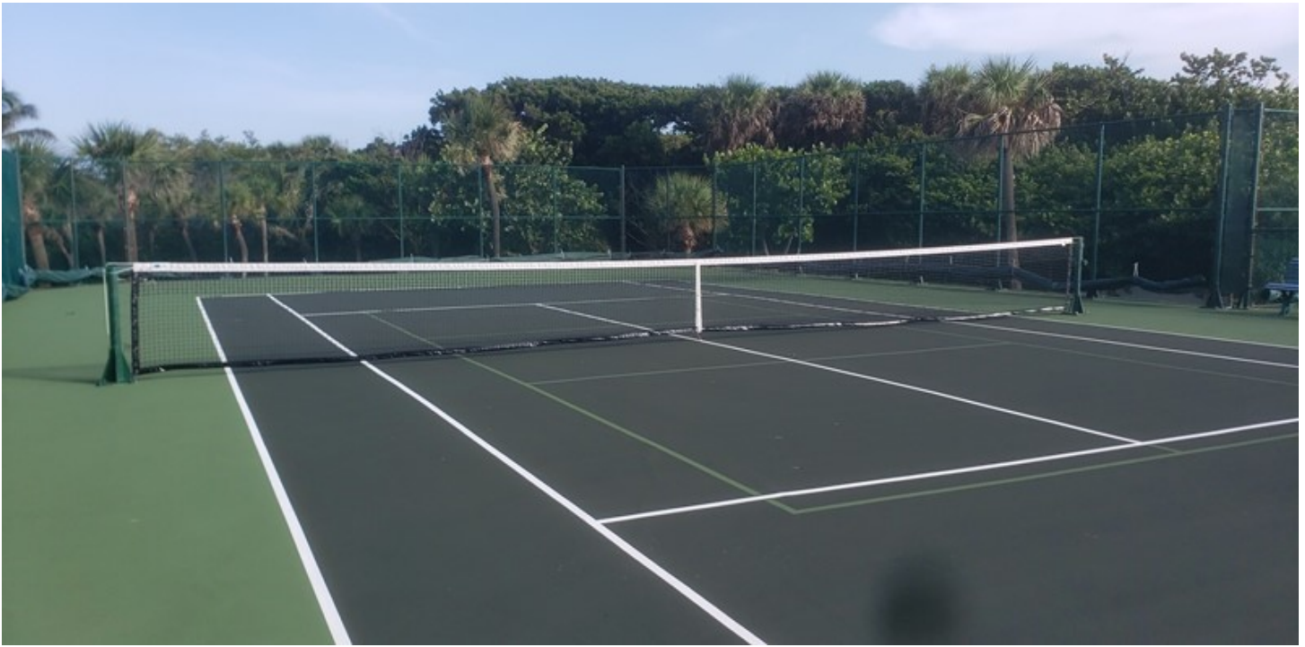
All new tennis court nets and hardware