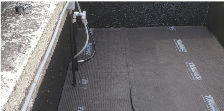
Waterproofed planting bed