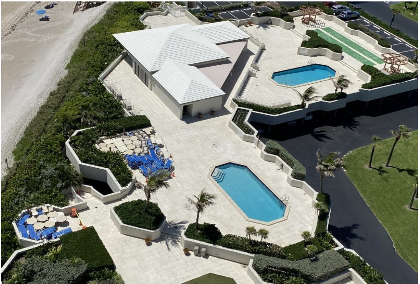
Pool deck prepped for cleaning as well as the clubhouse roof pressure cleaned. The deck furniture was piled up during pandemic