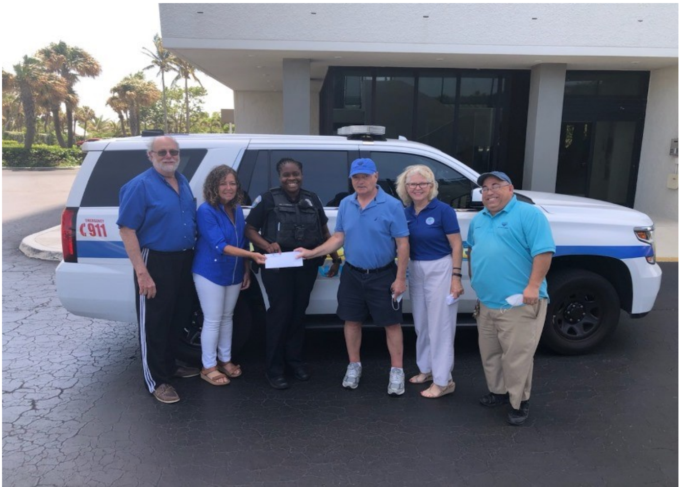
Water Glades collected over $5000 in conjunction with the Riviera Beach Police to donate to local residents during the Covid Crisis. Police used funds to buy food & supplies for needy residents.