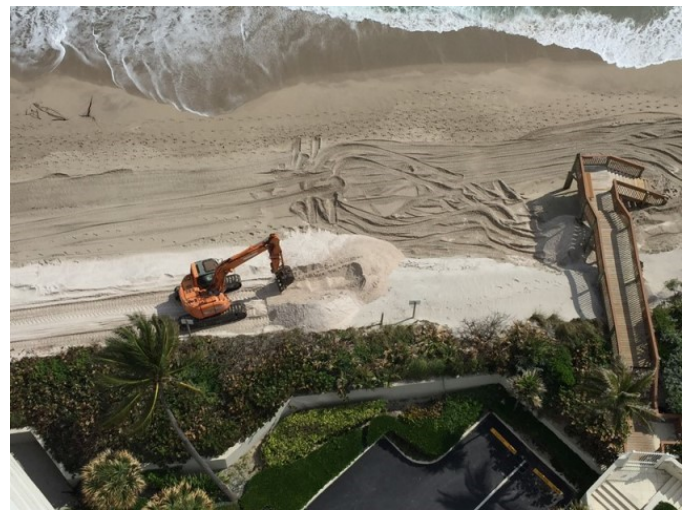
Major dune replenishment done by Water Glades in February