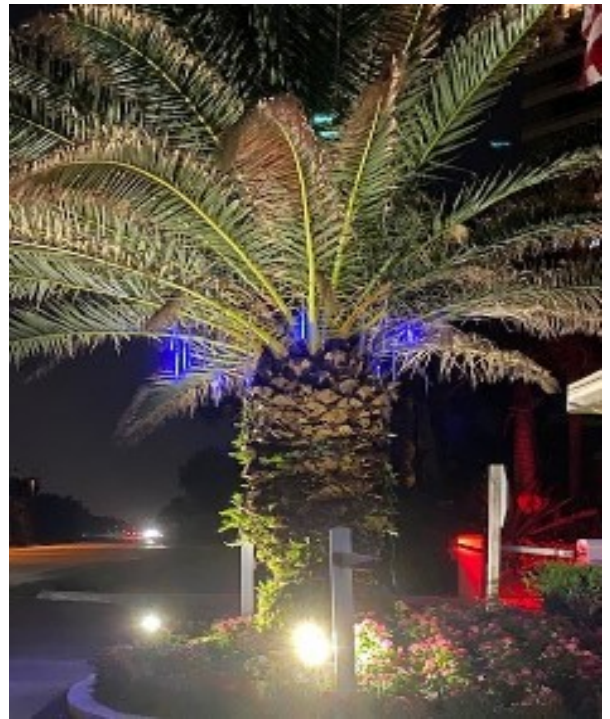
Blue Lights in front of community in support of Florida's first responders