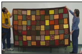
Pam Goff's RV Quilt