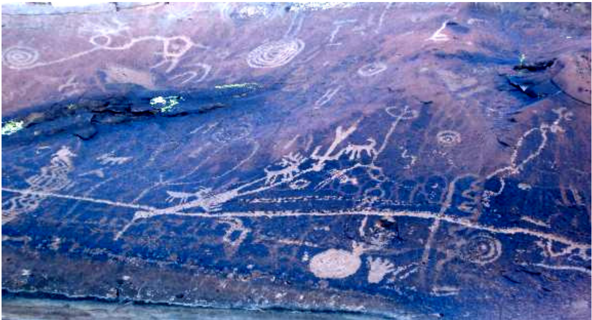
Figure 8 – The center section of the story panel. Note the very large water bird descending and a smaller water bird ascending in the center.