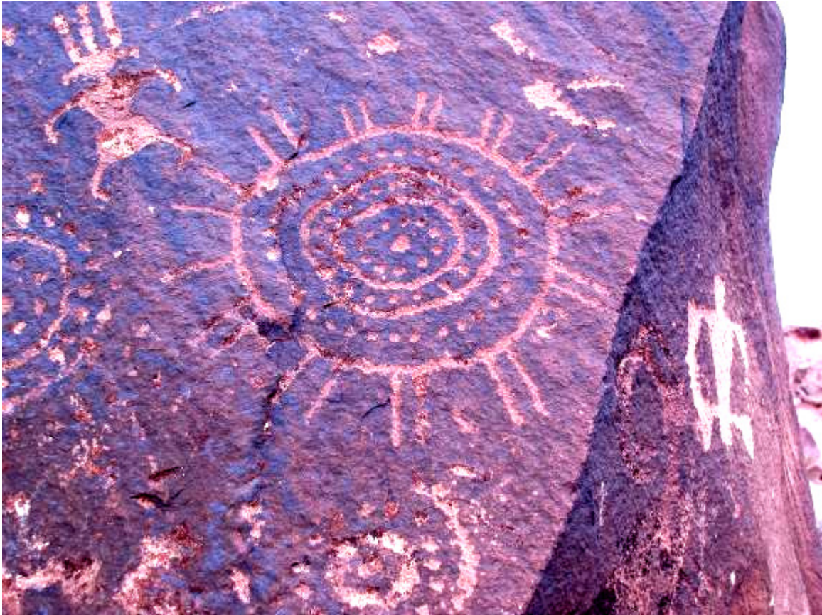
Figure 10 – Detail of the major “sun” glyph. Could this be some sort of calendar or a solstice glyph?