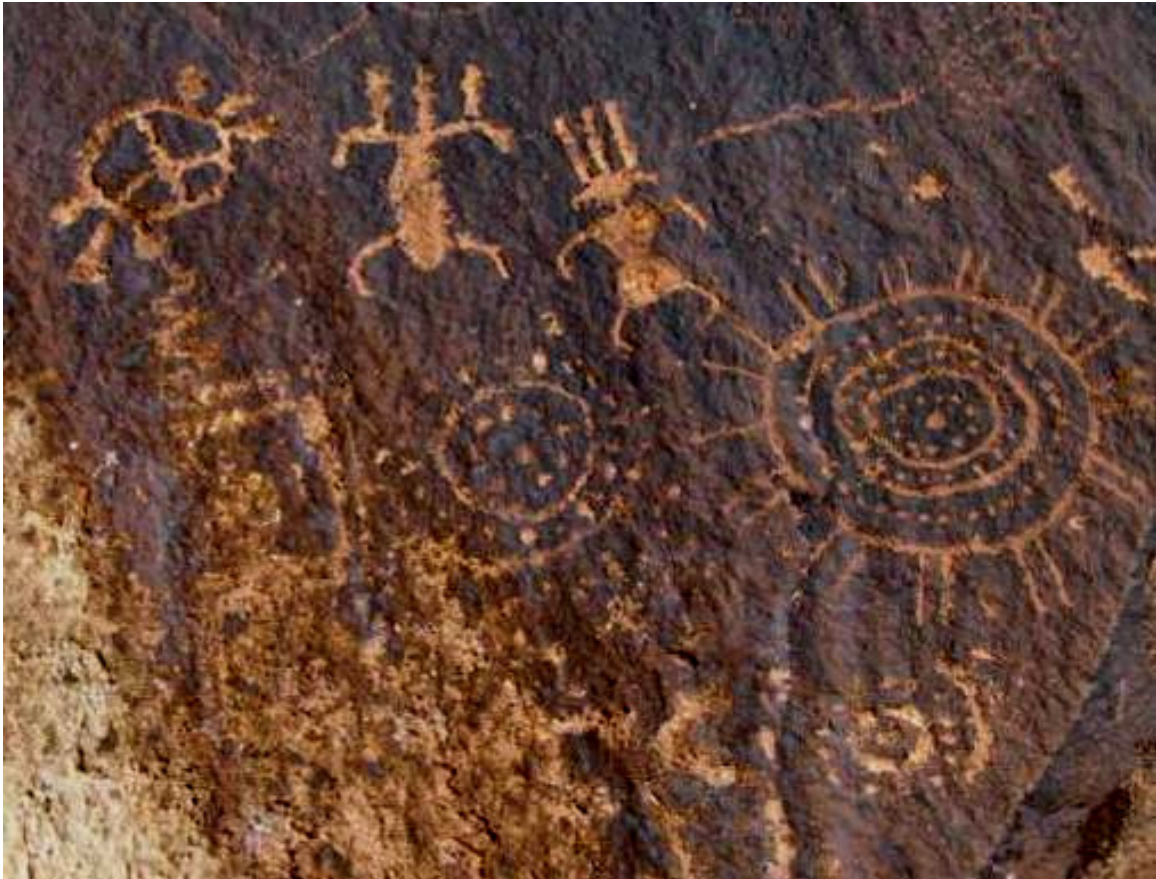
Figure 9 – Panel with three “sun” figures on the right. Were the two “incomplete” circle glyphs practice? Maybe the first artist died (anthro on top left) and the second artist finished the work (anthro top right)?