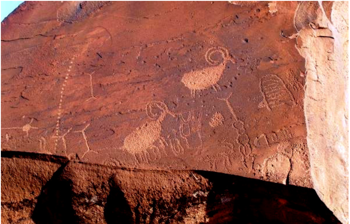
Figure 13 – A panel showing sheep (note the extreme curve of the horns which are unusual in this area), along with some archaic aged glyphs (center and lower right).