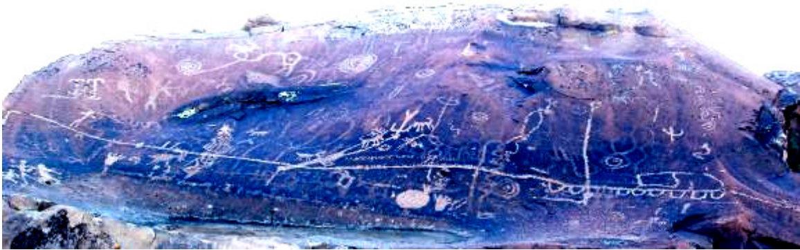
Figure 7 – a very large story panel.