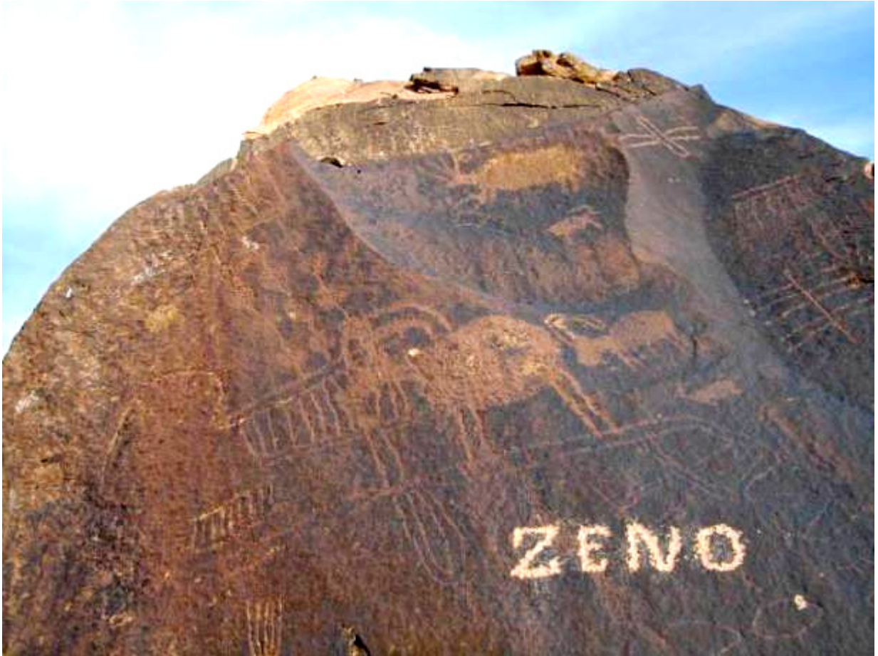
Figure 14 – the “Zeno” panel