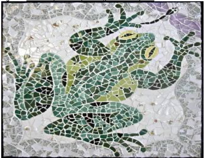
Figure 2. <a href="https://www.lineartgallery.com/web/Artist/Strachan/art_mosaics/art_mosaic_photos/art_mosaic_frog.jpg">www.lineartgallery.com/web/Artist/Strachan/art_mosaics/art_mosaic_photos/art_mosaic_frog.jpg</a>