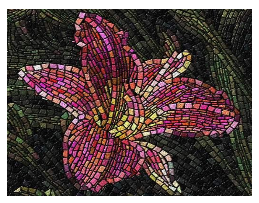
Figure 1. www.firelily.com/samples/images/mosaic.lily.html