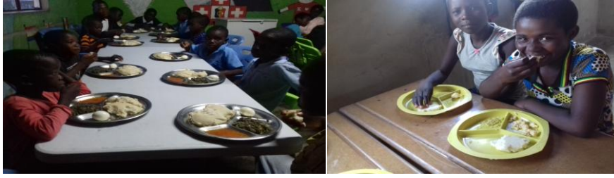
Orphans feed at SOCH and lunch at School