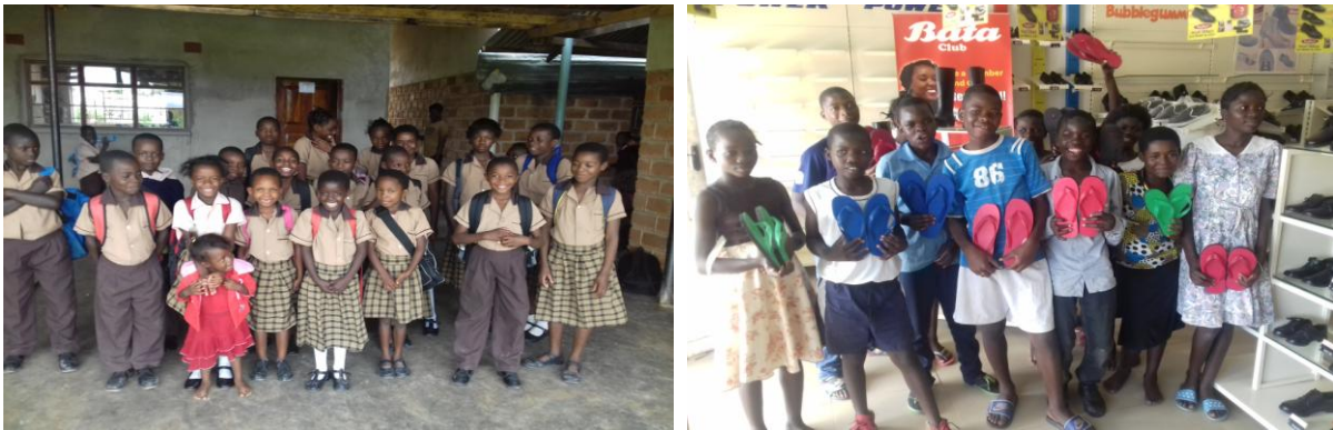
All orphans outfit into new uniforms and flip-flops

Orphans are all going to school. Fees, uniforms and shoes are provided by SOCH. Not only these but also pupils' stationary is provided to all orphans on sponsorship.