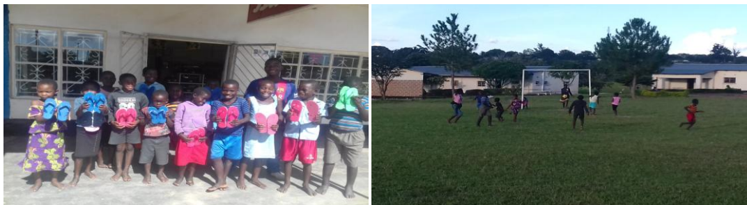
Flip-flops bought for orphans for walking around at SOCH and for shower -- Orphans play games for leisure

SOCH orphans are always counselled to make sure they are safe and develop life skills. SOCH is so far providing social amenities for orphans to keep their bodies and brains active. Such amenities include play grounds and library.