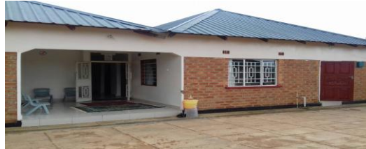
Guest House front view

has raised enough money to run itself but not on profit. This is of the case with other lodges in the district too because these months most departments conclude their yearly budgets, plan for new budgets, spend on fees and therefore people are not much on the move. However it was observed that April to November are usually good months for business having all other factors kept constant.