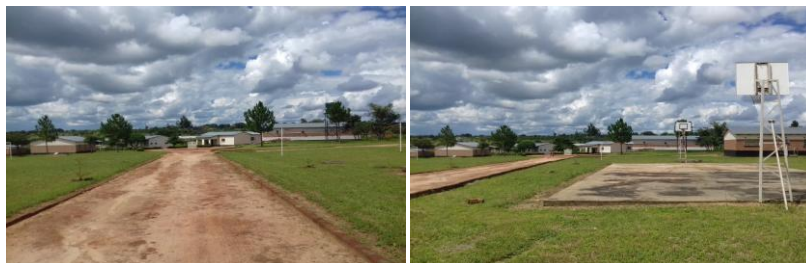
Orphanage view as on 6 th March, 2018