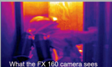
What the FX 160 camera sees

Since it is a technology designed to sense and display heat signatures, the camera provides "sight" in dark and smoke filled environments, which is invaluable in the decision making process. Infrared thermal imaging systems are being integrated into fire control, management and firefighting services throughout the world. Infrared Cameras, Inc. offers solutions that meet and exceed the operational needs of these applications.