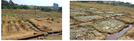
Irrigation in progress at the orphanage garden.