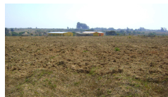
New land block cleared

It has been now a year since boundary wrangles started existing between the orphanage management and the neighboring plots' owners. At least one further step has been taken towards resolution. The council has shown the orphanage the new provisional boundaries. However, there is now a need that they meet and stamp an approval stamp on the new plan, then be taken for numbering as one orphanage block of land. After numbering, there will be need for the surveyors involvement so that they survey and put beacons including the new big block of land given to the orphanage. Currently, the land is just leveled as shown bellow.