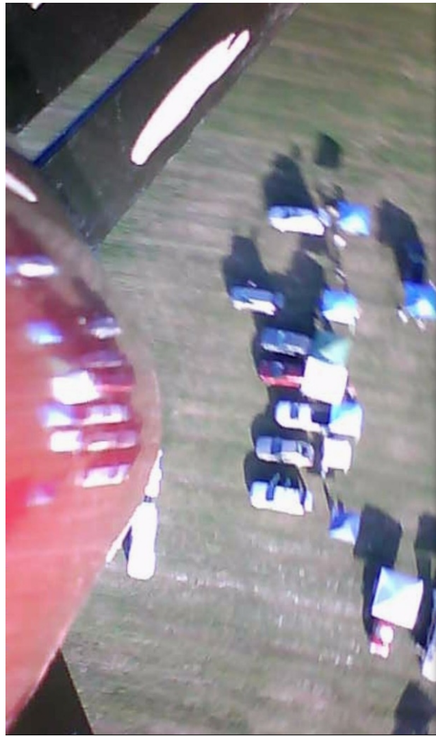
Drifting under main parachute over the setup area