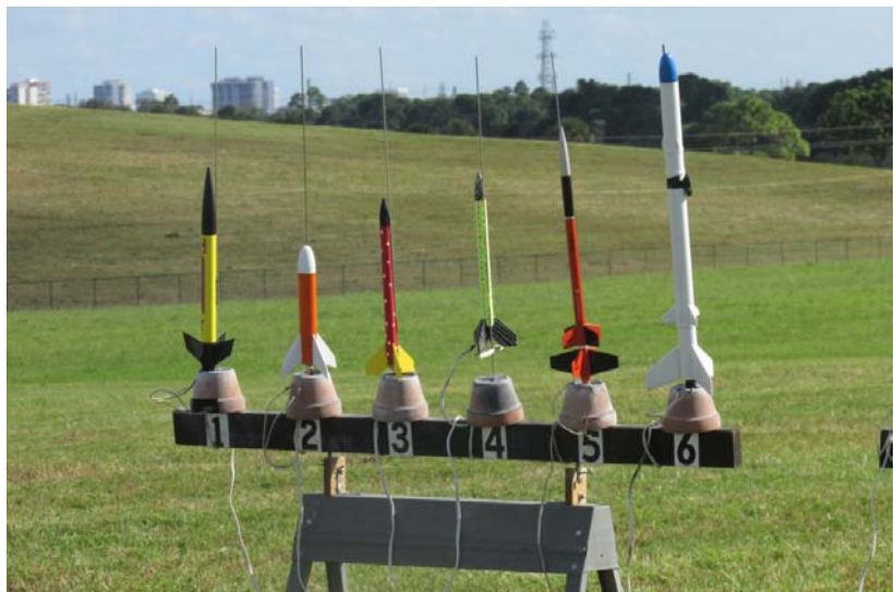
Another rack ready to go!