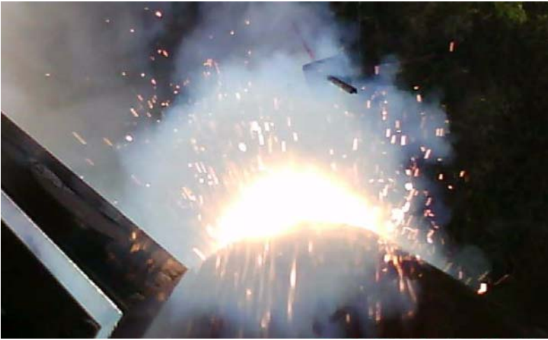
Liftoff from Pad 25; launch pad leg, rail and blast deflector are visible at upper center