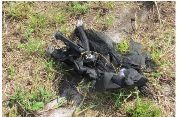
Ouch! Bernie will be back good as new (with a few modifications) for the November launch!