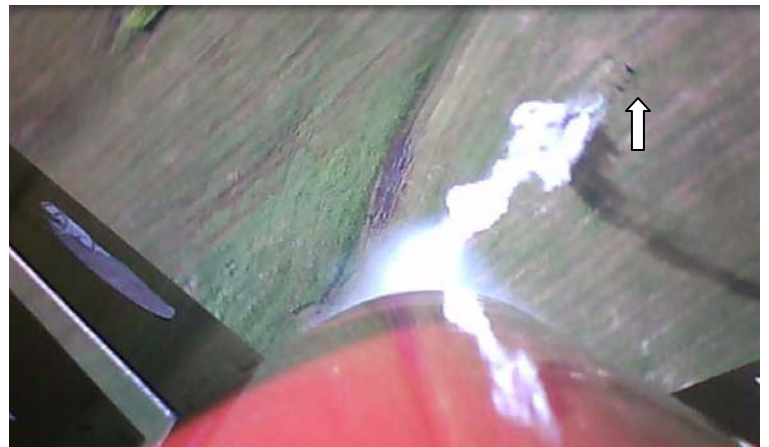
T+2 seconds – launch pads are visible at upper right (arrow)