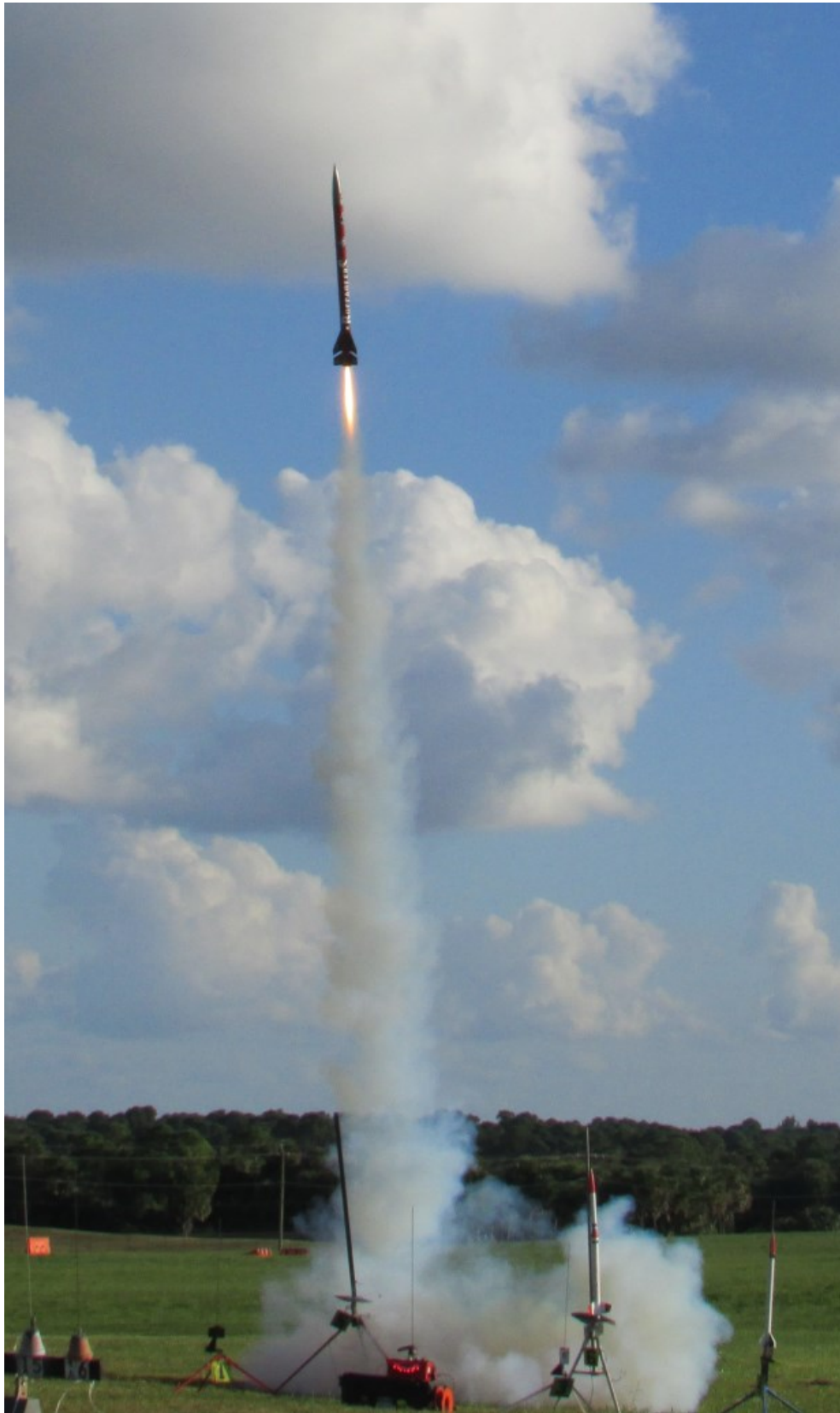
PHOTO GALLERY - Flight of the Buccaneer