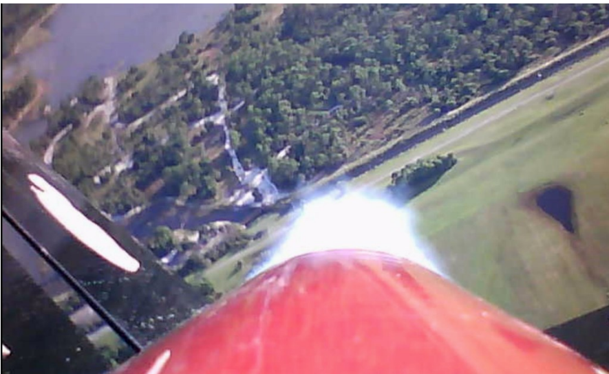
Coasting upward – nice aerial view of the Polycarpo Forest, just south of the field