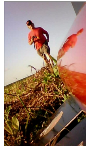
Down safe and sound!