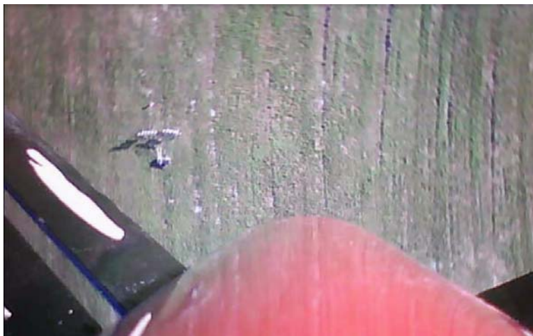
Flying over the low-power racks, shortly before landing