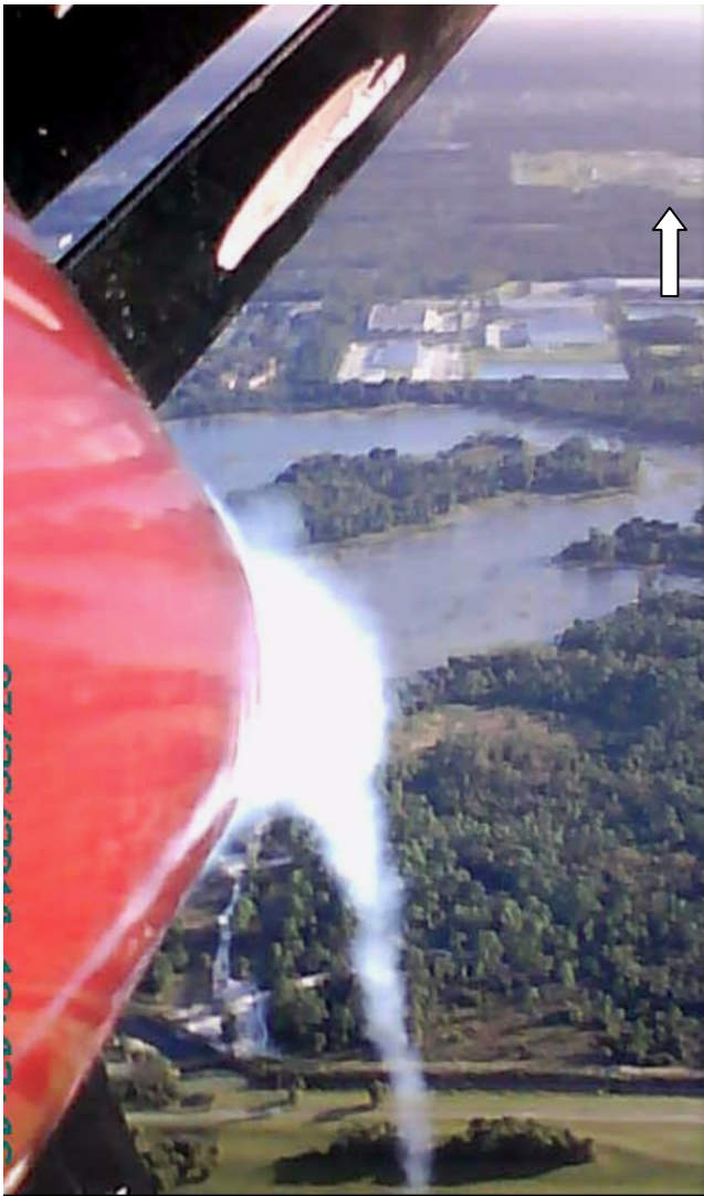
Nearing apogee at about 1100 foot altitude; rectangular green patch at far upper right is the Wastewater Treatment Plant, where FSA held its monthly launches from 1992-1993