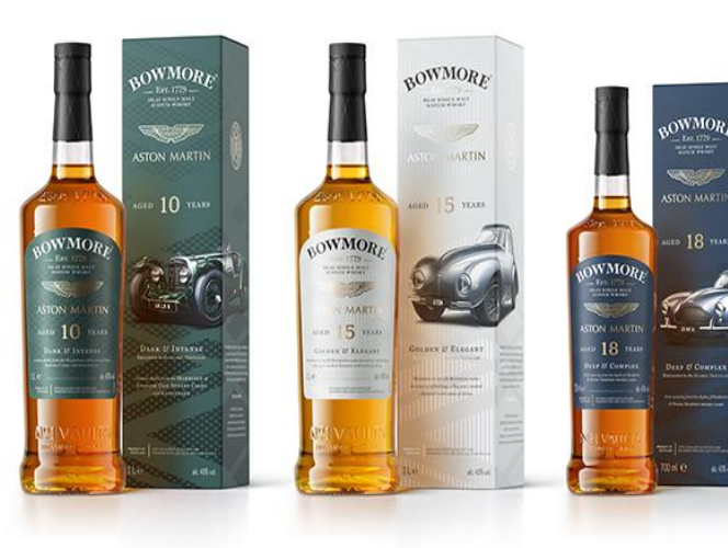
The new designs for Bowmore's GTR range pay homage to Aston Martin's iconic cars

Islay Scotch whisky brand Bowmore has unveiled three limited edition bottle designs for global travel retail as part of its collaboration with Aston Martin.