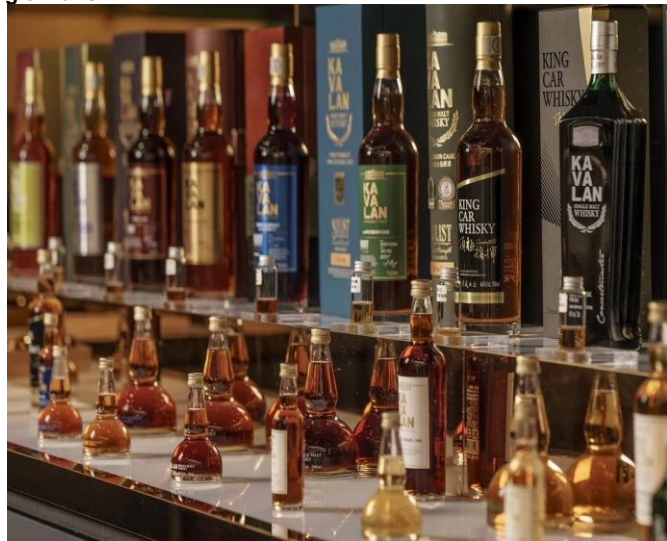
Kavalan whiskies

In some ways, the modern single malts of today are not that new at all. Whisky used to be sold much younger as a matter of course and convenience. The concept of aged whisky is a relatively new paradigm with Scotch single malts not regularly being matured in casks until the 1800s. Until then the whisky was sold virtually right off the still. Eventually casks became more common, but whisky was still sold at a comparatively young age, perhaps only a few years like our new-styled single malts.