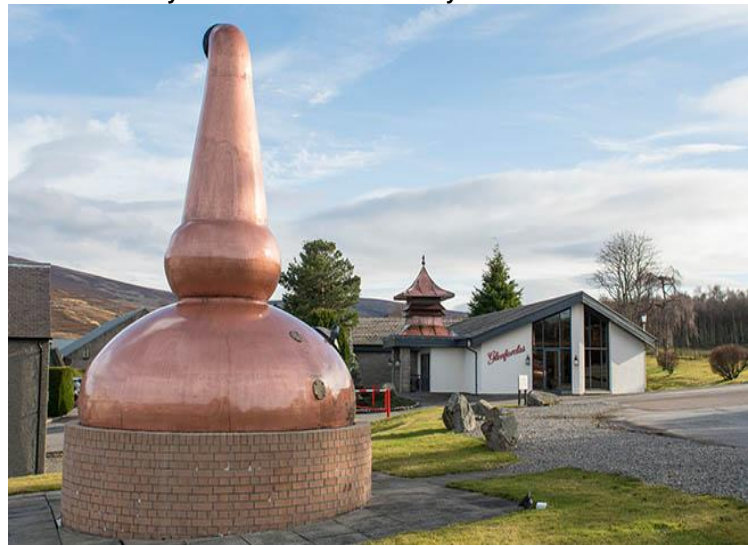
The Glenfarclas distillery in Speyside

Speyside producer Glenfarclas has received planning permission to build two whisky warehouses at its distillery in Ballindalloch.