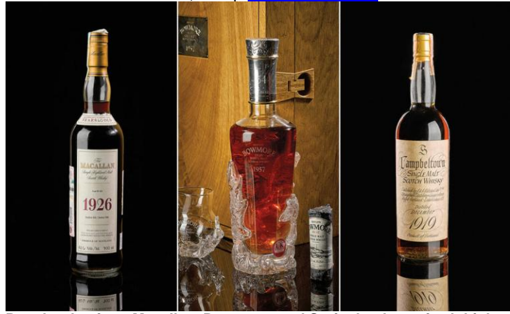
Rare bottles from Macallan, Bowmore, and Springbank can fetch high prices at auction.

Big Ticket Whiskies: Exploring The World's Most Expensive Bottles JULY 20, 2021 | JONNY MCCORMICK