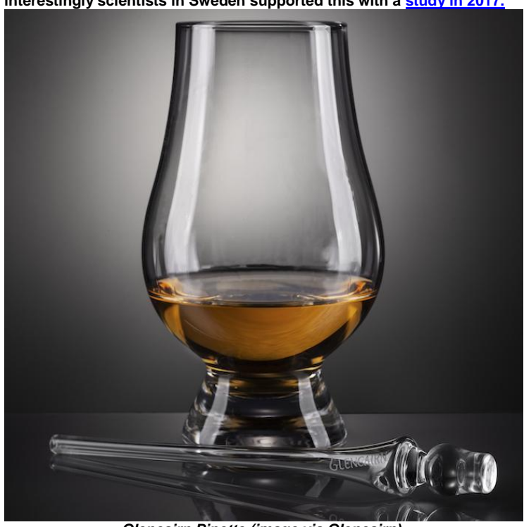
Glencairn Pipette

The family-run team at Glencairn believes that adding water to whisky can enhance the flavours and aromas found in your favourite dram. Many whisky lovers believe that adding water can 'open up' the aromas and flavours, dramatically altering and enhancing the taste interestingly scientists in Sweden supported this with a study in 2017.