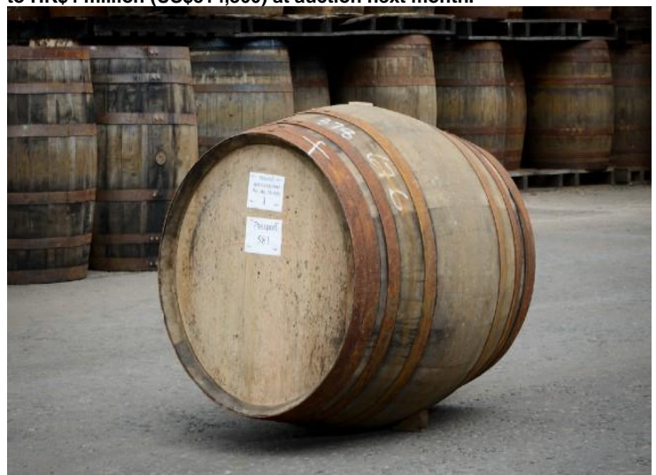
The 30-year-old Macallan cask will form part of Bonhams Hong Kong's Fine and Rare Whisky auction

A 30-year-old cask of Macallan Scotch whisky is expected to sell for up to HK$4 million (US$514,300) at auction next month.