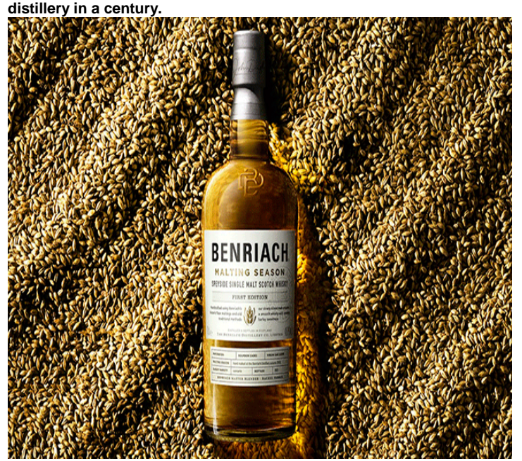
Only 6,672 bottles Benriach Malting Season will be available globally The first edition of Benriach Malting Season is double-cask-matured in Bourbon and virgin oak barrels.

Speyside producer Benriach has created a whisky made entirely from barley malted at its floor maltings – the first bottling of the sort from the