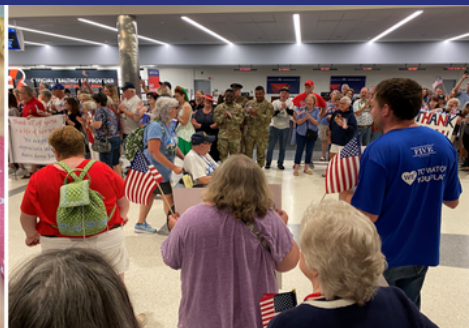
Highlights from the Aktion Club’s trip to the Honor Flight Welcome Home Celebration.