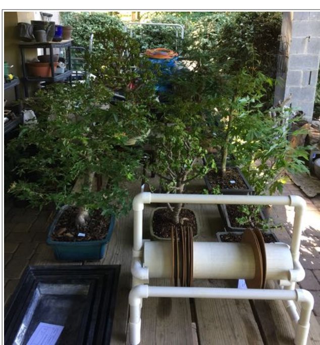
Trees, trays and wire managers for the Auction

A couple dozen members attended the 4 th Annual BSC Member Auction. A number of trees, pots, trays and other items changed hands.