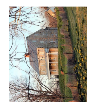
HALDEMAN MANSION PRESERVATION SOCIETY