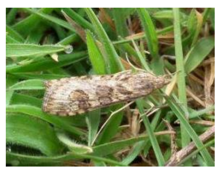
Nomophila noctuella at Samphire Hoe

Other Gracillariidae , also at Saltwood, included singles of Aspilapteryx tringipennella on the 18<sup>th</sup> August, Parornix anglicella on the 9<sup>th</sup> August, and Parornix finitimella on the 31<sup>st</sup> July, and single Phyllonorycter leucographella (Firethorn Leaf Miner) on the 16<sup>th</sup> and the 23<sup>rd</sup> August, Phyllonorycter trifasciella on 15<sup>th</sup> and 18<sup>th</sup> August, and Cameraria ohridella (Horse Chestnut Leaf Miner) on the 7<sup>th</sup> August and 13<sup>th</sup> September, with one of the latter species at Hythe on the 26<sup>th</sup> August.