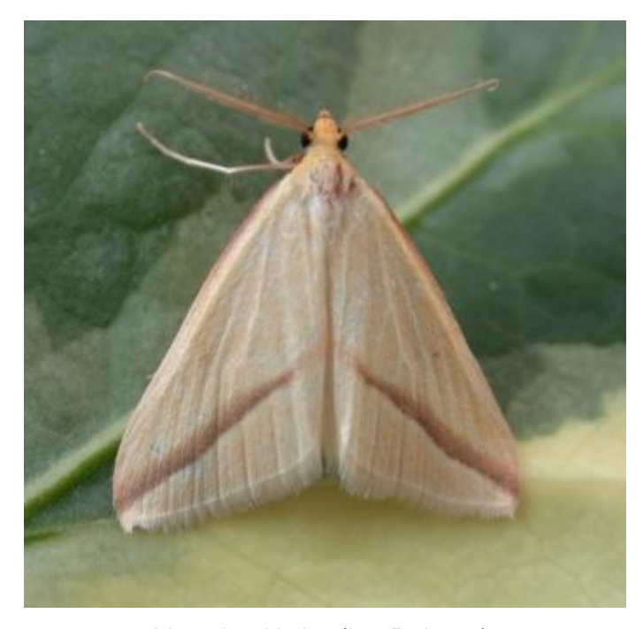
Vestal at Hythe