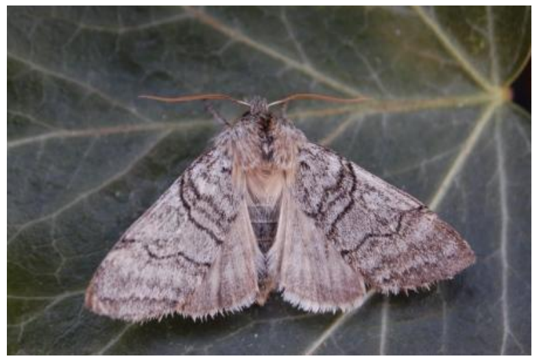
Yellow Horned at Saltwood (Paul Howe)

There were 6 Pretty Chalk Carpets trapped between the 9<sup>th</sup> May and the 7<sup>th</sup> September, 5 at Saltwood and 1 at Hythe, and single Scallop Shells were at Hythe on the 4<sup>th</sup> and the 8<sup>th</sup> July, with another at Saltwood on the latter date. Two Autumnal Moths were identified amongst the more numerous November Moths at Saltwood in late October and Winter Moths were trapped in January and from late October to December. Two Sandy Carpets were at Saltwood on the 27<sup>th</sup> and 29<sup>th</sup> May, with one at Dibgate Quarry on the 23<sup>rd</sup> June.