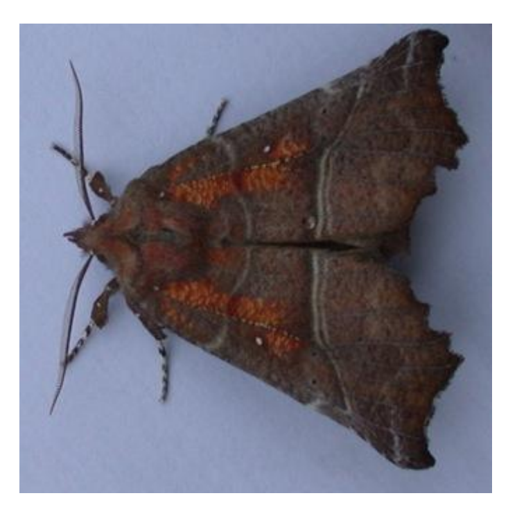
Herald at Hythe (Ian Roberts)

A total of 21,220 macro moths of 339 species were identified in 2012 (which was a slight increase in both numbers and species from the previous year, when 20,855 macro moths of 326 species were recorded).