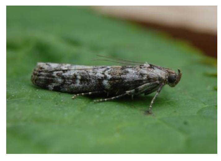
Dioryctria sylvestrella at Saltwood (Paul Howe)

There were three Synaphe punctalis noted, two at Hythe in July and one at Saltwood in August. Six Pyralis farinalis (Meal Moth) were trapped between mid-June and mid-October, with two at Hythe and four at Saltwood, whilst there was a good total of 32 Aglossa pinguinalis (Large Tabby) at the latter site between 7<sup>th</sup> July and 14<sup>th</sup> August. Four Galleria mellonella (Wax Moth) at Saltwood in August and early September were also of note.