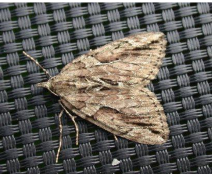
Cypress Carpet at Hythe (Ian Roberts)

There were two early records of Humming-bird Hawk-moth (at Saltwood on the 27<sup>th</sup> March and Capel-le-Ferne on the 29<sup>th</sup> March), followed by two at Samphire Hoe in July (on the 10<sup>th</sup> and 12<sup>th</sup>), and singles in September at Seabrook on the 3<sup>rd</sup>, Saltwood on the 4<sup>th</sup> and Seabrook again on the 13<sup>th</sup>. There was also an early record of Dark Sword-grass (at Saltwood on the 18<sup>th</sup> March), with another ten there between the 17<sup>th</sup> July and 24<sup>th</sup> October, but just one at Hythe (on the 4<sup>th</sup> September).