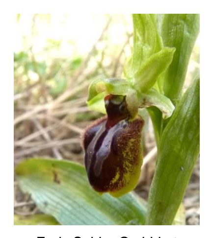
Early Spider Orchid at Samphire Hoe (Steve Coates)

Of most note amongst the flora was the second highest count ever of Early Spider Orchid at Samphire Hoe, with 11,500 present, and with some in flower as early as the 1<sup>st</sup> April.