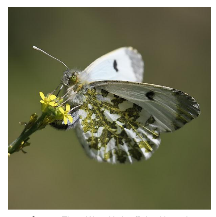
Orange Tip at West Hythe (Brian Harper)