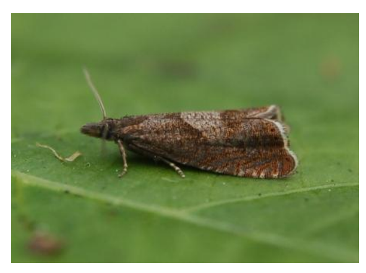
Dichrorampha acuminatana at Saltwood

Only two Evergestis extimalis were recorded in 2012, singles at Saltwood on the 18<sup>th</sup> August and Hythe on the 22<sup>nd</sup> August, with the same total of Ostrinia nubilalis (European Corn Borer), singles at Hythe on the 17<sup>th</sup> July and 1<sup>st</sup> August.