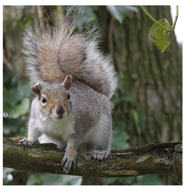
Grey Squirrel at West Hythe (Brian Harper)