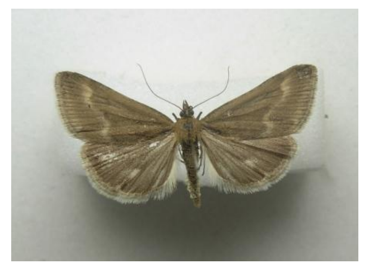
Pyrausta aerealis at Dibgate Quarry (Tony Steele)

The influx of Yponomeuta rorrella (Willow Ermine) between the 24<sup>th</sup> July and the 23<sup>rd</sup> August was more evenly spread, with 27 at Saltwood and 19 at Hythe. The bulk of the records were in late July, including a peak of 15 (10 at Hythe and 5 at Saltwood) on the 27<sup>th</sup>.