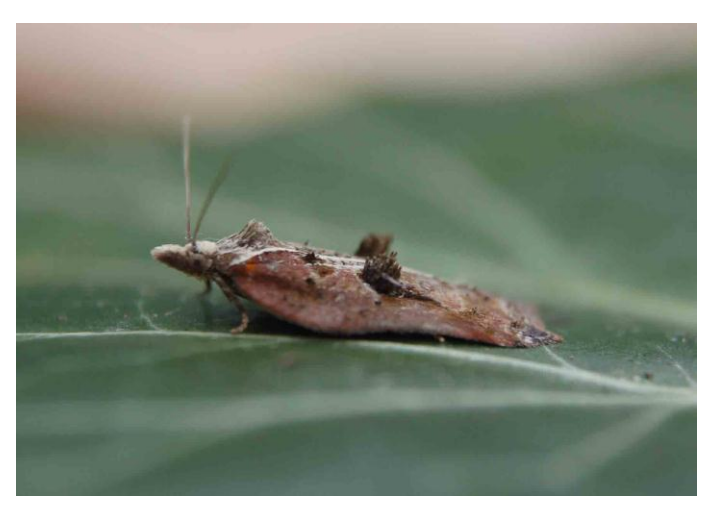
Acleris cristana at Saltwood