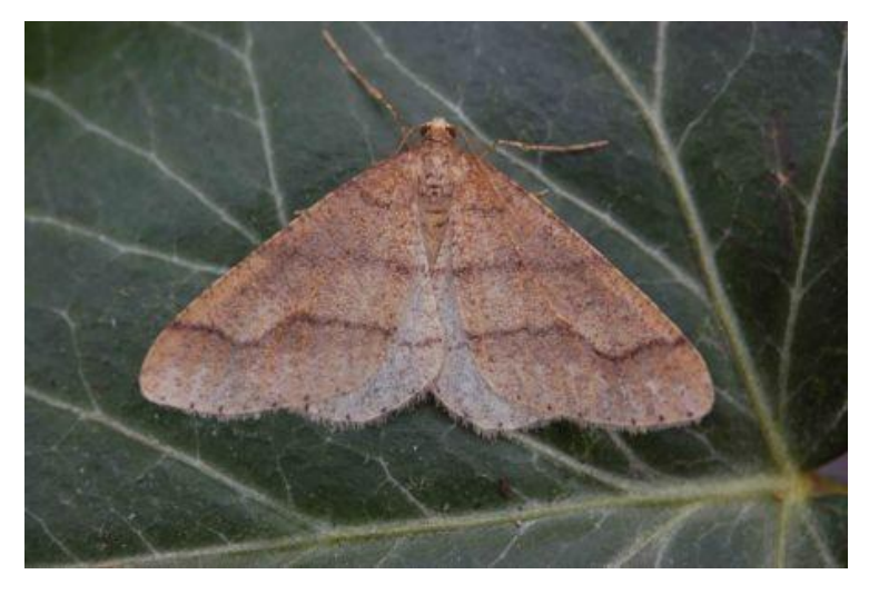
Dotted Border at Saltwood (Paul Howe)