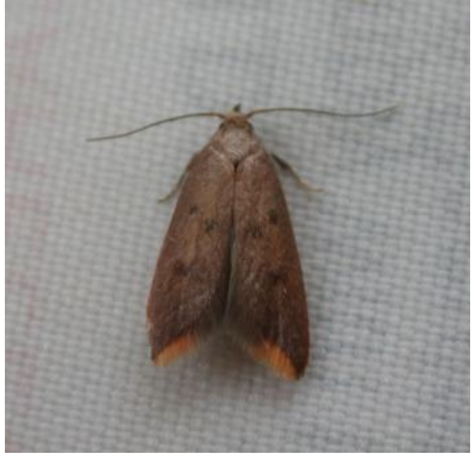
Agonopterix yeatiana at Saltwood