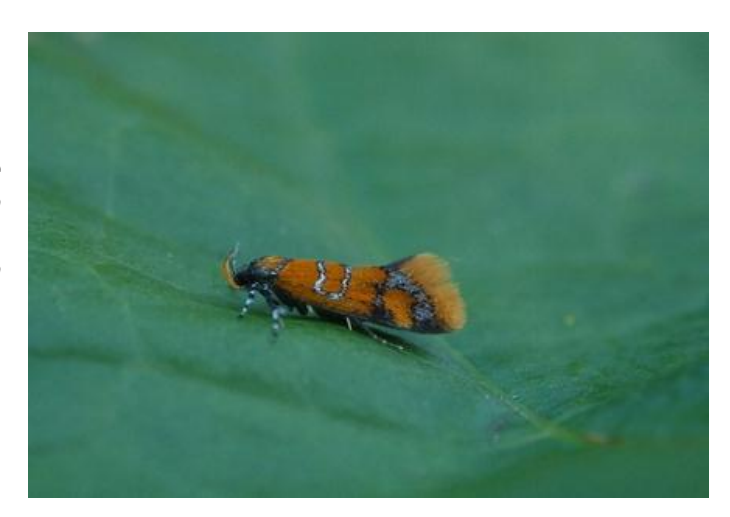
Bisigna procerella at Saltwood (Paul Howe)