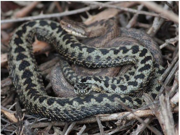
Adder at Peene