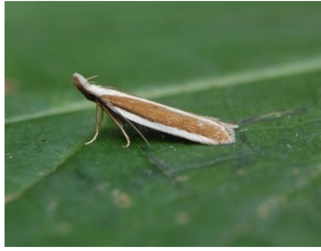
Dichomeris marginella at Saltwood

Dichomeris marginella (Juniper Webber) was trapped at Saltwood on the 14<sup>th</sup> and the 19<sup>th</sup> July, and single Helcystogramma rufescens were at Hythe on the 27<sup>th</sup> July and Saltwood on the 31<sup>st</sup> July. A Mompha ochracella was trapped at Dibgate Quarry on the 23<sup>rd</sup> June and a Limnaecia phragmitella was at Saltwood on the 8<sup>th</sup> August.