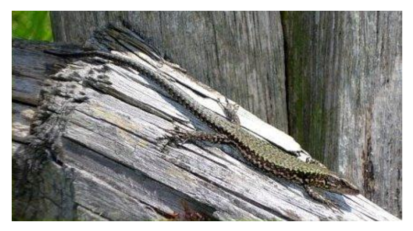
Wall Lizard at Folkestone Warren

The colony of introduced Wall Lizards remained in the Little Switzerland area of Folkestone Warren and Adders were seen in their usual haunts along the downs between Peene and Samphire Hoe.