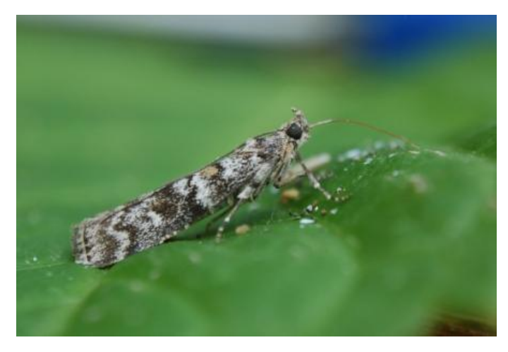
Dioryctria abietella at Saltwood

Single Dioryctria abietella were taken at Saltwood on the 27<sup>th</sup> and 29<sup>th</sup> May, with a total of 8 D. sylvestrella there between late July and mid-August. A single Assara terebrella was trapped at Saltwood on the 19<sup>th</sup> July, with a Nephopterix angustella there on the 9th September and a Homoeosoma nebulella on the 9<sup>th</sup> July.