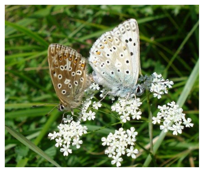
Chalkhill Blues at Castle Hill

The future for the Grayling at Folkestone Warren (its sole haunt in Kent) remains very worrying as there was just one sighting of two there on the 11<sup>th</sup> August, which follows the single record last year. Other rarer residents were represented by 2 Silver-spotted Skippers at Cheriton Hill on the 17<sup>th</sup> August, a single Chalkhill Blue there on the 9<sup>th</sup> August, with a breeding pair at Castle Hill on the 17<sup>th</sup> August, and Small Blues at Crete Road West and Round Down in late May and up to 6 at Samphire Hoe on 19<sup>th</sup> June.