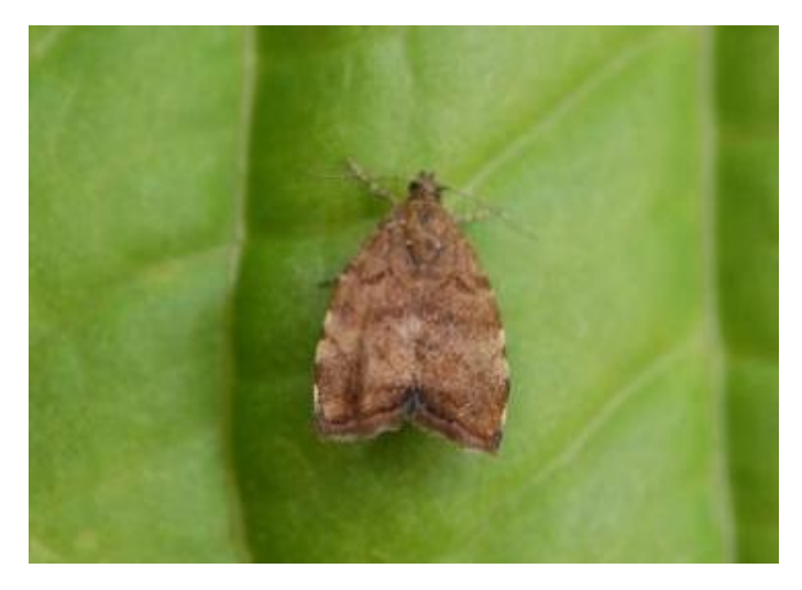
Choreutis pariana at Saltwood

A single Choreutis pariana (Apple Leaf Skeletonizer) at Saltwood on the 25<sup>th</sup> July was also of note. Nine species of Argyresthia were recorded, with an albistria at Saltwood on the 28<sup>th</sup> August and singles of semifusca there on the 25<sup>th</sup> and the 28<sup>th</sup> May probably the most noteworthy.