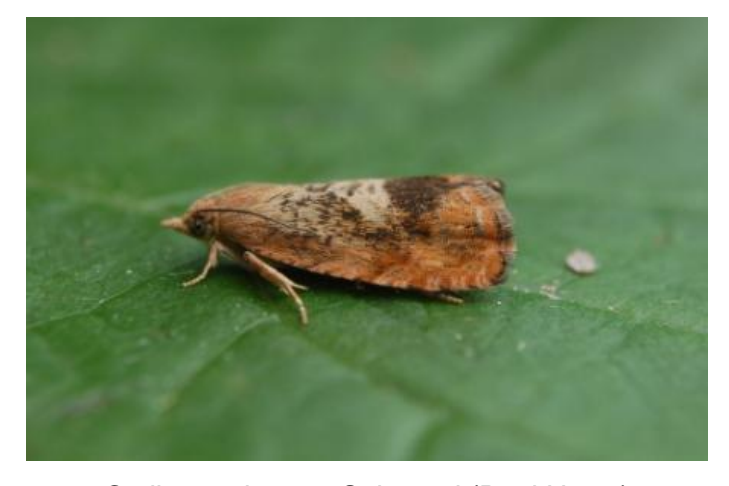
Cydia amplana at Saltwood (Paul Howe)

There was an exceptional total of 8 Evergestis limbata , 5 at Saltwood and 3 at Hythe, between the 7<sup>th</sup> July and 4<sup>th</sup> August, an indication perhaps that it might be becoming locally established.