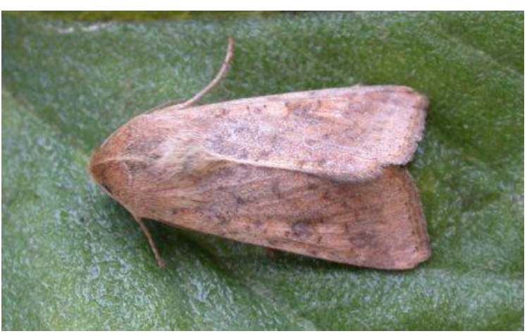
Scarce Bordered Straw at Saltwood (Paul Howe)