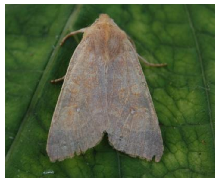
Pale-lemon Sallow at Saltwood (Paul Howe)

There were a total of 8 Clancy's Rustics (all at Saltwood between the 1<sup>st</sup> and 11<sup>th</sup> October), 6 Langmaid's Yellow Underwings (4 at Saltwood and 2 at Hythe, all between the 8<sup>th</sup> and 19<sup>th</sup> August) and 5 Cypress Carpets (singles at Saltwood on the 29<sup>th</sup> May, Hythe on the 26<sup>th</sup> June, Saltwood on 8<sup>th</sup> July, and Saltwood on the 7<sup>th</sup> and 8<sup>th</sup> November). These species appear to be established in the county but some records might still relate to immigrants.