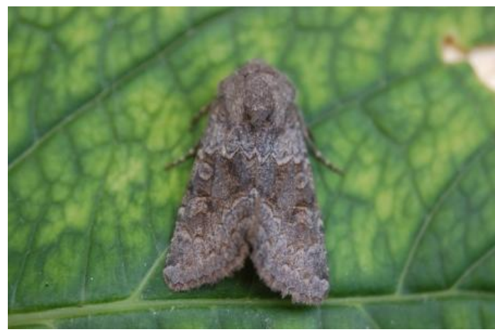
Deep-brown Dart at Saltwood (Paul Howe)

A Brindled Green was at Saltwood on the 7<sup>th</sup> October, with 8 Merveille du Jour trapped there in October, and totals for the area of 16 Green-brindled Crescent and 30 Large Ranunculus. A Brown-spot Pinion was taken at Saltwood on the 11<sup>th</sup> October. Four Orange Sallow were recorded in September (one at Hythe and 3 at Saltwood) and 2 Pink-barred Sallow were at the latter site in October.