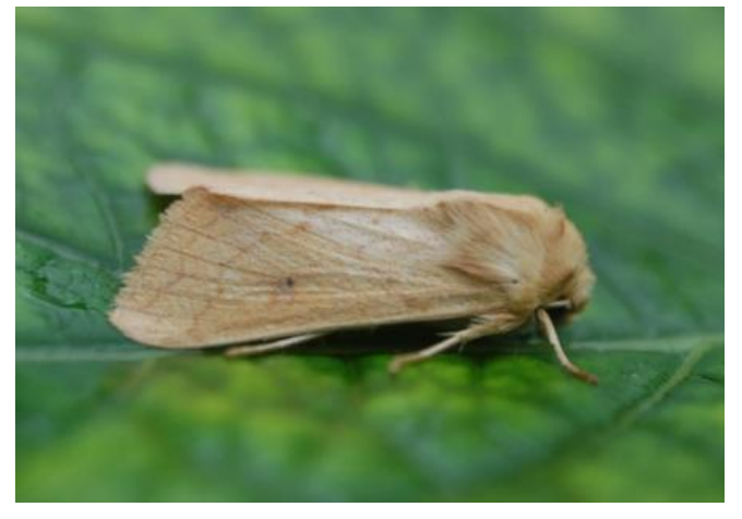
Delicate at Hythe