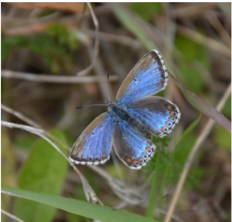
Variant female Adonis Blue at Samphire Hoe (Phil Smith)