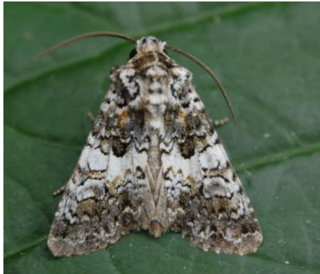
Red Chestnut at Folkestone Warren