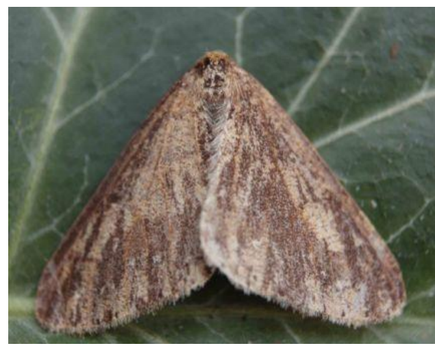
Aberrant Dotted Border at Saltwood (Paul Howe)

There were only two Brindled Beauty recorded (singles at Saltwood on the 1<sup>st</sup> and 2<sup>nd</sup> May) but good totals of Pale Brindled Beauty (16), Oak Beauty (20) and Spring Usher (24), whilst 9 Dotted Border at Saltwood between late February and late March included an aberrant individual. A single Pale Oak Beauty was at Saltwood on the 17<sup>th</sup> June, with another at Dibgate Quarry on the 23<sup>rd</sup> June.