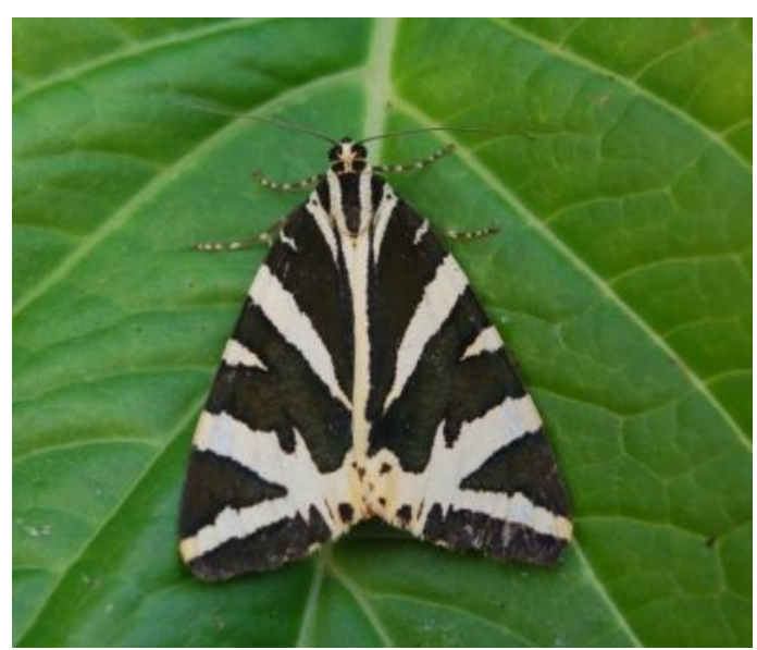
Jersey Tiger at Saltwood