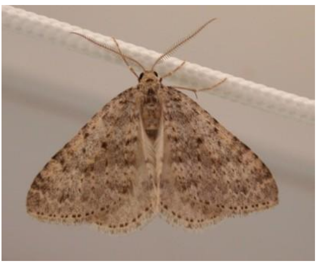
Mottled Grey at Folkestone Warren (Ian Roberts)

Some 23 species of Pug were recorded at Saltwood, some of the more notable of which included single Slender Pug on the 30<sup>th</sup> July, Triple-spotted Pug on the 2<sup>nd</sup> August and Currant Pug on the 30<sup>th</sup> April, two each of Foxglove Pug, White-spotted Pug, Bordered Pug, and both forms of Angle-barred Pug (Anglebarred and Ash). Three Maple Pug and Shaded Pug, 4 Haworth's Pug, 7 Tawny-speckled Pug and 10 Oak-tree Pug were also of note.