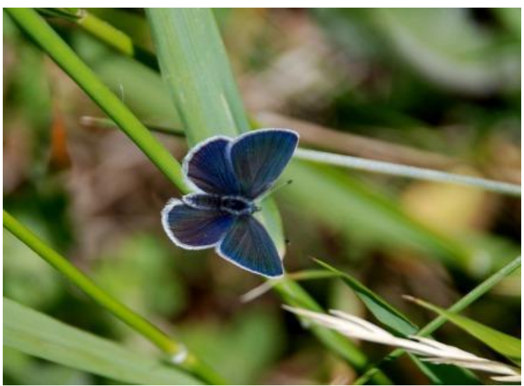
Small Blue at Samphire Hoe (Phil Smith)

There were 3 records of Brimstone at Samphire Hoe and a Purple Hairstreak attracted to an actinic light trap at Saltwood on the 17<sup>th</sup> August was noteworthy. The Folkestone/Dover area is the stronghold of the Wall butterfly in Kent and local counts included 9 at Folkestone Warren and 12 at Samphire Hoe on the 13<sup>th</sup> May, 11 at Folkestone Warren on the 11<sup>th</sup> August, and 8 at Folkestone Escarpment and 9 at Cheriton Hill on the 17<sup>th</sup> August. The Dingy Skipper is also relatively localised and there were notable counts of 43 along the Downs above Folkestone on the 30<sup>th</sup> April and 10 at Samphire Hoe on the 13<sup>th</sup> May (virtually no second generation was recorded in Kent due to poor weather but two were at Cheriton Hill on the 17<sup>th</sup> August).