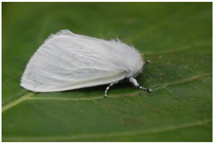
White Satin at Saltwood (Paul Howe)

There were just 5 Garden Tiger records (at Saltwood in mid-July) and Cream-spot Tigers were at Saltwood and off Dover Road (near Folkestone East station), as well as the usual haunt of Samphire Hoe. A Short-cloaked Moth was at Hythe on the 19<sup>th</sup> July and 5 Least Yellow Underwings were at Saltwood in late July and August. Five White-line Darts were at Saltwood in August, with 3 Autumnal Moths there in the first half of October, 5 Triple-spotted Clays there in July and two Six-striped Rustic there on both the 10<sup>th</sup> and 14<sup>th</sup> September.