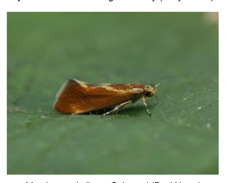
Metalampra italica at Saltwood (Paul Howe)