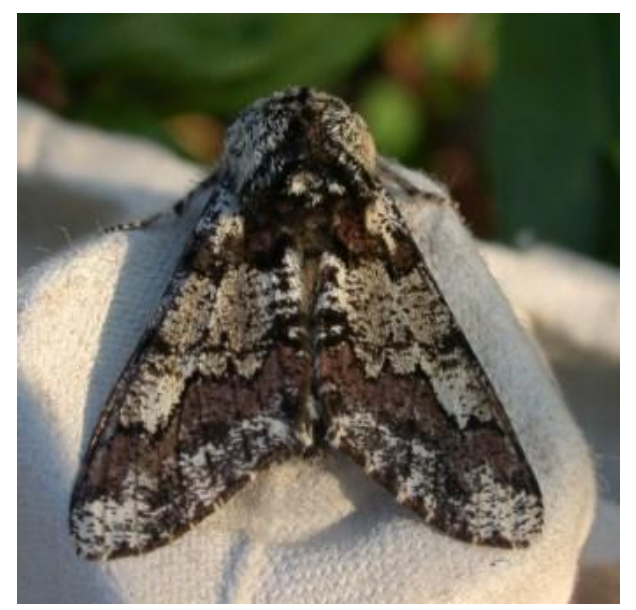
Oak Beauty at Hythe (Ian Roberts)

There were only two Brindled Beauty recorded (singles at Saltwood on the 1<sup>st</sup> and 2<sup>nd</sup> May) but good totals of Pale Brindled Beauty (16), Oak Beauty (20) and Spring Usher (24), whilst 9 Dotted Border at Saltwood between late February and late March included an aberrant individual. A single Pale Oak Beauty was at Saltwood on the 17<sup>th</sup> June, with another at Dibgate Quarry on the 23<sup>rd</sup> June.