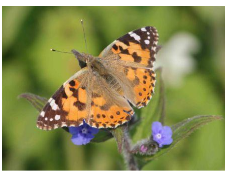
Painted Lady near Hythe Redoubt

The future for the Grayling at Folkestone Warren (its sole haunt in Kent) remains very worrying as there was just one sighting of two there on the 11<sup>th</sup> August, which follows the single record last year. Other rarer residents were represented by 2 Silver-spotted Skippers at Cheriton Hill on the 17<sup>th</sup> August, a single Chalkhill Blue there on the 9<sup>th</sup> August, with a breeding pair at Castle Hill on the 17<sup>th</sup> August, and Small Blues at Crete Road West and Round Down in late May and up to 6 at Samphire Hoe on 19<sup>th</sup> June.