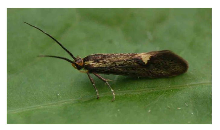
Esperia sulphurella at Saltwood

The Agonopterix species were represented by single A. purpurea at Saltwood on the 10<sup>th</sup> May and A. nervosa there on the 31<sup>st</sup> July, three A. yeatiana at the same site (on the 4<sup>th</sup> April, the 19<sup>th</sup> June and the 25<sup>th</sup> July), and more regular A. arenella and A. heracliana .