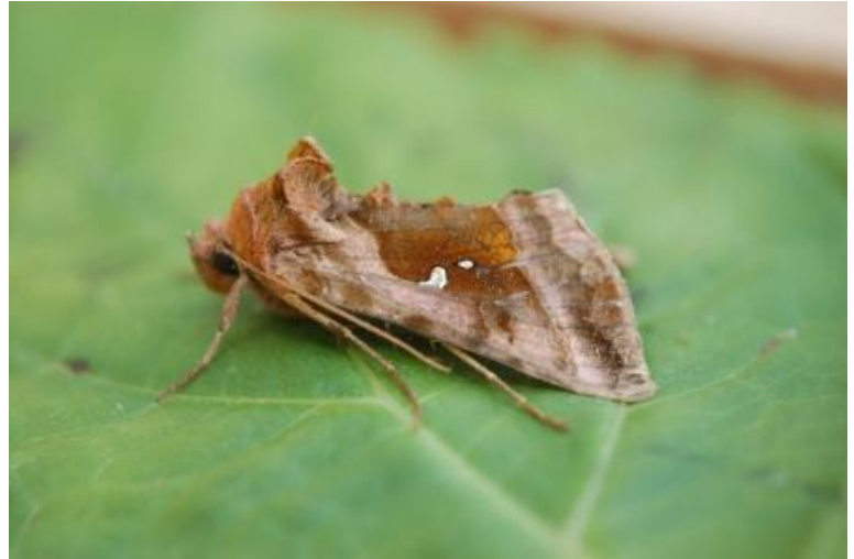
Plain Golden Y at Saltwood (Paul Howe)

A Clouded-bordered Brindle was at Saltwood on the 8<sup>th</sup> July, with 2 Clouded Brindles there in June and 4 Slender Brindles in August, and there was a very interesting series of Mere Wainscot records there with singles on the 21<sup>st</sup> July, and the 21<sup>st</sup> and 23<sup>rd</sup> August. A Small Wainscot was trapped there on the 12<sup>th</sup> August.