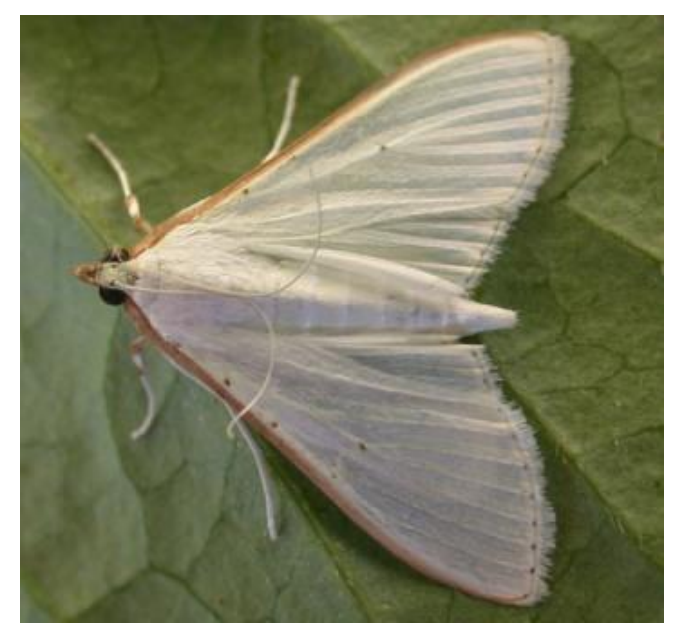
Palpita vitrealis Hythe

The first Nomophila noctuella was at Samphire Hoe on the 1<sup>st</sup> May with a further 4 in May, and later in the year it was recorded between the 15<sup>th</sup> July and 23<sup>rd</sup> October, with the bulk in August, including a peak of 11 at Saltwood on the 20<sup>th</sup>. The vast majority (89%) were at Saltwood, with a few scattered records from Abbotscliffe, Hythe, Samphire Hoe and Seabrook.