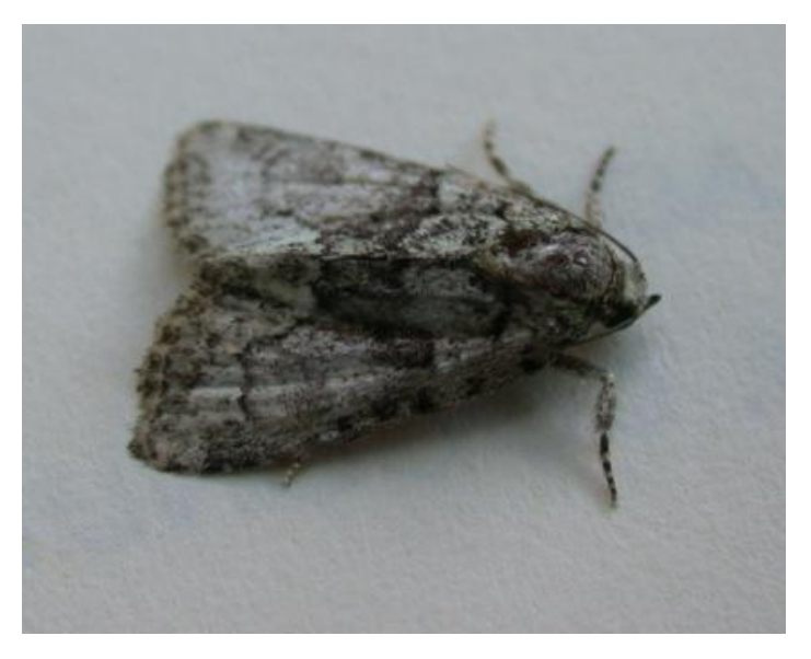
Tree-lichen Beauty at Hythe (Ian Roberts)

Totals of the regular migrant moths recorded in 2012 are provided in figure 1 (above). There was only one record of Vestal (at Hythe on the 26<sup>th</sup> September, a new record for the site), whilst the single Bordered Straw was at Seabrook on the 4<sup>th</sup> July. There were two records each of Scarce Bordered Straw (at Hythe on the 8<sup>th</sup> October and Saltwood on the 23<sup>rd</sup> October), Delicate (at Saltwood on the 29<sup>th</sup> September and the 3<sup>rd</sup> October) and Pearly Underwing (singles at Saltwood on the 27<sup>th</sup> and 28<sup>th</sup> October).