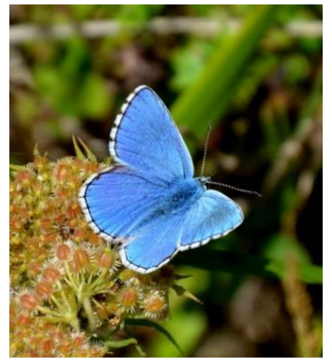
Male Adonis Blue at Samphire Hoe