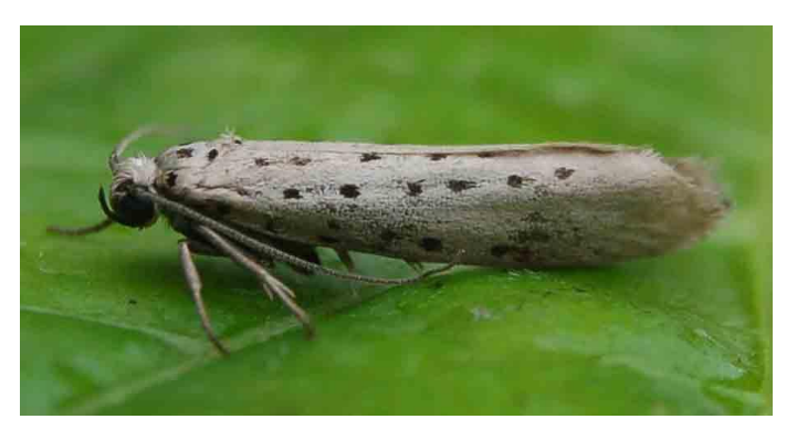
Yponomeuta sedella at Saltwood

A Diurnea lipsiella at Saltwood on the 13<sup>th</sup> November was a notable record, and a Depressaria pastinacella (Parsnip Moth) was trapped there Saltwood on the 14<sup>th</sup> March, with a D. daucella on the 20<sup>th</sup> March.