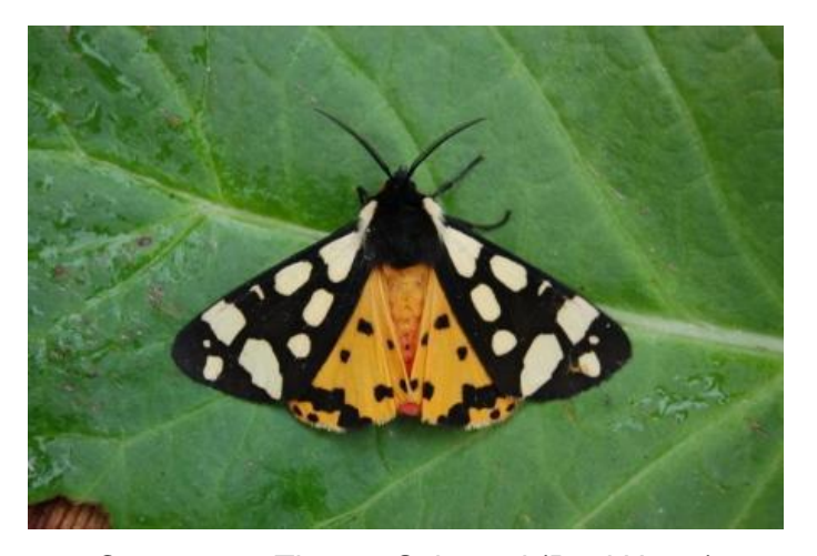
Cream-spot Tiger at Saltwood

Three Red Chestnuts were trapped in Folkestone Warren on the 10<sup>th</sup> March, with three singles in Saltwood later in the month, and there were 4 Light Brocades recorded in May (one at Saltwood and 3 at Hythe), with another at the former site in July.