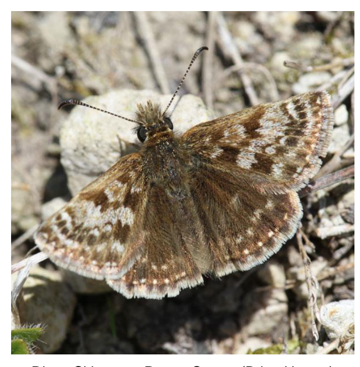
Dingy Skipper at Peene Quarry