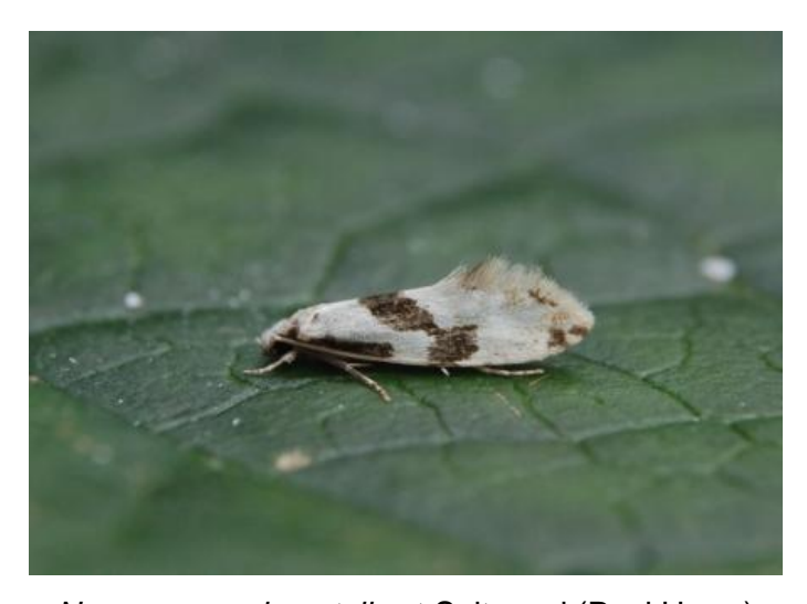
Nemapogon clematella at Saltwood (Paul Howe)