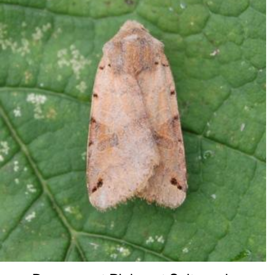
Pale Pinion at Saltwood (Paul Howe)