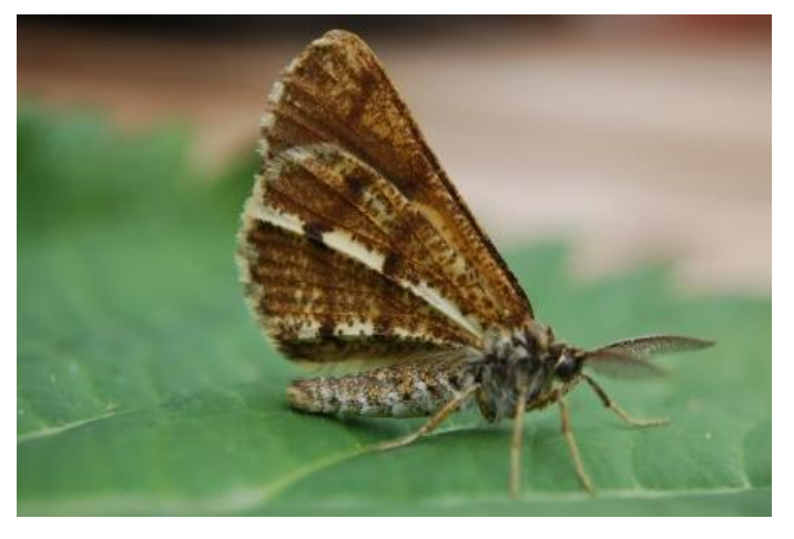
Bordered White at Saltwood

A Pine Hawk-moth was at Saltwood on the 8<sup>th</sup> August, with 3 Lime Hawk-moths there in June and July, and there were just 3 records of Privet and Eyed Hawk-moths, and 2 Small Elephant Hawk-moths – singles at Dibgate Quarry on the 23<sup>rd</sup> June and at Seabrook on the 4<sup>th</sup> July. A single Puss Moth was at Hythe on the 28<sup>th</sup> May.