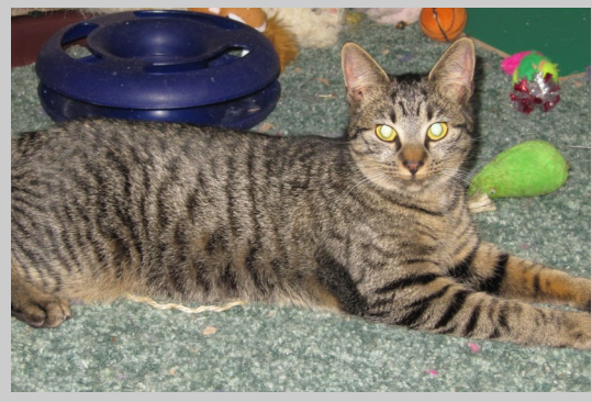
Amity, NKA Yuki, living very happily ever after in her furever home!

Our Mission: Felines First Rescue is a dedicated, no-kill network of volunteers and foster homes striving to help and care for the abandoned, stray, helpless and homeless felines in the Portland Metro area. All kittens are examined by a veterinarian, assessed for any special needs, vaccinated, tested, microchipped and spayed or neutered prior to leaving our care. We believe in every adoption being PURRFECT and FUREVER and are committed to providing post-adoption counseling, education and working as a resource for our community.