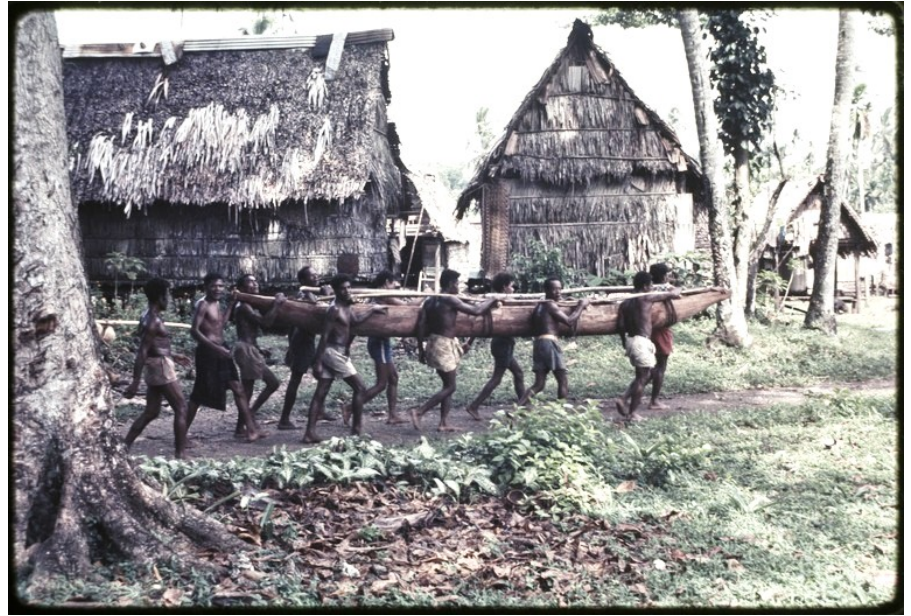
Canoe-building: men carry a new canoe through Tukwaukwa village on Kiriwina, 1976. Edwin Hutchins and Dona Hutchins Collection, UC San Diego Library. https://library.ucsd.edu/dc/object/bb0172231g