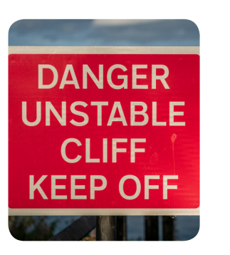
Look for warning signs, follow advice and do not take risks.

The coastline can be a dangerous place. It is important to stay safe and know what to do in an emergency.