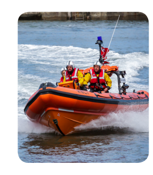
Call 999 in an emergency. Ask for the coastguard and they will call for the lifeboat.