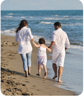
Never go near water alone. Make sure an adult is with you.