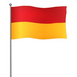
Red and yellow flags mean it is safe to swim.