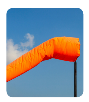
Do not use inflatable toys or airbeds in the sea when a wind sock is blowing.