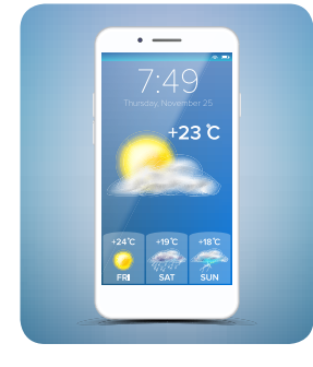
Check the weather forecast for bad weather.