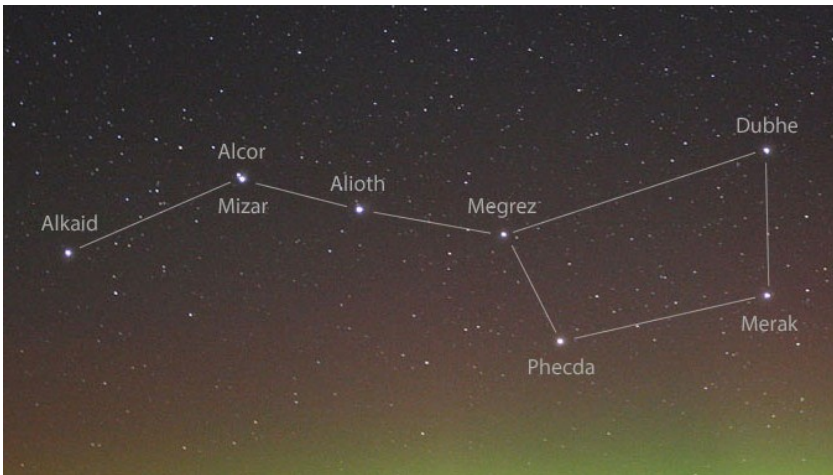
The Big Dipper