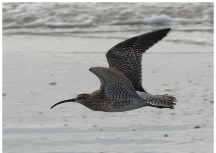
Whimbrel at the Dymchurch Redoubt