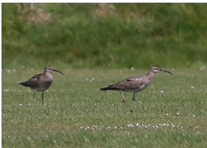
Whimbrels at Hotel Imperial Golf Course (Brian Harper)