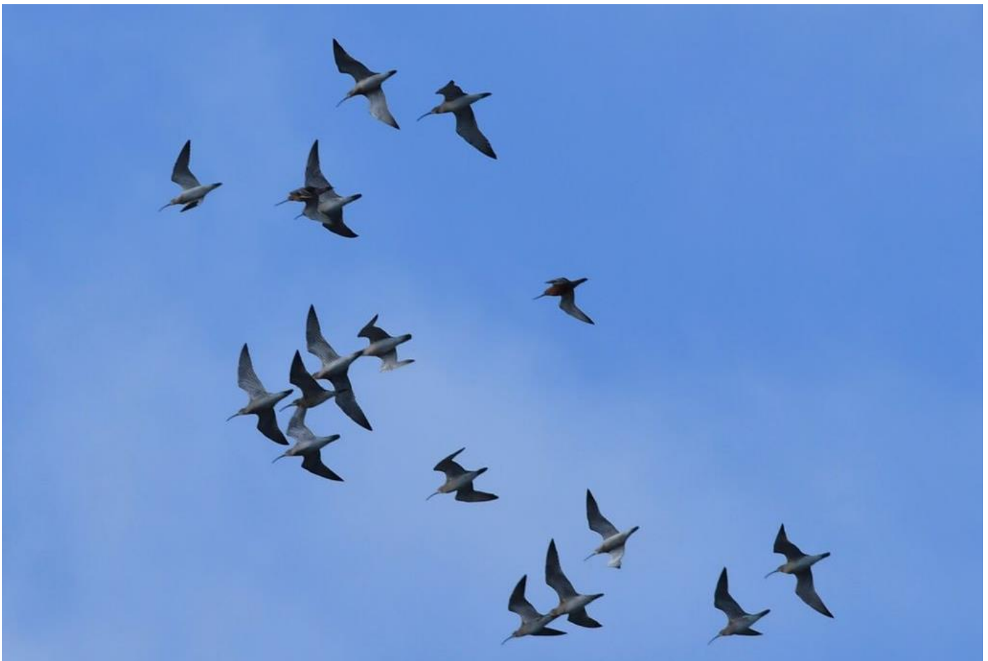
Whimbrels and Bar-tailed Godwits heading east past Princes Parade