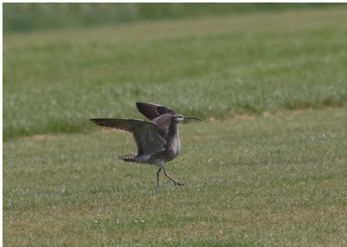
Whimbrel at Hotel Imperial Golf Course (Brian Harper)

March records are rare, having been noted in just three years, with one flying east past Samphire Hoe on the 25 th March 2011, one flying east past Seabrook on the 27 th March 2020 and three at the Willop Basin on the 29 th March 2021. The first migrants are usually seen in April, with a mean arrival date in the last decade of 10 th April.