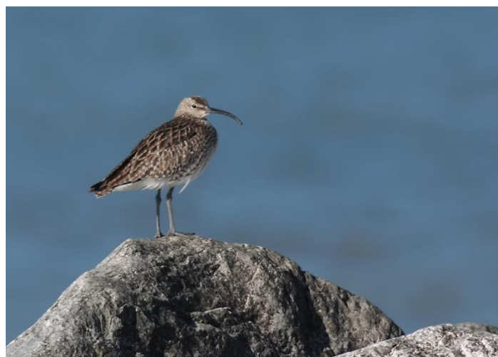
Whimbrel at Princes Parade