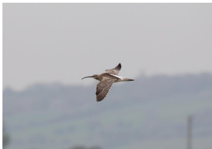
Whimbrel at the Willop Basin