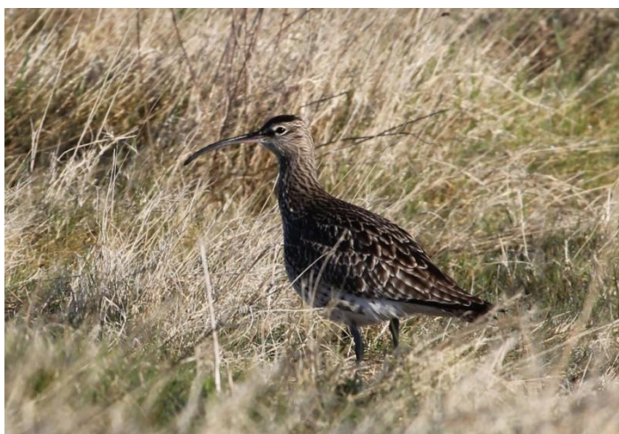
Whimbrel at Nickolls Quarry