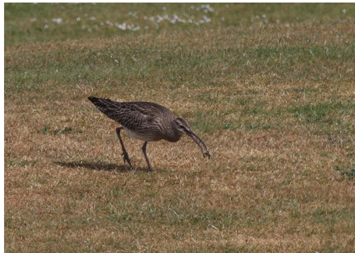
Whimbrel at Hotel Imperial Golf Course (Brian Harper)