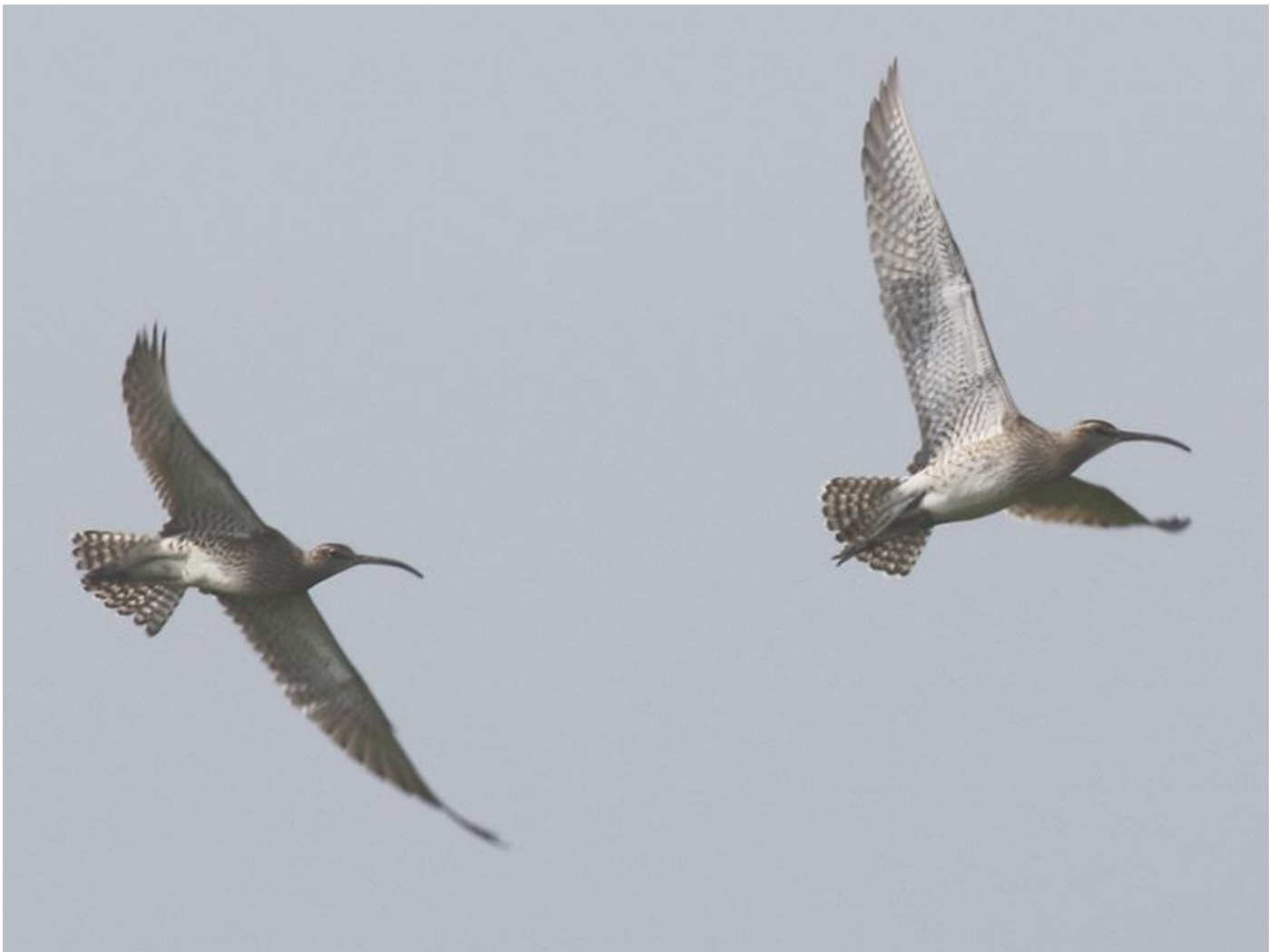
Whimbrels at Donkey Street