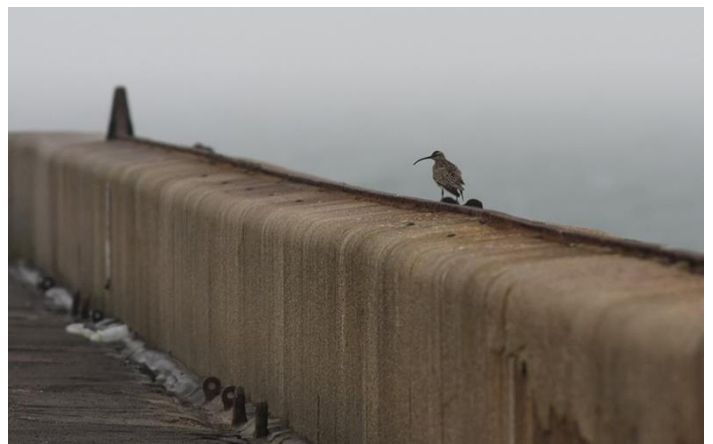
Whimbrel at Folkestone Pier (Brian Harper)

Whilst passage is primarily coastal, Roger Norman has considered it to be a regular spring migrant at Nickolls Quarry since coverage recommenced in 1990. Counts have typically been in single figures but larger flocks have occurred on six occasions: 16 flying east on the 6 th May 1995, 12 flying north on the 27 th April 1997, 15 flying north on the 7 th May 1999, 24 flying east on the 10 th May 2002, 24 on the 3 rd May 2009 and 13 on the 2 nd May 2012.