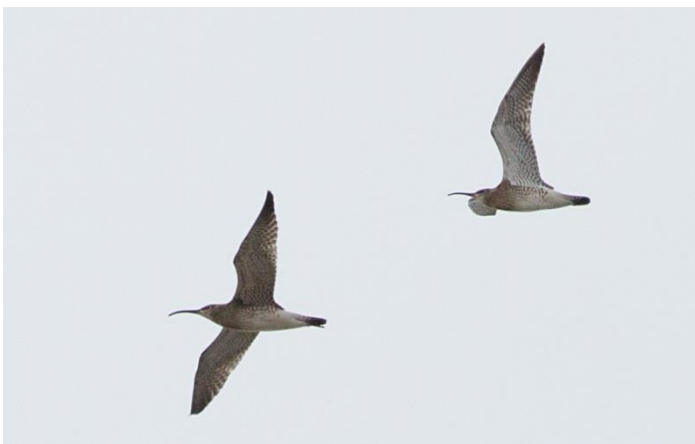
Whimbrels at Hythe (Glenn Tutton)

82 east past Mill Point on the 8 th May 1991 53 east past Mill Point on the 10 th May 1991 87 east past Copt Point on the 10 th May 1993 140 east past Copt Point on the 10 th May 1996 167 east past Copt Point on the 7 th May 2001 230 east past Copt Point on the 8 th May 2001 53 east past Mill Point on the 2 nd May 2004 100 east past Mill Point on the 8 th May 2010 87 east past Copt Point on the 3 rd May 2011 68 east past Samphire Hoe on the 7 th May 2017 71 east past Samphire Hoe on the 6 th May 2018 56 east past Samphire Hoe on the 7 th May 2018