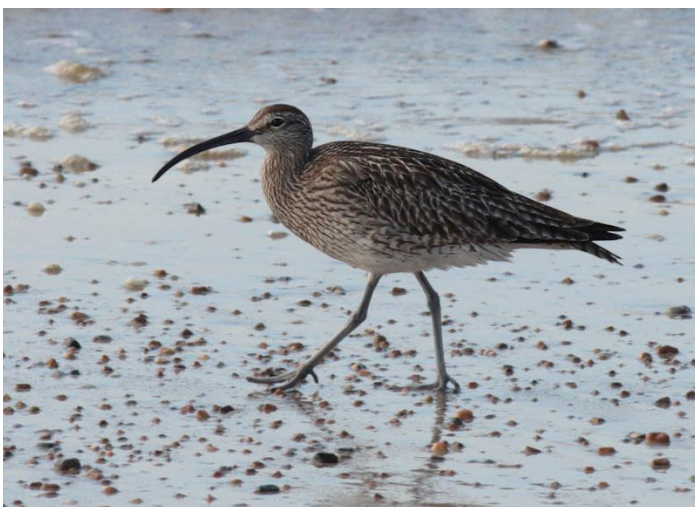
Whimbrel at the Dymchurch Redoubt (Brian Harper)

Whilst passage is primarily coastal, Roger Norman has considered it to be a regular spring migrant at Nickolls Quarry since coverage recommenced in 1990. Counts have typically been in single figures but larger flocks have occurred on six occasions: 16 flying east on the 6 th May 1995, 12 flying north on the 27 th April 1997, 15 flying north on the 7 th May 1999, 24 flying east on the 10 th May 2002, 24 on the 3 rd May 2009 and 13 on the 2 nd May 2012.