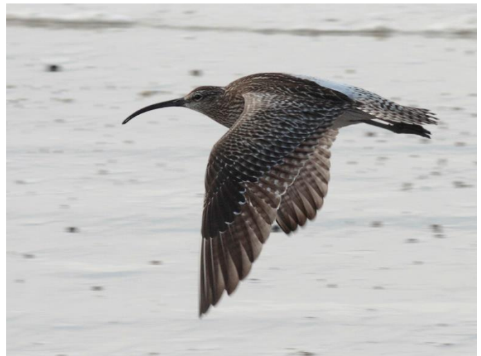
Whimbrel at the Dymchurch Redoubt (Brian Harper)

Breeds across Fenno-Scandia and northern Russia, very locally into Siberia, and also in Alaska, parts of Canada, and Greenland and Iceland, with a small population of around 300 pairs in northern Scotland, principally in Shetland. Western Palearctic populations winter mainly in the Afrotropical region and on islands and coasts of the western Indian Ocean. Migrants pass through western Europe in spring and autumn.