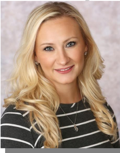
Owner & Director of Dance Instruction

Please register early in order to reserve your place in class. Our schedules are filled on a first-come, first-serve basis. 2021 Spring Class Registrations must be received by January 16, 2021.