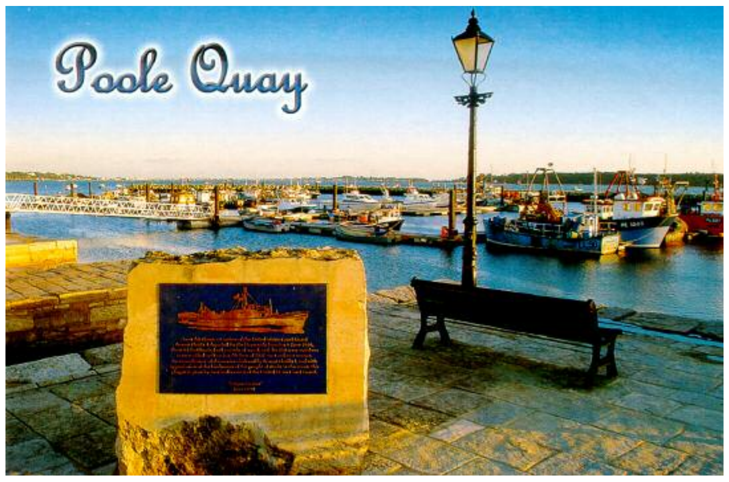
The CGCVA monument commemorating the World War II Rescue Flotilla Fleet of 83-footers in Poole, England.