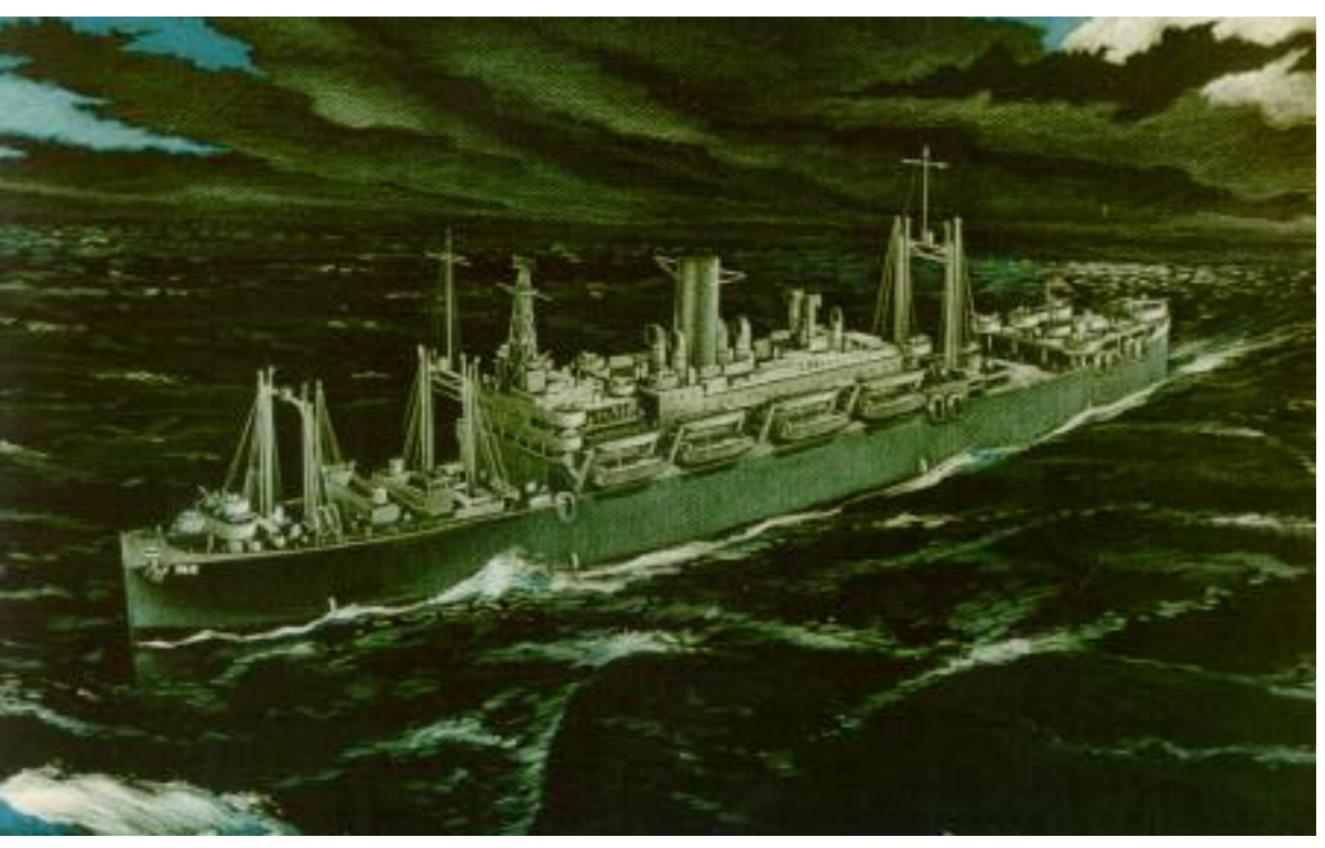
USS Leonard Wood (APA-12)

The officer of the deck for Sherman during the steel trawler shoot out