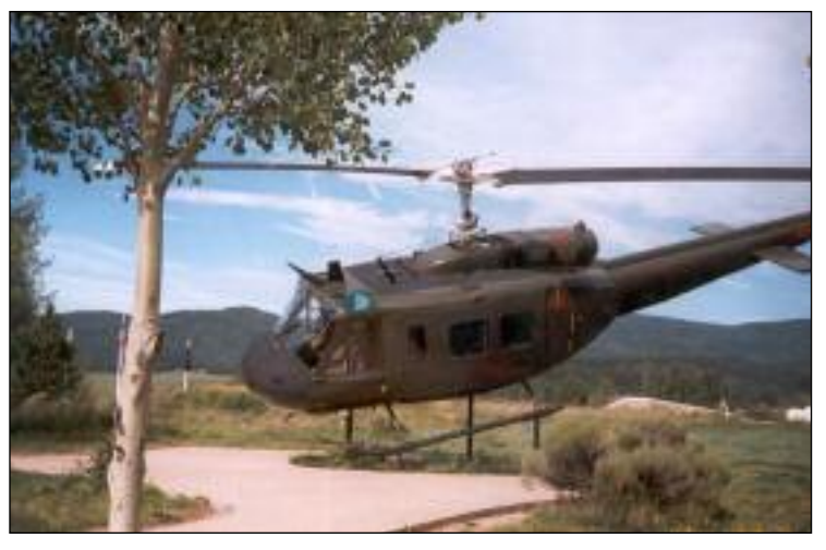
An Army helicopter static display is the first site for visitors to Angelfire as they enter the memorial's parking lot.