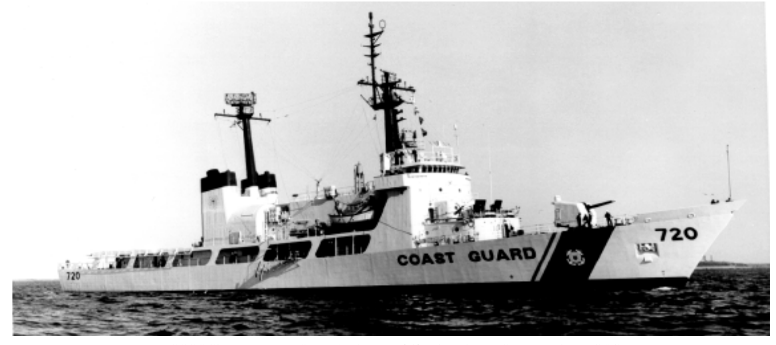
USCGC Sherman (WHEC-720) in August 1969

The enemy vessel, which our radar tracked, was on a course between north and northwest at about 10 knots and when the firing stopped it was still underway at 10 knots. I remember looking at the radar scope on the bridge of Sherman and noted