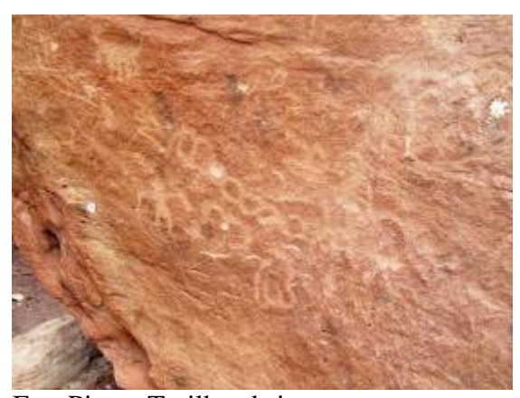
Fort Pierce Trailhead site

We then traveled east about 1 mile to a small site near the Fort Pierce trailhead. The petroglyphs were much eroded due to their exposed nature and the "poor" quality sandstone.