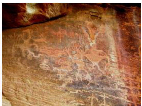
High Panel 3 High Panel 3

The end destination was the Red Man pictograph.