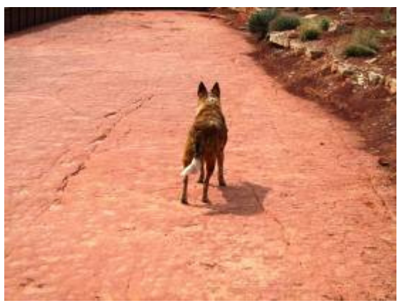
The group at the Dinosaur Tracks