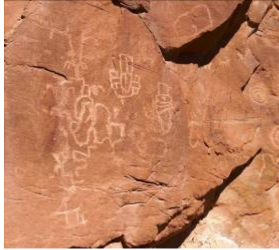
High Panel 1