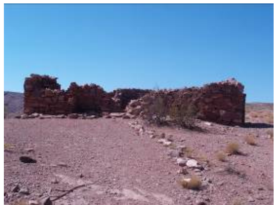
Ft. Pierce Ruin