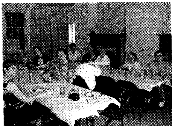
Enjoying lunch in the Receiving Room .